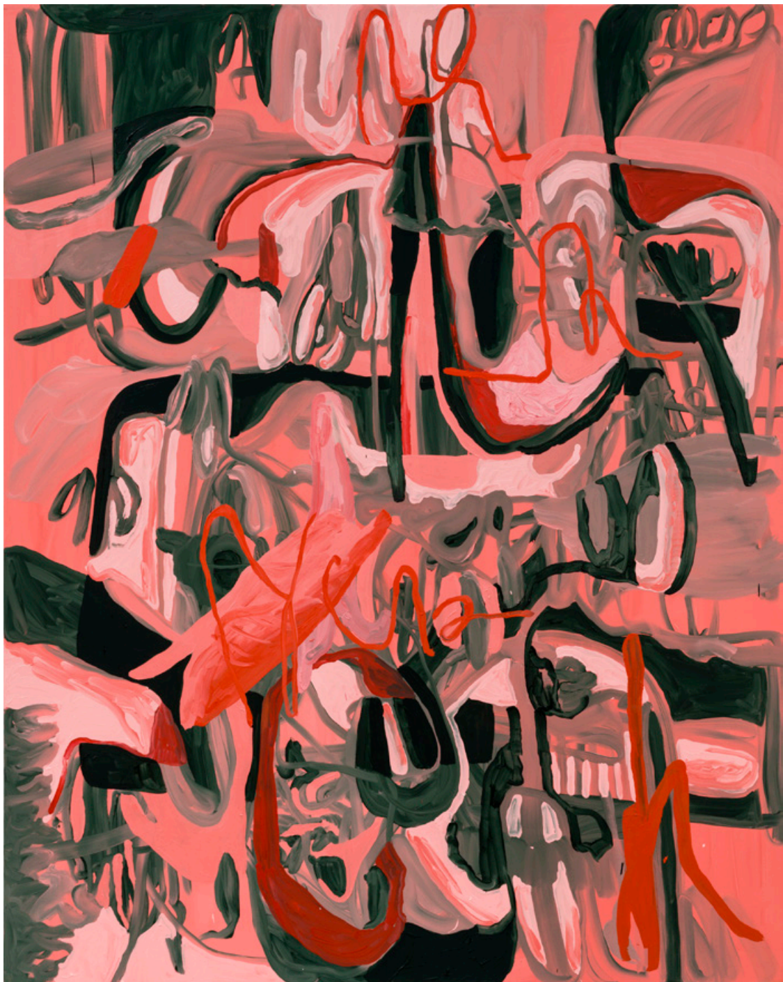
Jana Schröder Specshift CAM M1 , 2020 Oil on canvas 78 3/4 x 63 in 200 x 160 cm (JSR21.015)