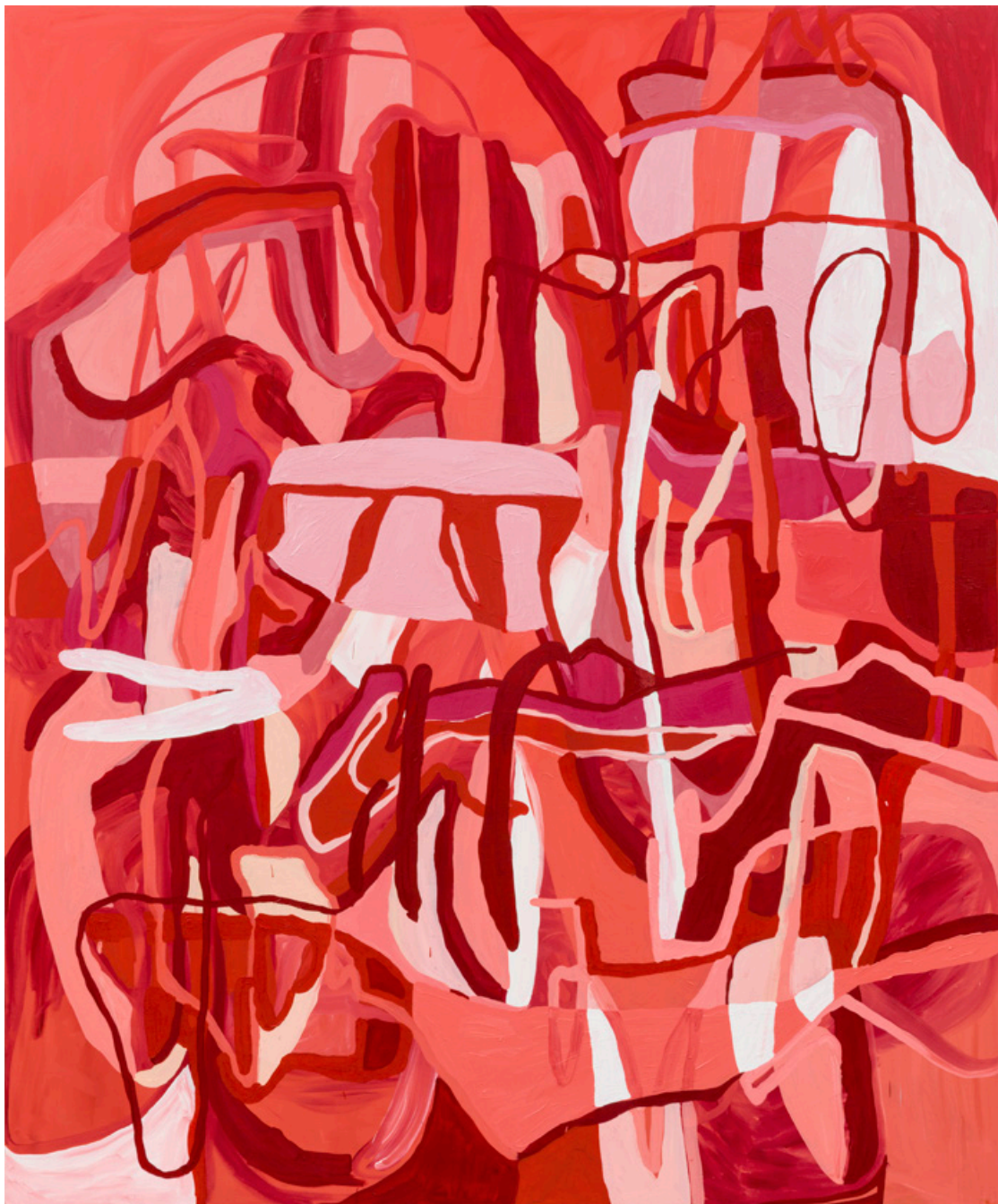
Jana Schröder Specshift L9 , 2020 Oil on canvas 94 1/2 x 78 3/4 in 240 x 200 cm (JSR21.014)