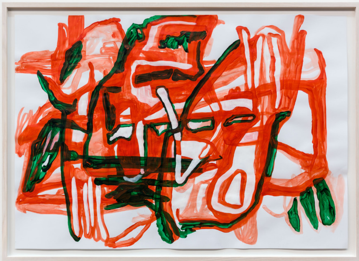
Jana Schröder B&T rg4 , 2021 Acrylic and oil on canvas 39 3/8 x 27 1/2 in 100 x 70 cm (JSR21.022)