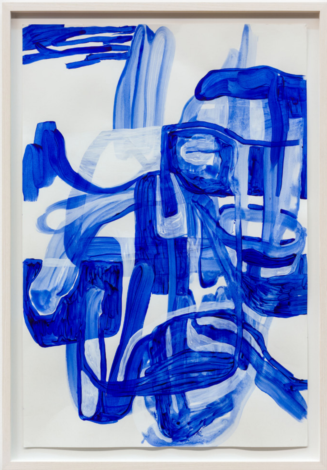
Jana Schröder B&T b 1 , 2020 Acrylic on paper 27 1/2 x 19 3/4 in 70 x 50 cm (JSR21.004)