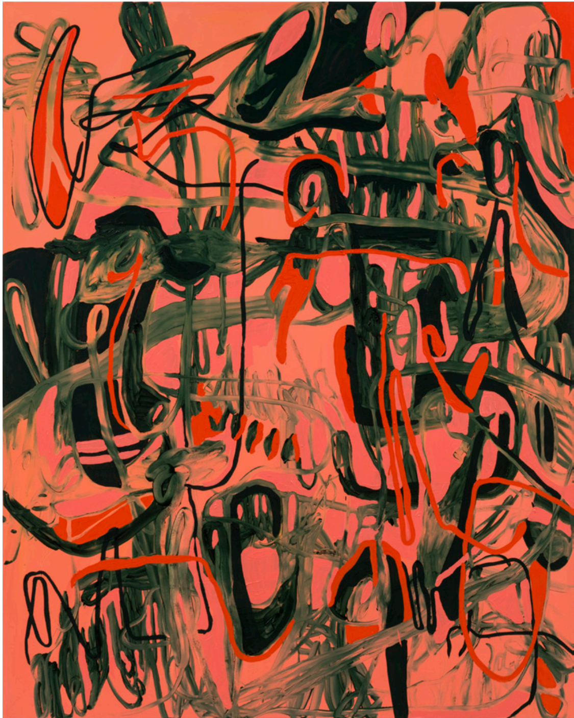
Jana Schröder Specshift CAM M2 , 2020 Oil on canvas 78 3/4 x 63 in 200 x 160 cm (JSR21.018)