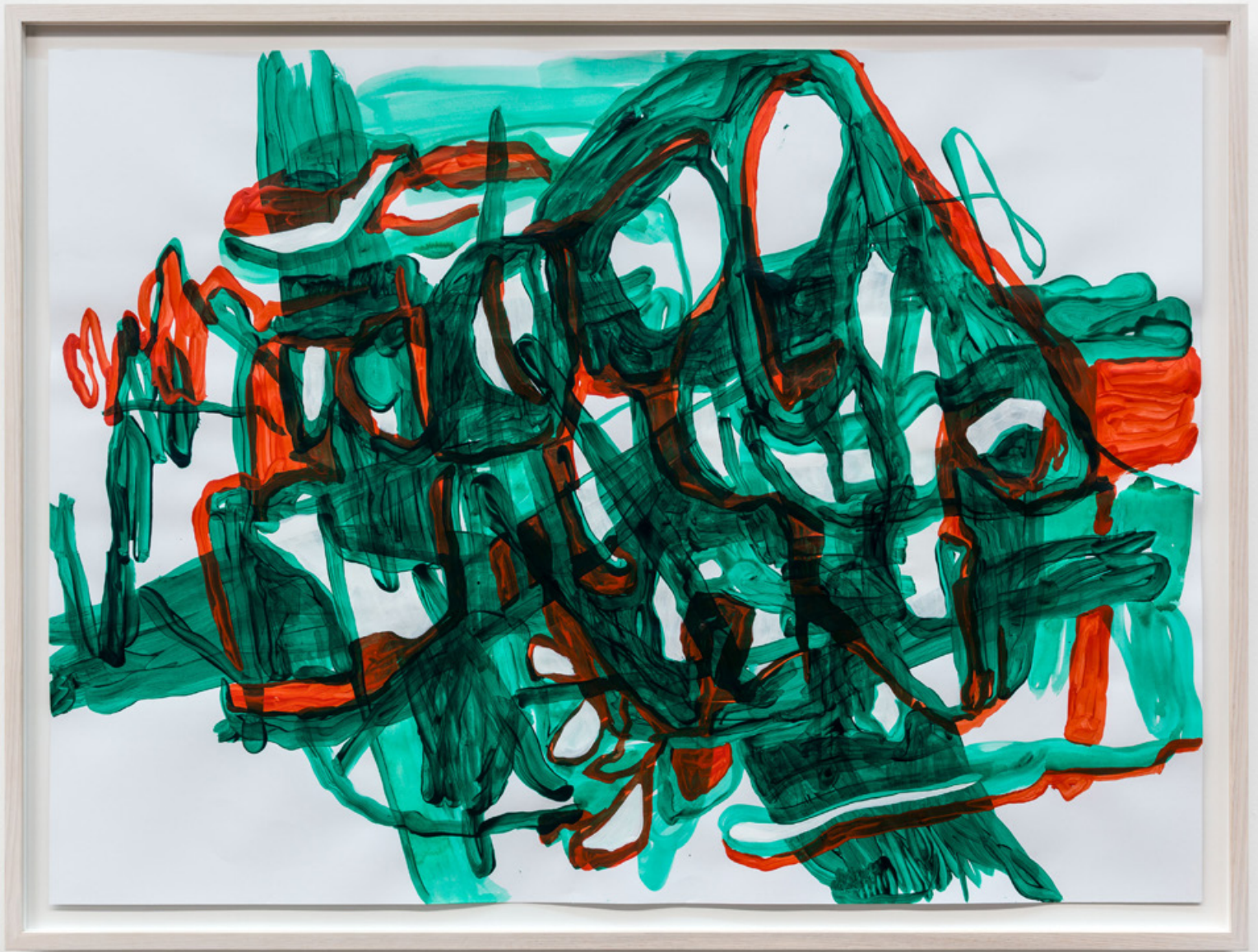
Jana Schröder B&T r/g 1 , 2021 Acrylic on paper 27 1/2 x 39 3/8 in 70 x 100 cm (JSR21.001)