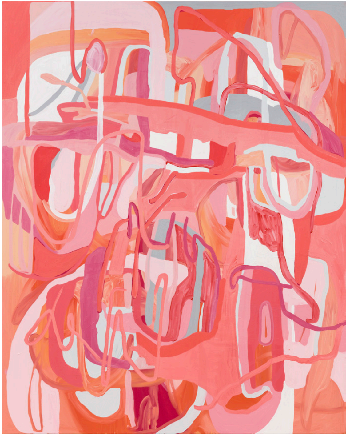
Jana Schröder Specshift M5 , 2020 Oil on canvas 78 3/4 x 63 in 200 x 160 cm (JSR21.021)