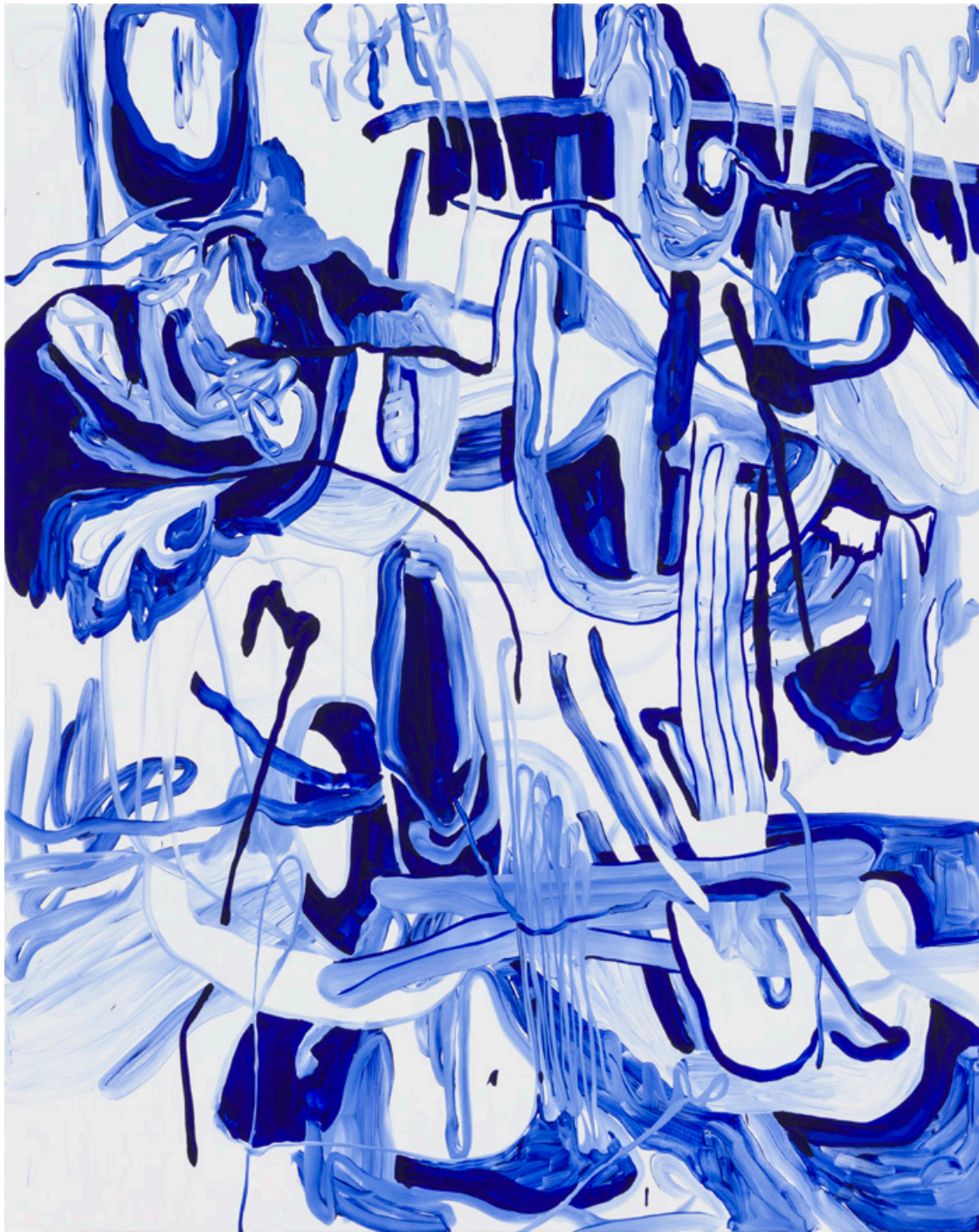
Jana Schröder Neurosox B M2 , 2021 Oil and lead on canvas 78 3/4 x 63 in 200 x 160 cm (JSR21.012)