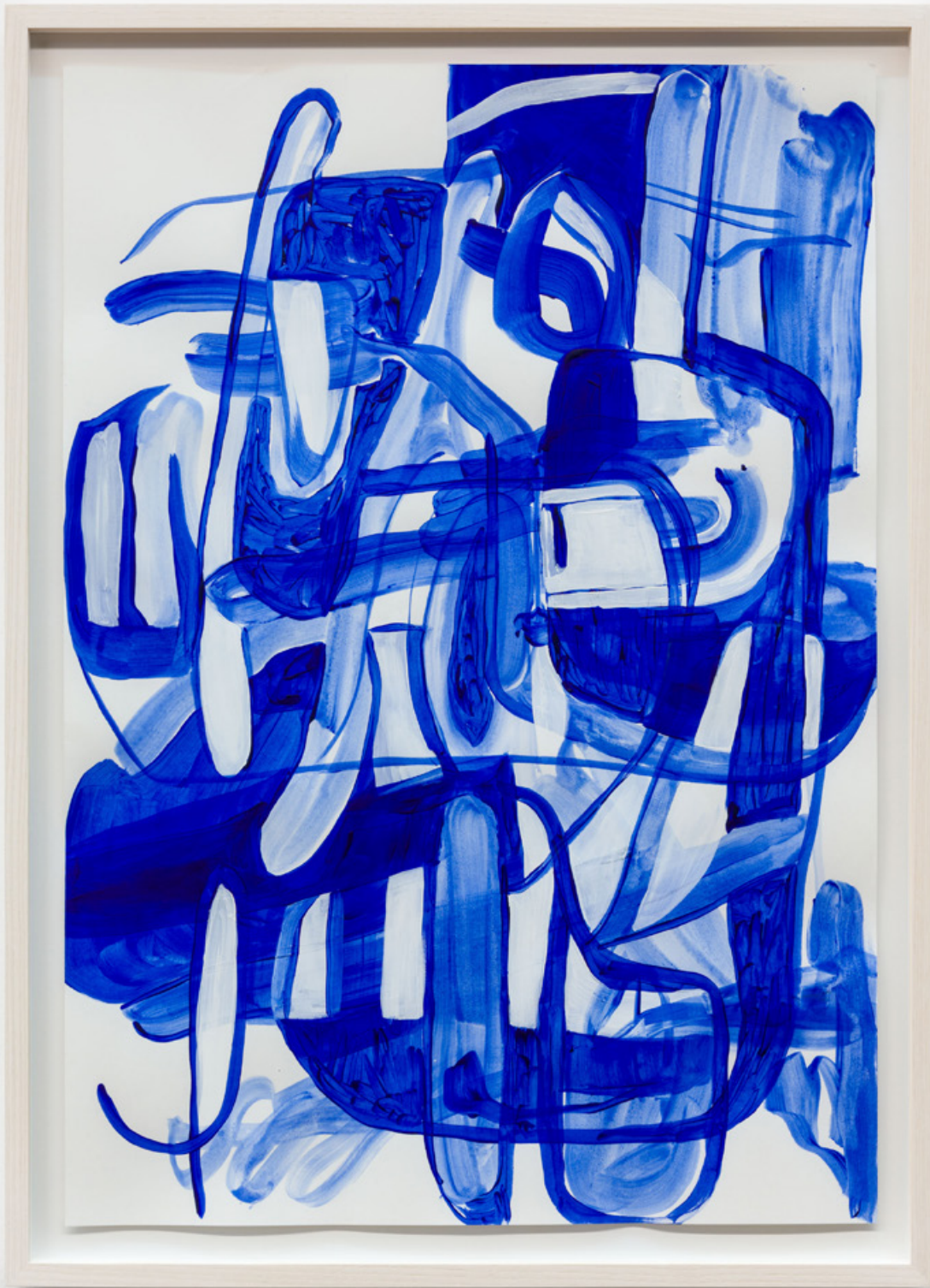
Jana Schröder B&T b 6 , 2020 Acrylic on paper 27 1/2 x 19 3/4 in 70 x 50 cm (JSR21.011)