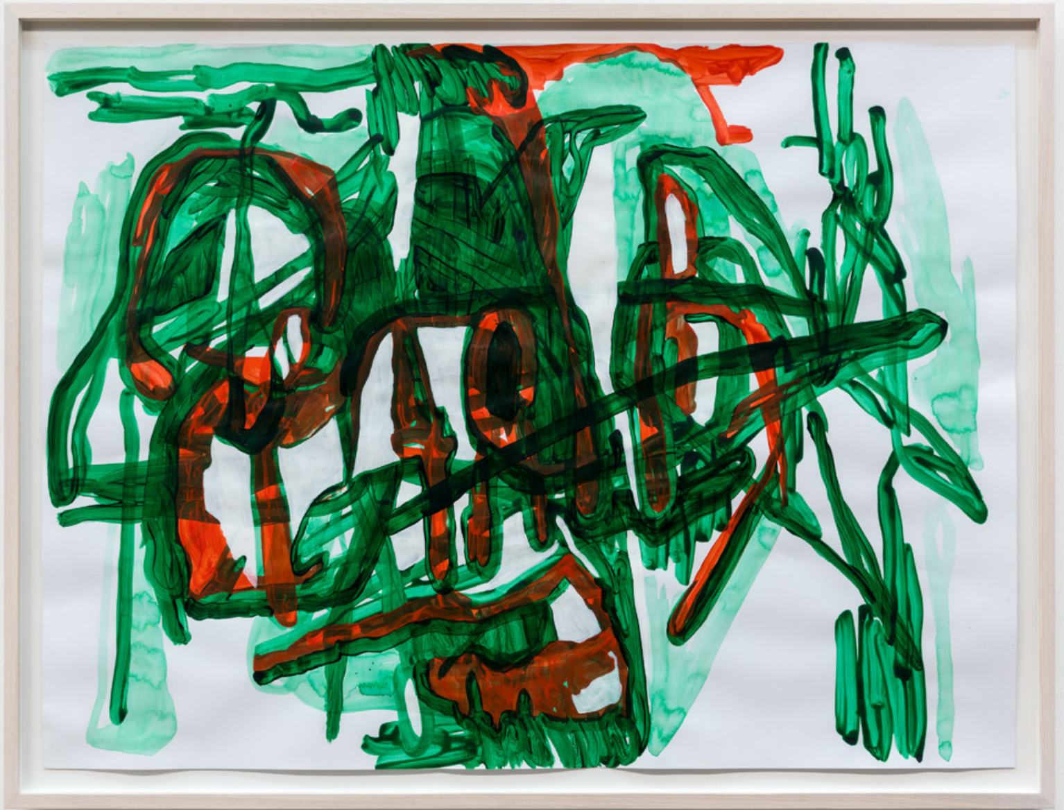
Jana Schröder B&T r/g 2 , 2021 Acrylic on paper 27 1/2 x 39 3/8 in 70 x 100 cm (JSR21.002)