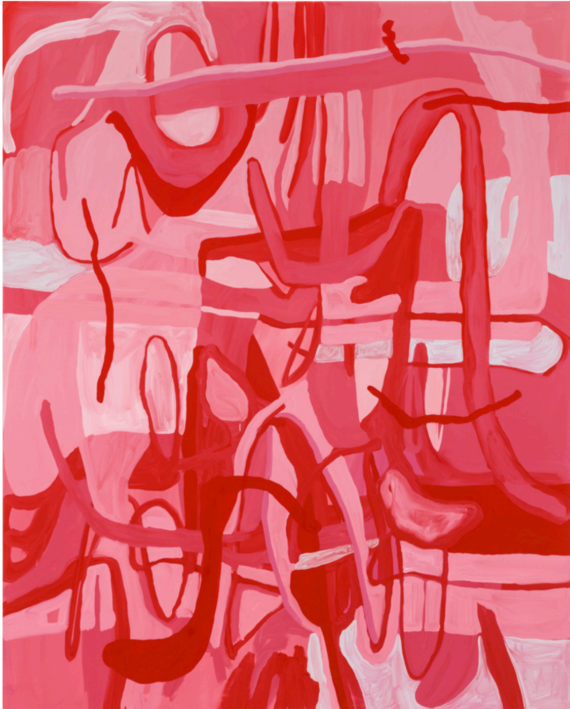
Jana Schröder Specshift M4 , 2020 Oil on canvas 78 3/4 x 63 in 200 x 160 cm (JSR21.020)