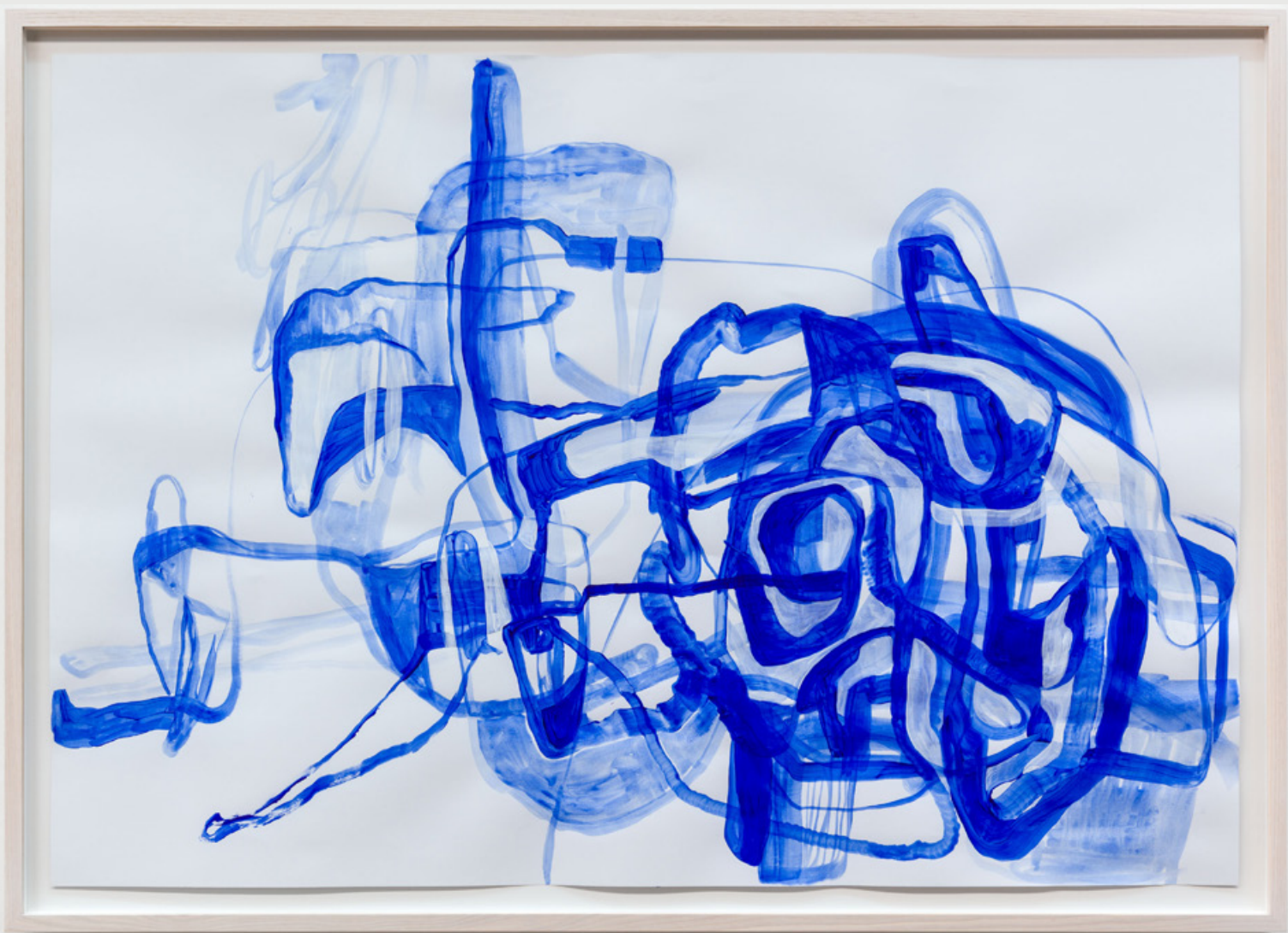
Jana Schröder B&T b 7 , 2021 Acrylic on paper 27 1/2 x 39 3/8 in 70 x 100 cm (JSR21.010)