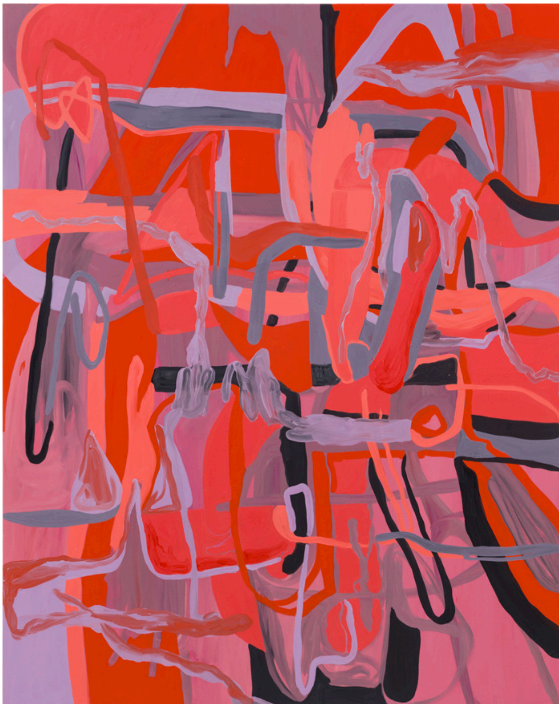
Jana Schröder Specshift M2 , 2020 Oil on canvas 78 3/4 x 63 in 200 x 160 cm (JSR21.019)