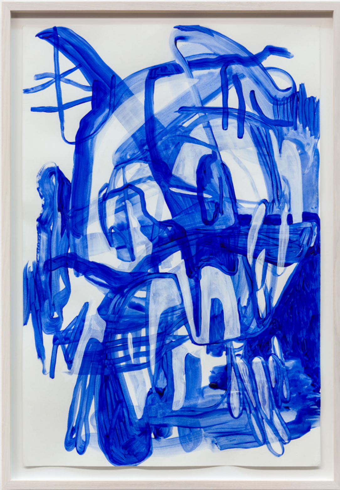
Jana Schröder B&T b 2 , 2020 Acrylic on paper 27 1/2 x 19 3/4 in 70 x 50 cm (JSR21.007)