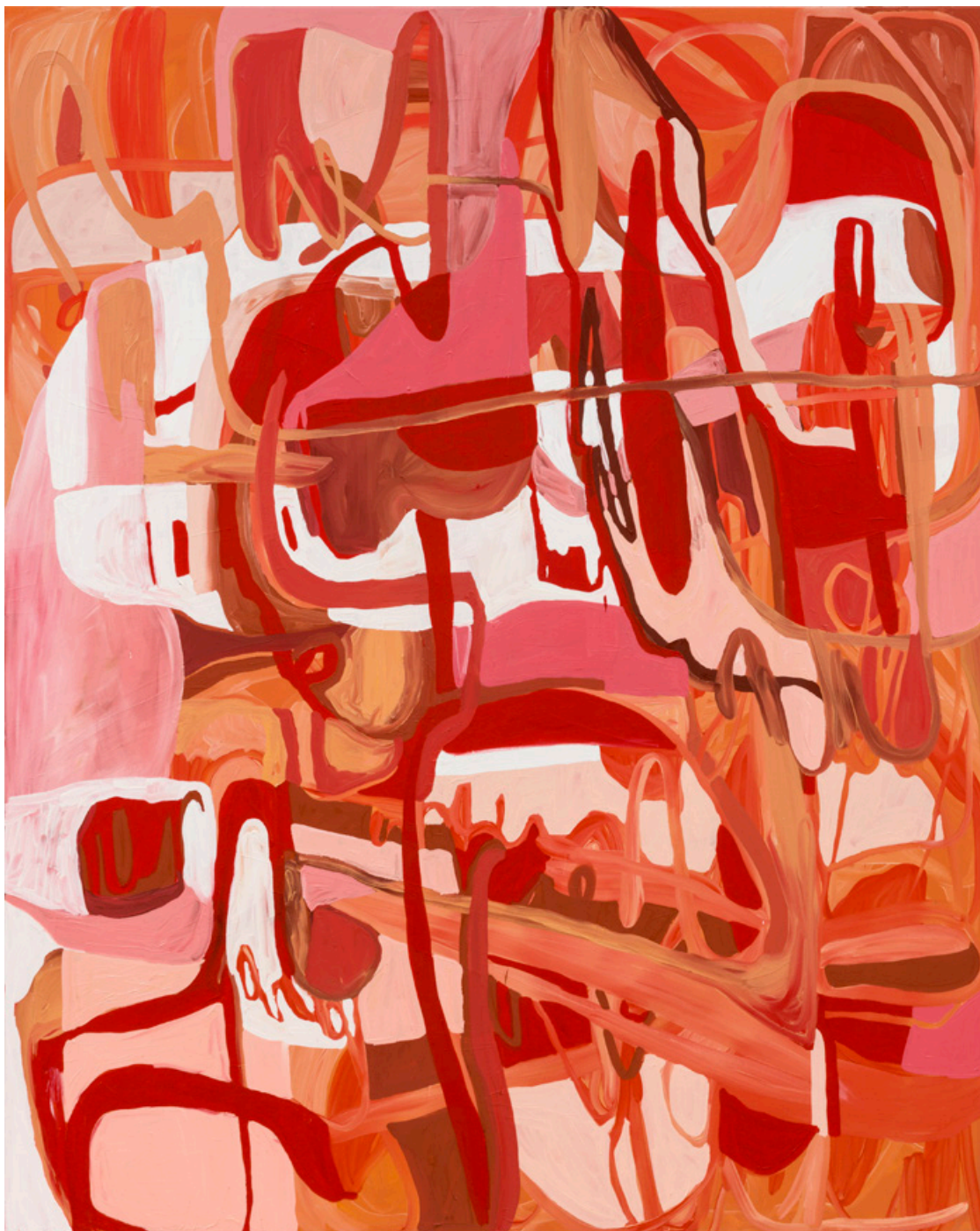
Jana Schröder Specshift M1 , 2020 Oil on canvas 78 3/4 x 63 in 200 x 160 cm (JSR21.016)