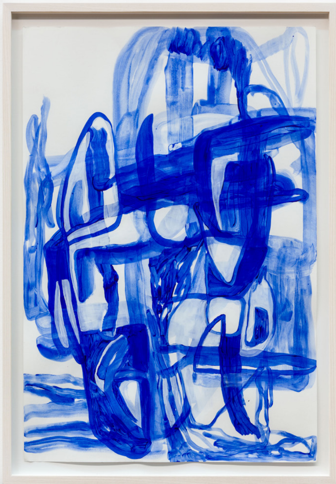
Jana Schröder B&T b 4 , 2020 Acrylic on paper 27 1/2 x 19 3/4 in 70 x 50 cm (JSR21.008)