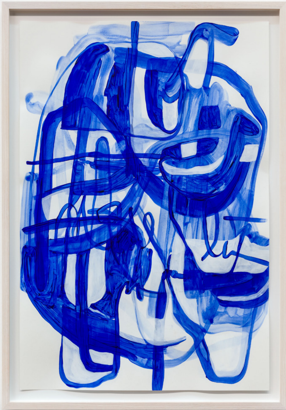
Jana Schröder B&T b 3 , 2020 Acrylic on paper 27 1/2 x 19 3/4 in 70 x 50 cm (JSR21.006)