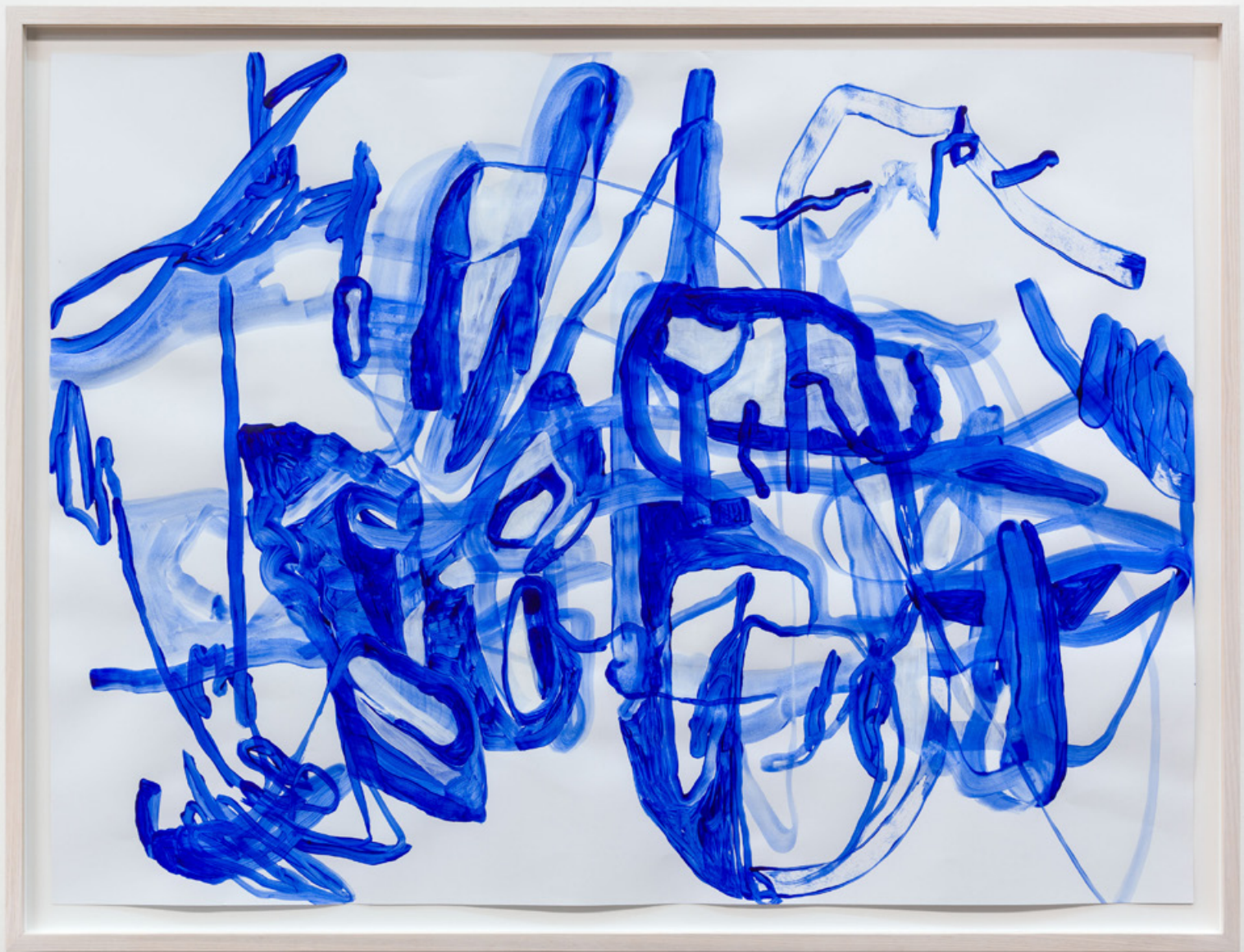
Jana Schröder B&T b 8 , 2020 Acrylic on paper 27 1/2 x 39 3/8 in 70 x 100 cm (JSR21.003)