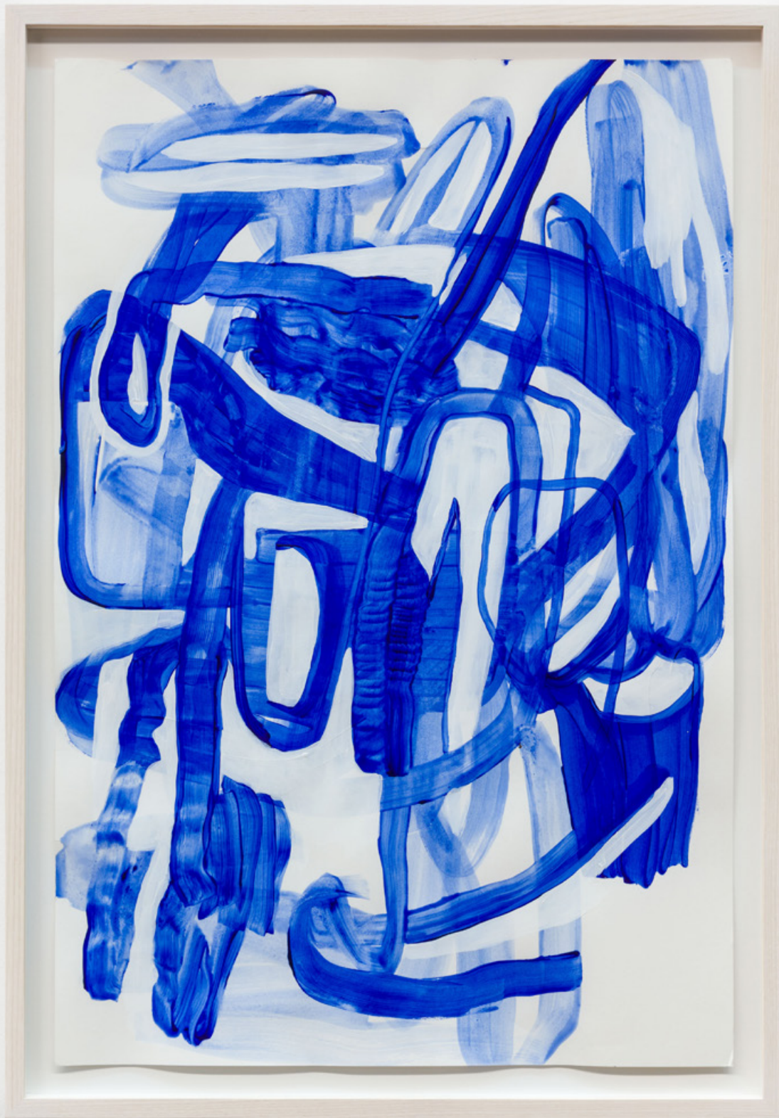
Jana Schröder B&T b 5 , 2020 Acrylic on paper 27 1/2 x 19 3/4 in 70 x 50 cm (JSR21.005)