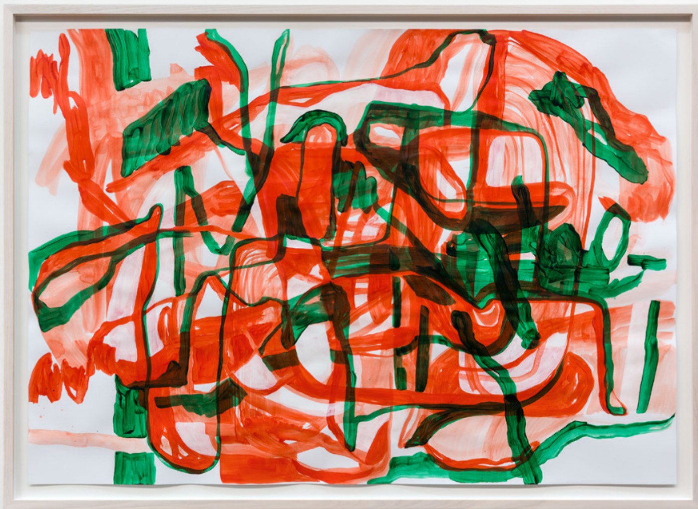
Jana Schröder B&T r/g 3 , 2021 Acrylic on paper 27 1/2 x 39 3/8 in 70 x 100 cm (JSR21.009)