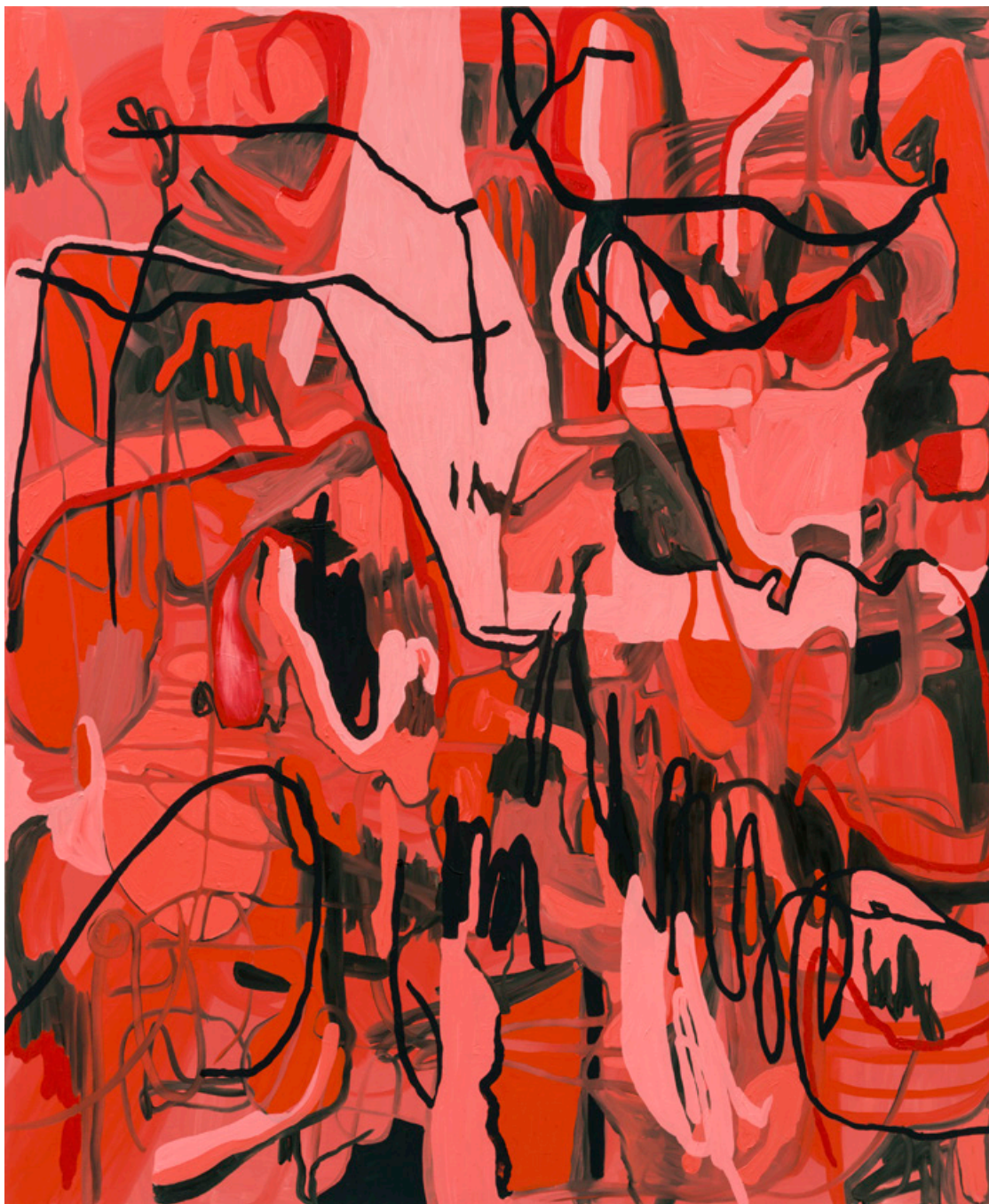
Jana Schröder Specshift L8 , 2020 Oil on canvas 94 1/2 x 78 3/4 in 240 x 200 cm (JSR21.017)