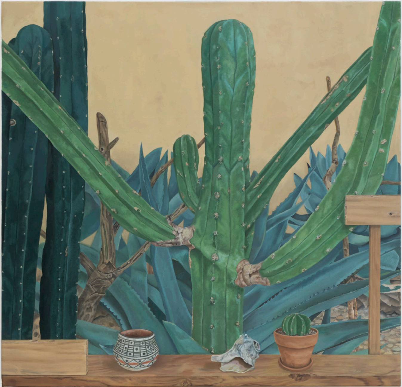
Corner Lot , 2020-21 Oil on linen 30 x 30 in 76.2 x 76.2 cm (MCL21.008)