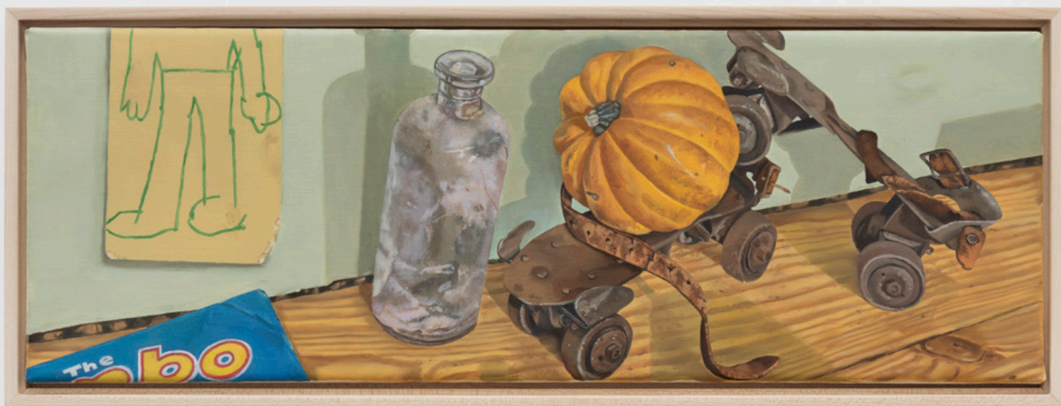
Shelf Stack , 2020 Oil on linen 8 x 22 in 20.3 x 55.9 cm (MCL21.005)