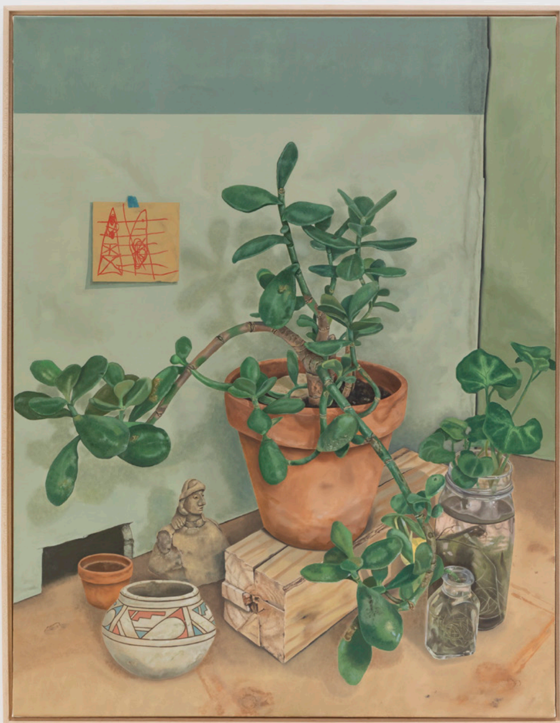
Still Remain , 2020 Oil on linen 40 x 30 in 101.6 x 76.2 cm (MCL21.003)