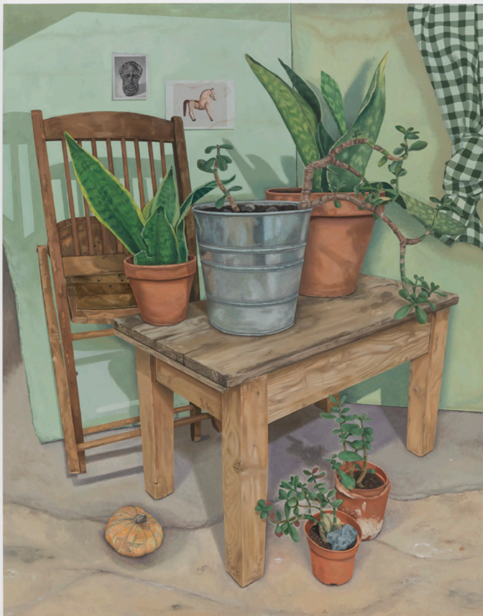
Table Edge , 2020-2021 Oil on linen 60 x 45 in 152.4 x 114.3 cm (MCL21.001)