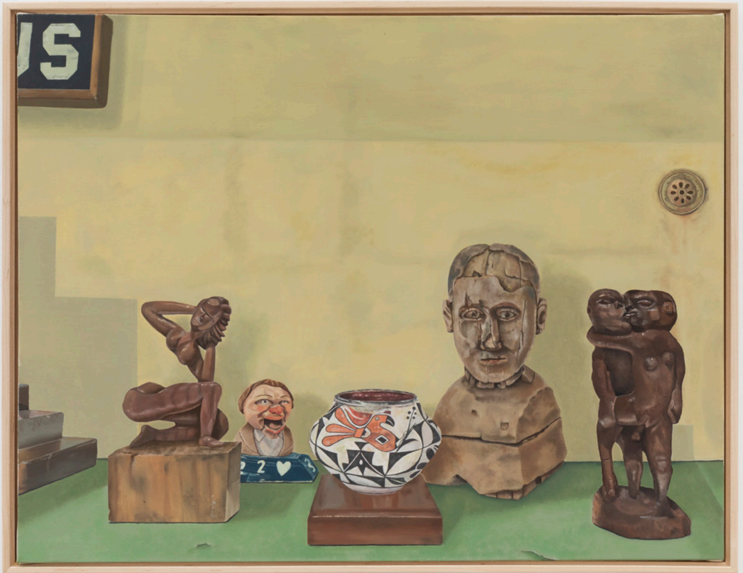
Closer , 2020 Oil on linen 24 x 30 in 61 x 76.2 cm (MCL21.006)