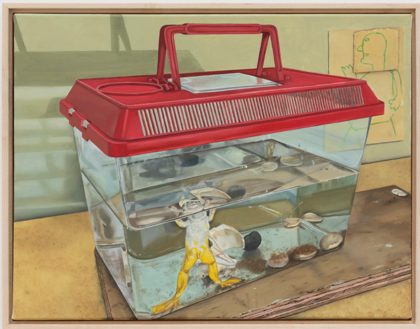
Frog , 2020 Oil on linen 16 x 20 in 40.6 x 50.8 cm (MCL21.004)