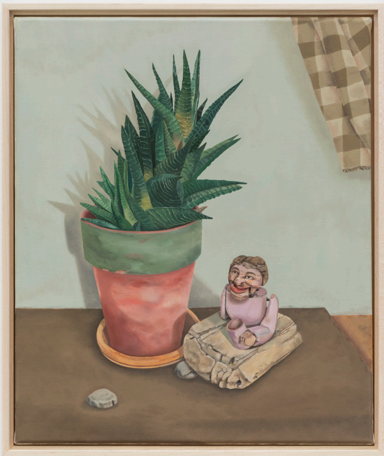
Together , 2020-21 Oil on linen 20 x 16 in 50.8 x 40.6 cm (MCL21.007)