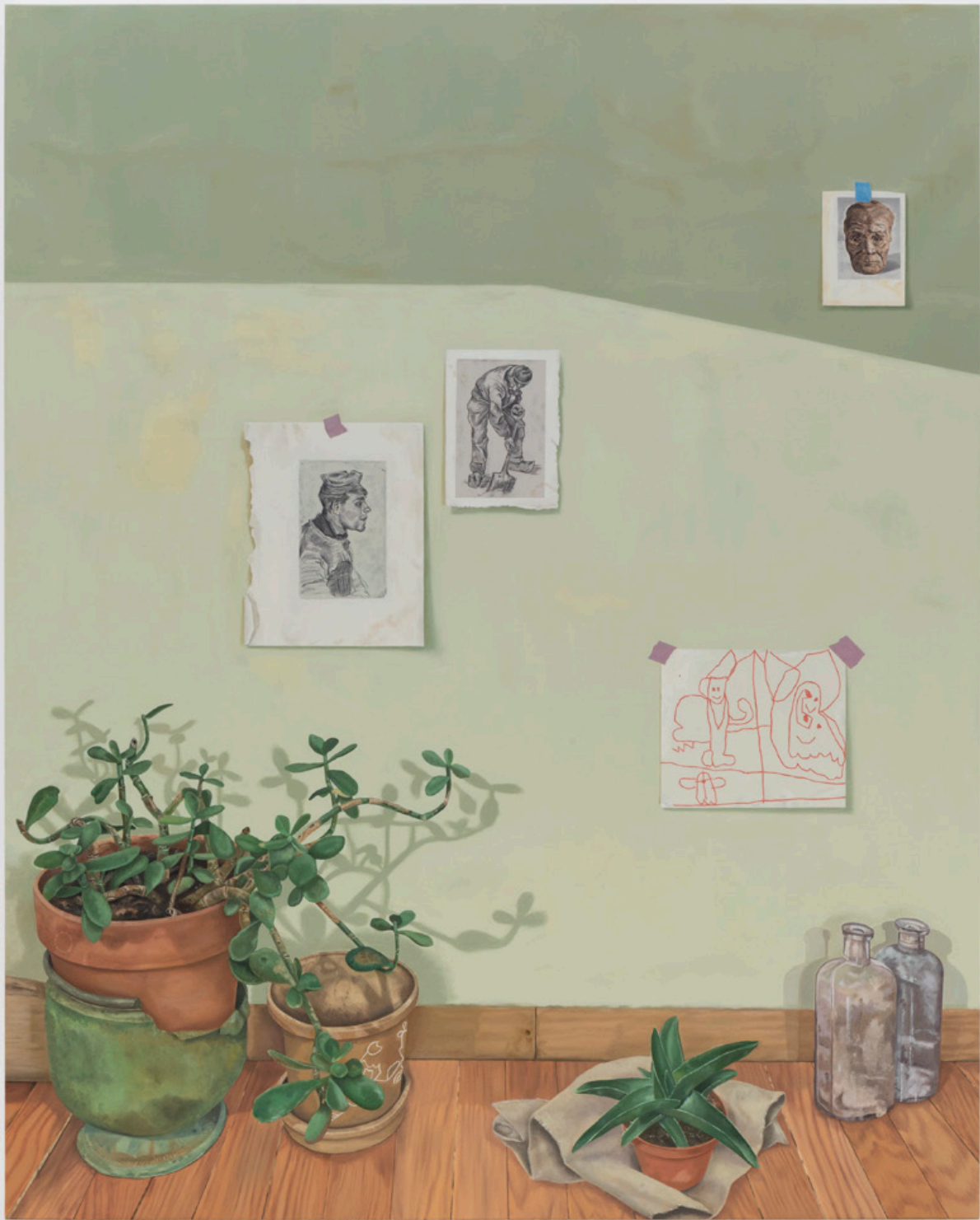
The Back Wall , 2021 Oil on linen 58 x 45 in 147.3 x 114.3 cm (MCL21.002)