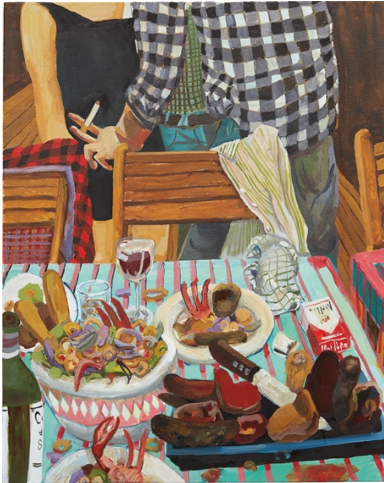
Celeste Dupuy-Spencer (1979), Ceviche and Peruvian Meat, 2011. Oil on canvas, 76.2 x 61 cm. (30 x 24 in.). Price Realized: $23,750 (Estimate: $10,000-15,000).