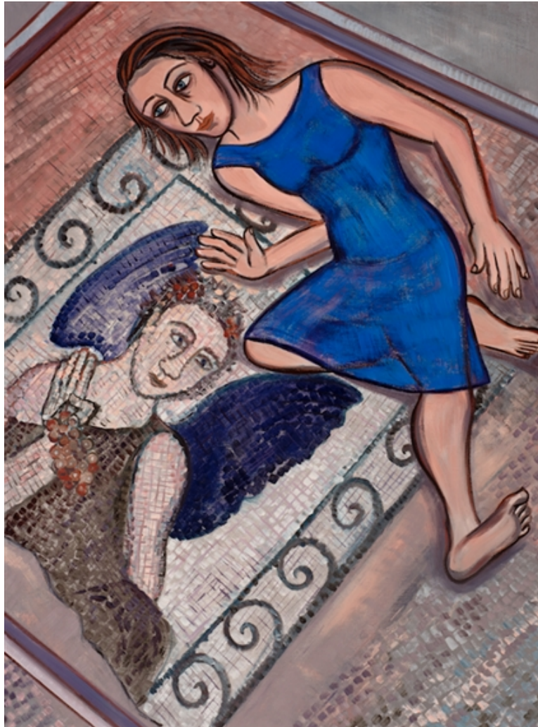
Eileen Cooper (1953), Under The Same Moon , 2017. Oil on canvas, 122 x 92 cm. Exhibited at the Letitia Gallery, Beirut.

"I think the best way to find out more about the contemporary art world is to experience it for yourself... immerse yourself in it," says Annie Vartivarian, co-founder of Letitia Gallery , a new contemporary gallery opening in Beirut in February. "Attend gallery openings, museum exhibitions, talks, auctions and if possible visit artist's studios. This experience will not only give you a perspective on which artists are relevant and popular in today's market but, also the price ranges in contemporary art, where you can acquire it and consider how good an investment the work might be now and in the future".