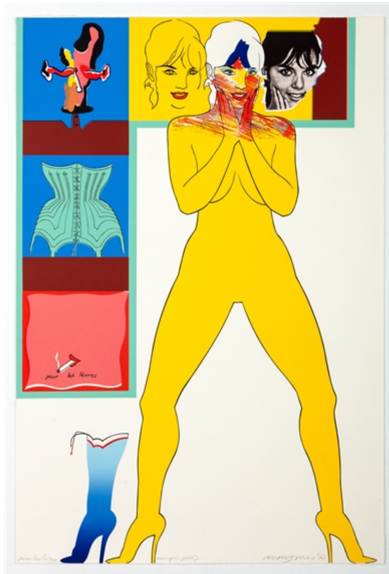
Allen Jones (1937), Pour Les Levres, 1965. Oil on canvas, 76.5 x 50.8 cm. (30 1/8 x 20 in.).