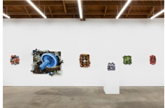
Installation view: GEST, Nino Mier Gallery, Los Angeles, California, 2020-21.

The resulting show, which highlights 37 works from 10 different artists, builds upon Mier's wish for freedom and sensation. GEST's watercolors, drawings, stoneware sculptures, acrylic paintings, and collages express less an impulse towards a traditional Arthurian quest or quixotic caper than a yearning for a voyage wherein the wanderer may rediscover the joys of seeing and being seen, and the pleasures of touching and being touched. Stephanie Temma Hier's mellifluous Under the Volcano (2020) begins with a foundation of dry, porous stones, which frames a gorgeous painting of four hands grasping each