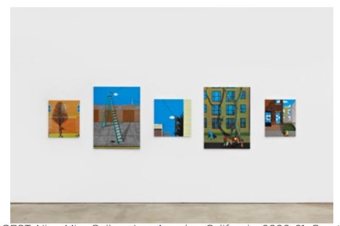
Installation view: GEST, Nino Mier Gallery, Los Angeles, California, 2020-21.

Blair Saxon-Hill's Untitled (Oyster, Pussy, Eye) (2020), similarly evokes a longing to enter a privileged world where we can look closely into the eyes of another person and be caressed without fear of death. This collage/watercolor reveals a fragmented head, face, mouth, hand, and vagina composed largely from cutouts of photographs of marble sculptures. An eye gazes directly at the viewer from what looks to be a little bronze kiln or helmet, and a pale swoop of hair cascades down to a perfectly formed ear and a dangling, painted mouth. In the middle of the visage, a stone hand caresses the pudendum. Oyster, Pussy, Eye recalls not only the sensual collages of Claude Cahun and Marcel Moore but also references the feeling that our eyes have been caged and our hands have turned hard and cold from so much disconnection.5