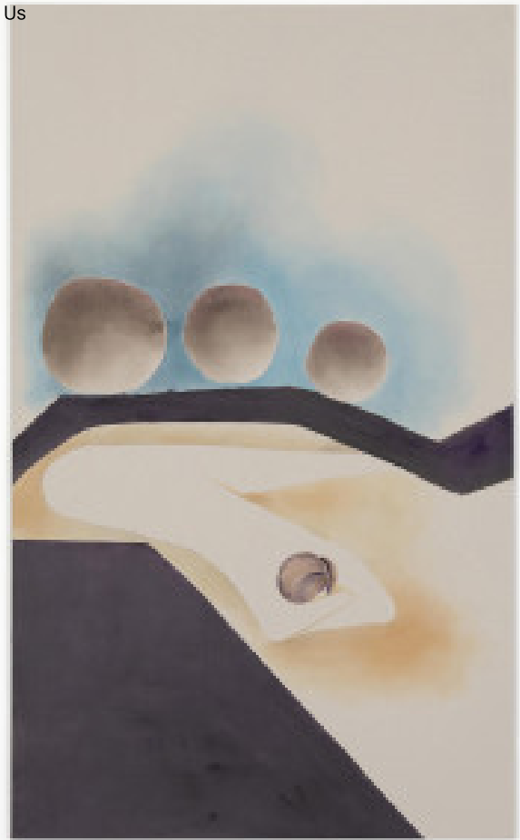
( http://moussemagazine.it/enrico-david-cielo-di-giugno-at-gio-marconi-milan-2021/ )