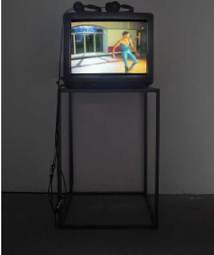
( http://moussemagazine.it/charles-atlas-ominous-glamorous-momentous-ridiculous-ica-milano-milan-2021/ )