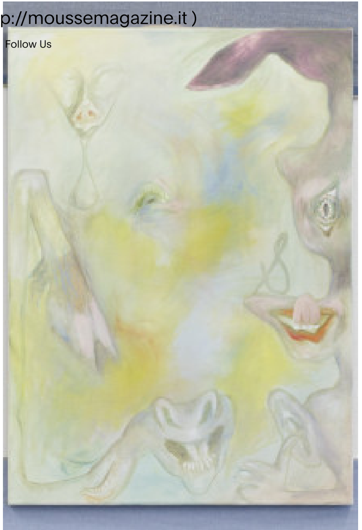
( http://mousse magazine.it/alison-yip-bare-heel-country-at-dortmunder-kunstverein-dortmund-2021/ )

Mousse Magazine and Publishing Corso di Porta Romana, 63, 20122 Milano, Italy T: +39 02 8356631 F: +39 02 49531400 E: info@mousse magazine.it P.IVA 05234930963