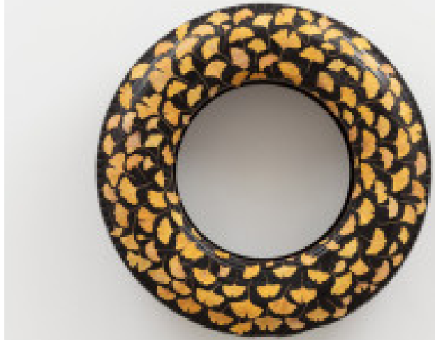
( http://moussemagazine.it/stewart-uoo-used-at-47-canal-new-york-2021/ )