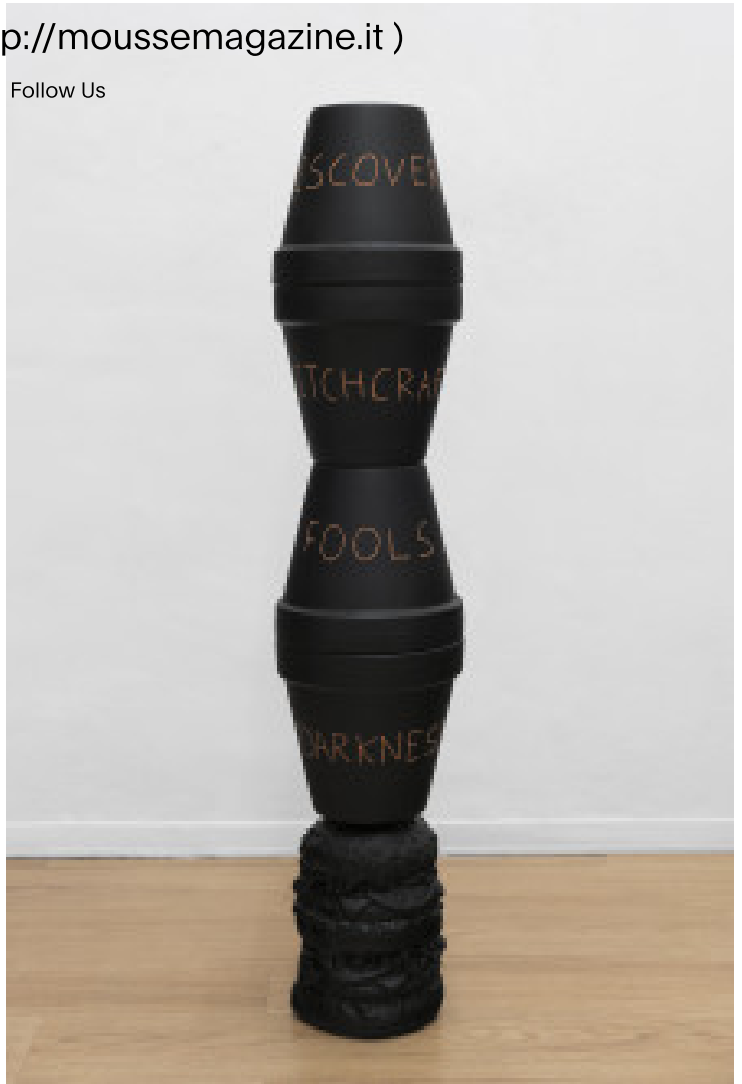
( http://moussemagazine.it/jason-gomez-terra-incognita-clima-milan/ )