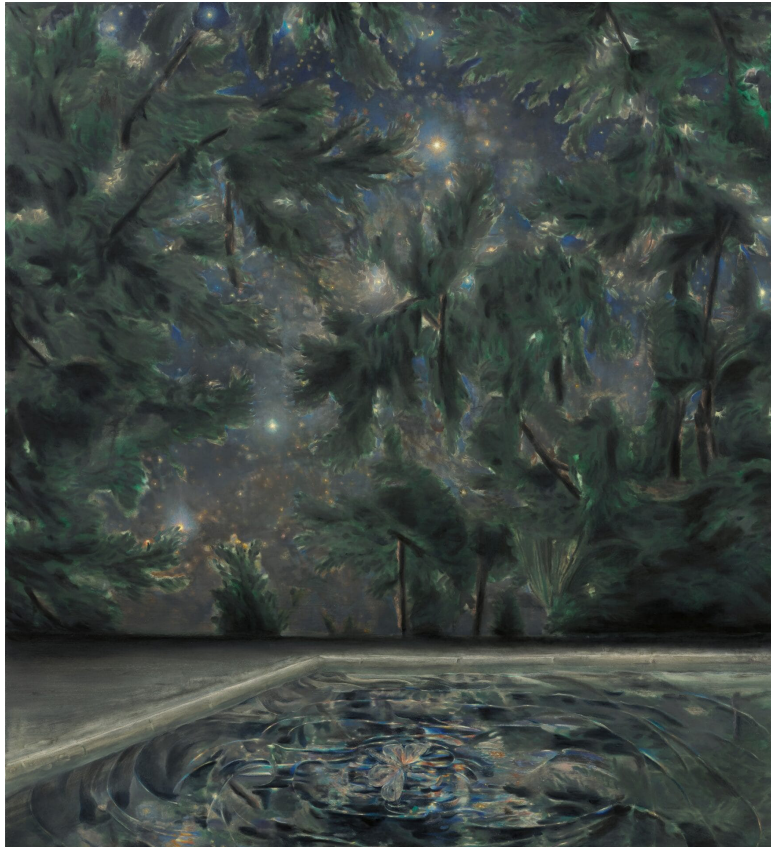
"Night Swim II."