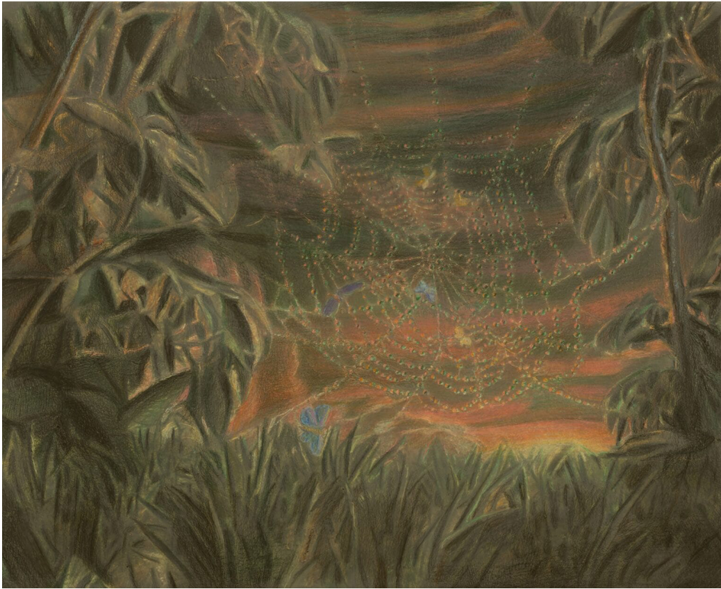
"Negative attention" (2026), colored pencil, oil color, and marble dust on linen, 13 x 16 inches.