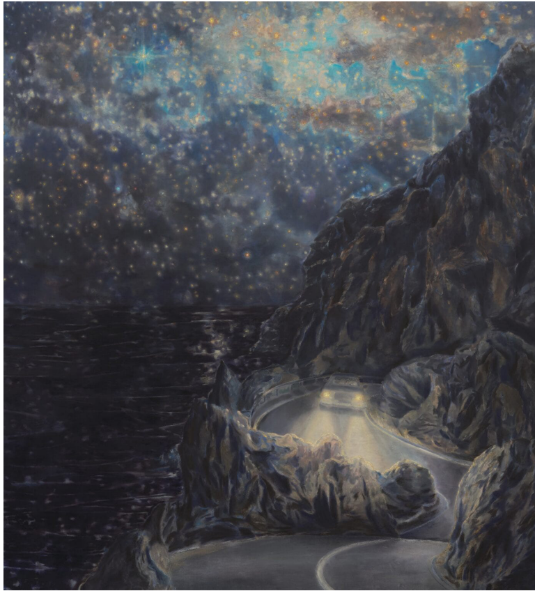
"While We Drive."