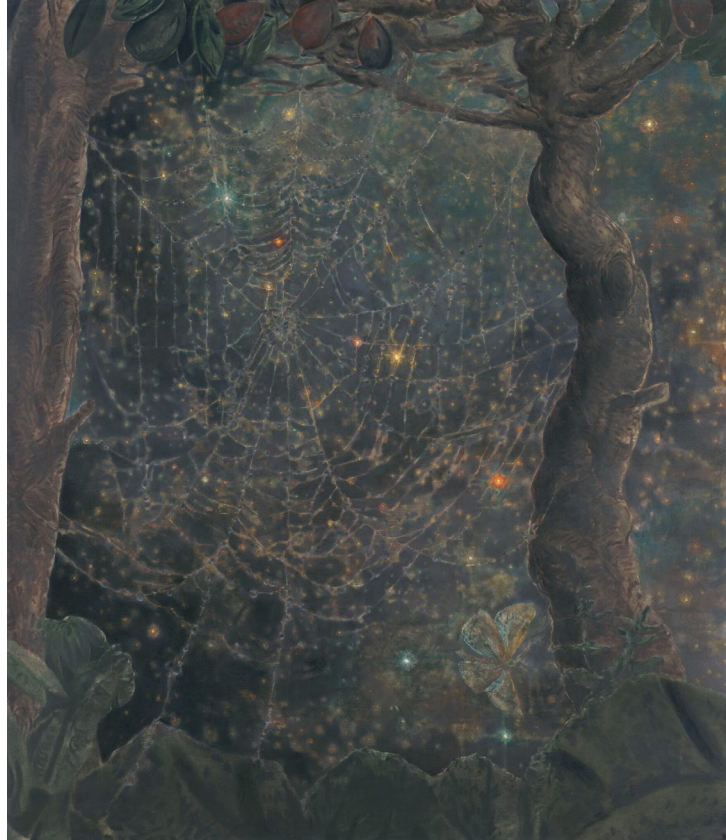
"Under the Radar."