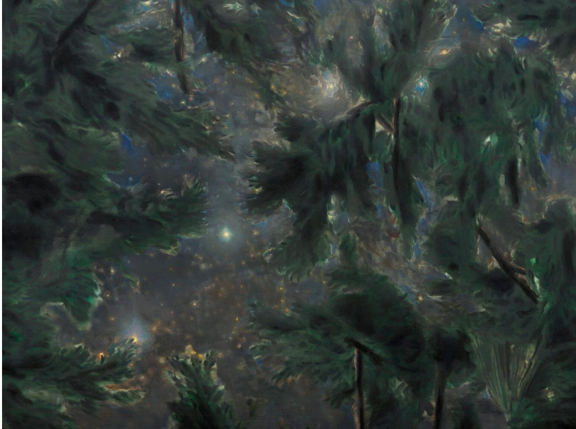
Detail of "Night Swim II."