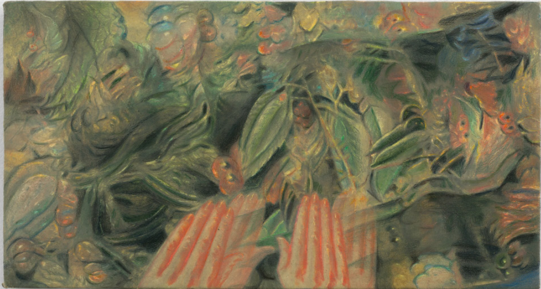
Marin Majić, Feverish (2026), colored pencil, oil color, and marble dust on linen, 8 x 15 inches (20.3 x 38.1 cm)

Surrealism was born from the same catastrophe as the disco ball — the conviction that liberation existed in spaces where logic loosened its grip. Majić is working in a different catastrophe but the same territory. His discotheques and landscapes feel exiled from a digital world that delivers horror in real time, framed and scrollable. These paintings offer the opposite, surfaces that require your physical presence, existing only in the encounter. Whether you step into his discotheques or landscapes or not, Majić's paintings, like his disco balls, continue scattering light.