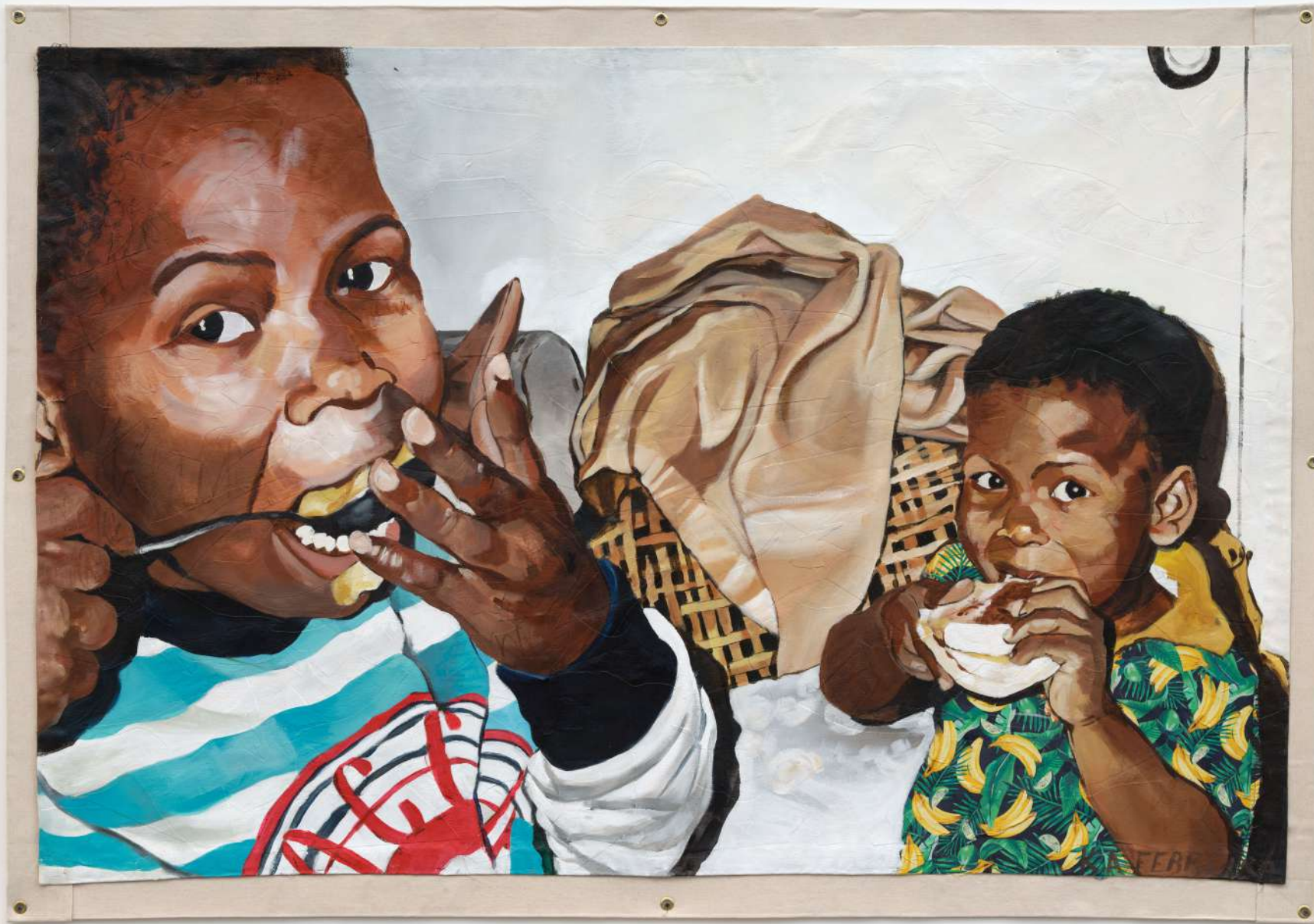
Full mouth full belly, 2022