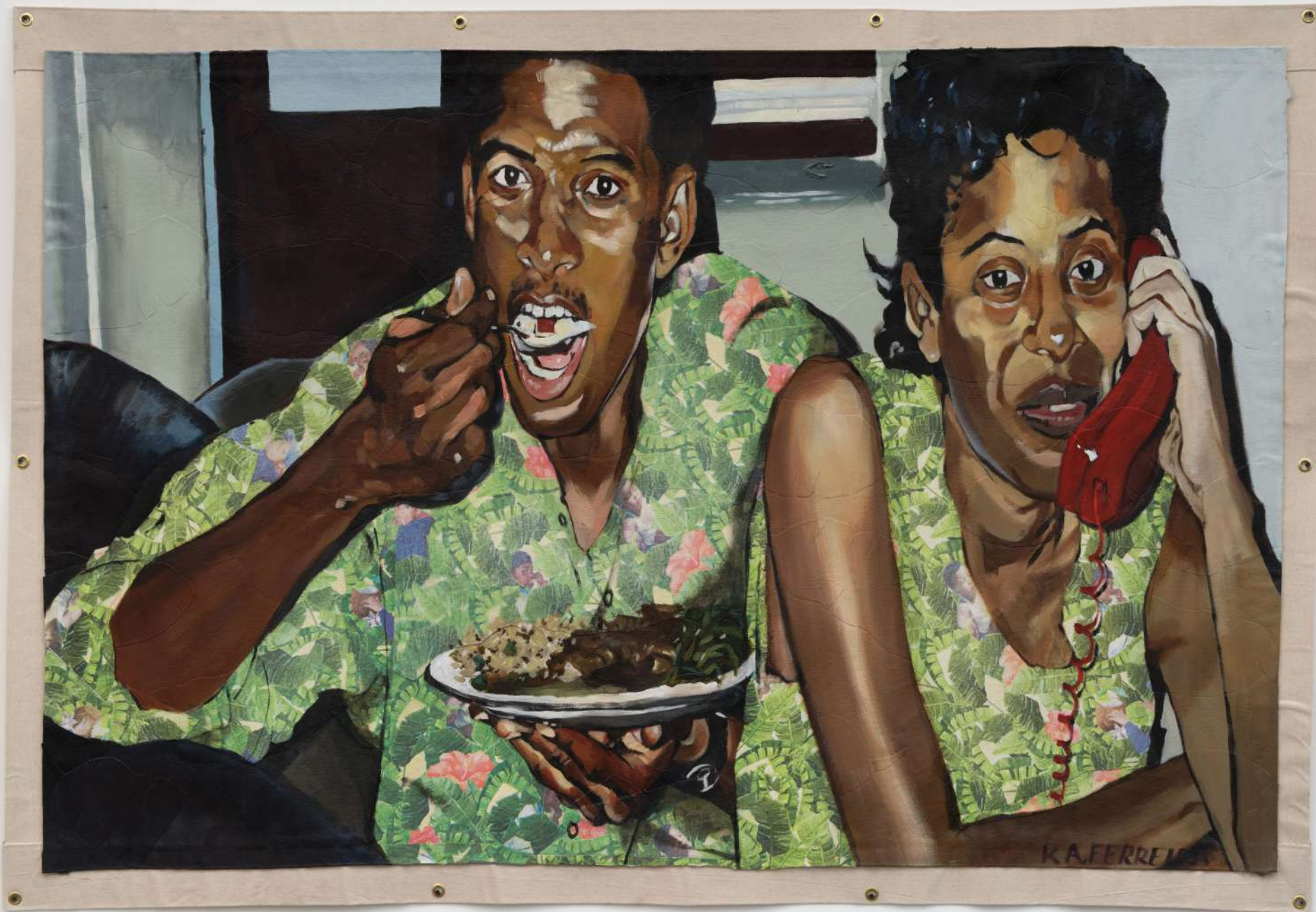
Get off the phone and come eat, 2022 Acrylic and mixed media on canvas 47 1/2 x 72 1/4 in 120.7 x 183.5 cm (KFE22.024)