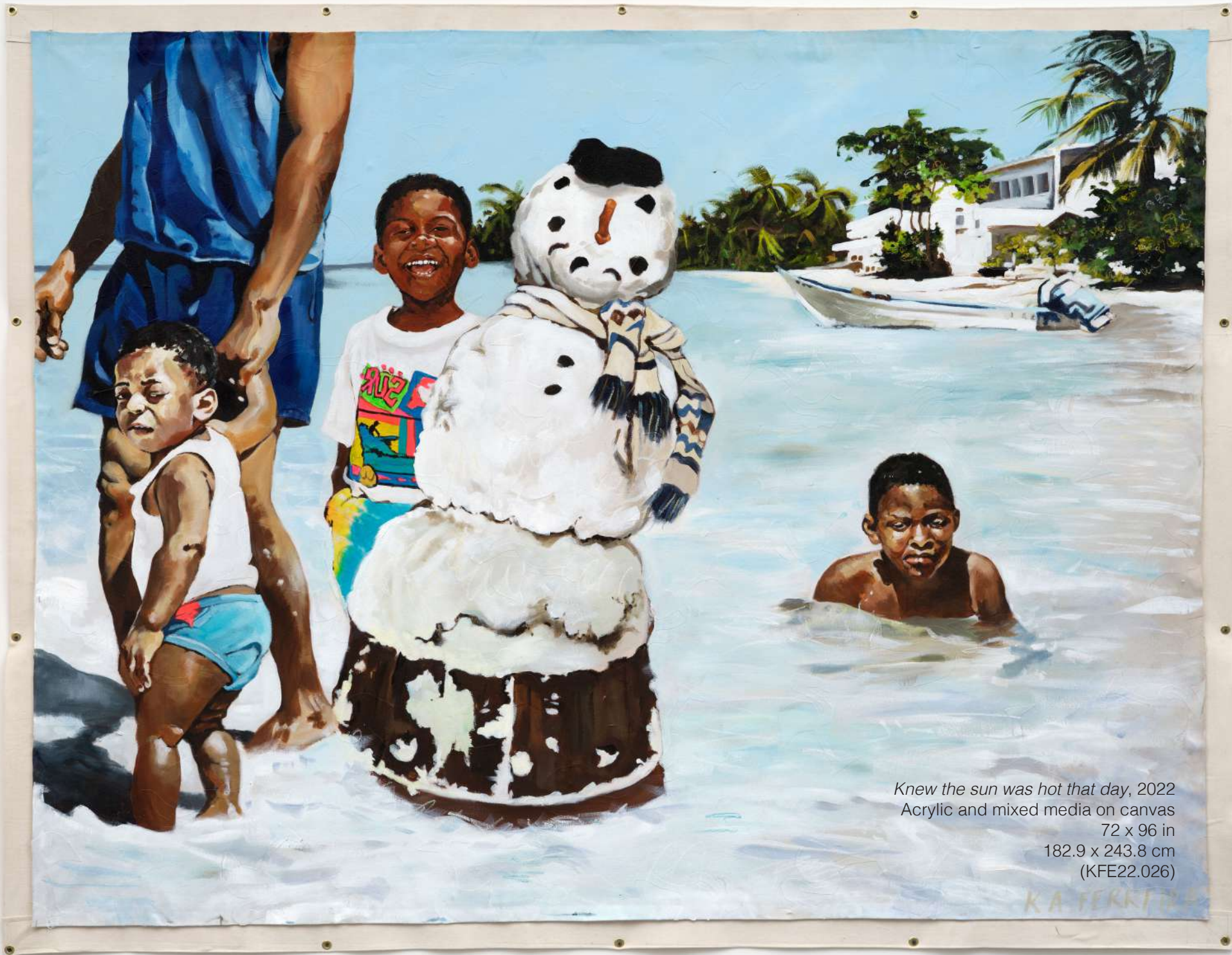
Knew the sun was hot that day, 2022 Acrylic and mixed media on canvas 72 x 96 in 182.9 x 243.8 cm (KFE22.026)