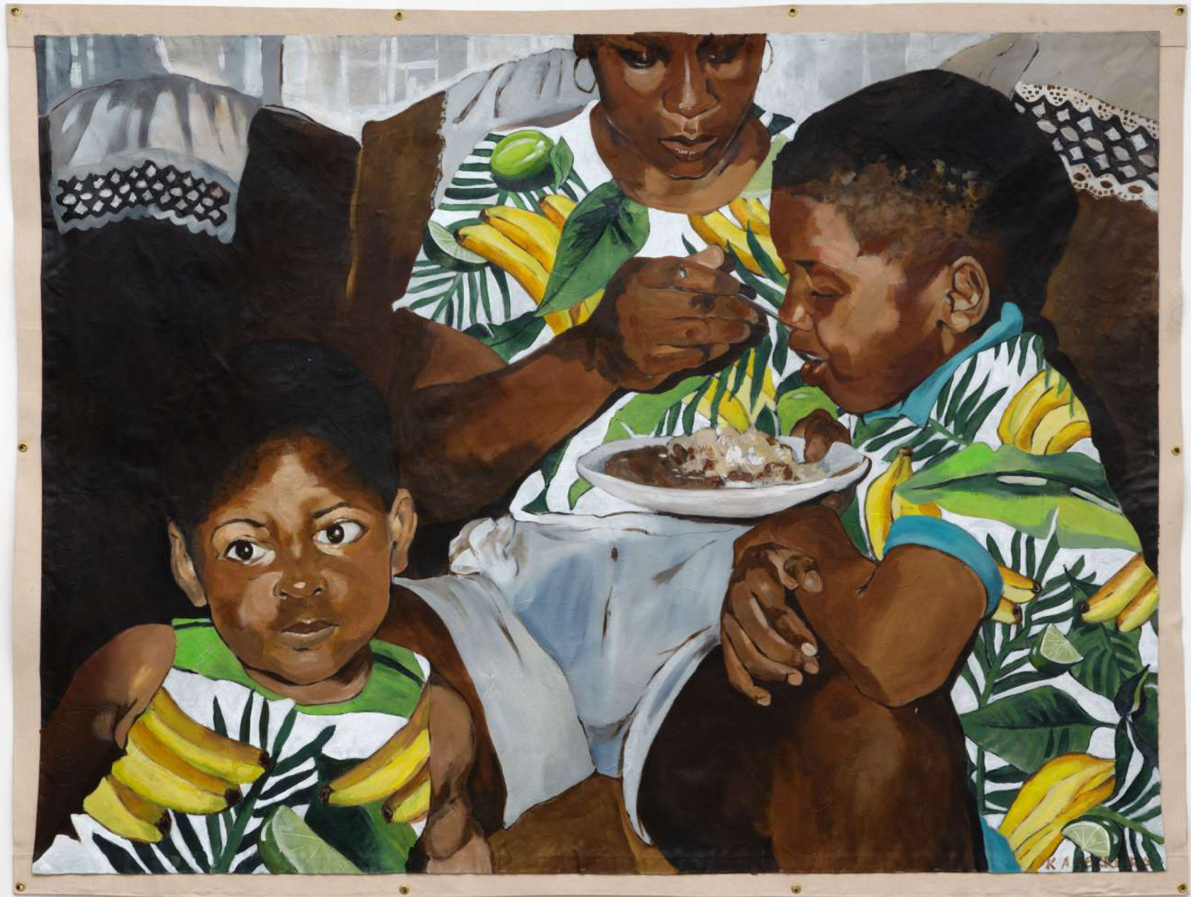
Caribbean Breast Feeding , 2022 Acrylic and mixed media on canvas 73 x 94 1/4 in 185.4 x 239.4 cm (KFE22.006)