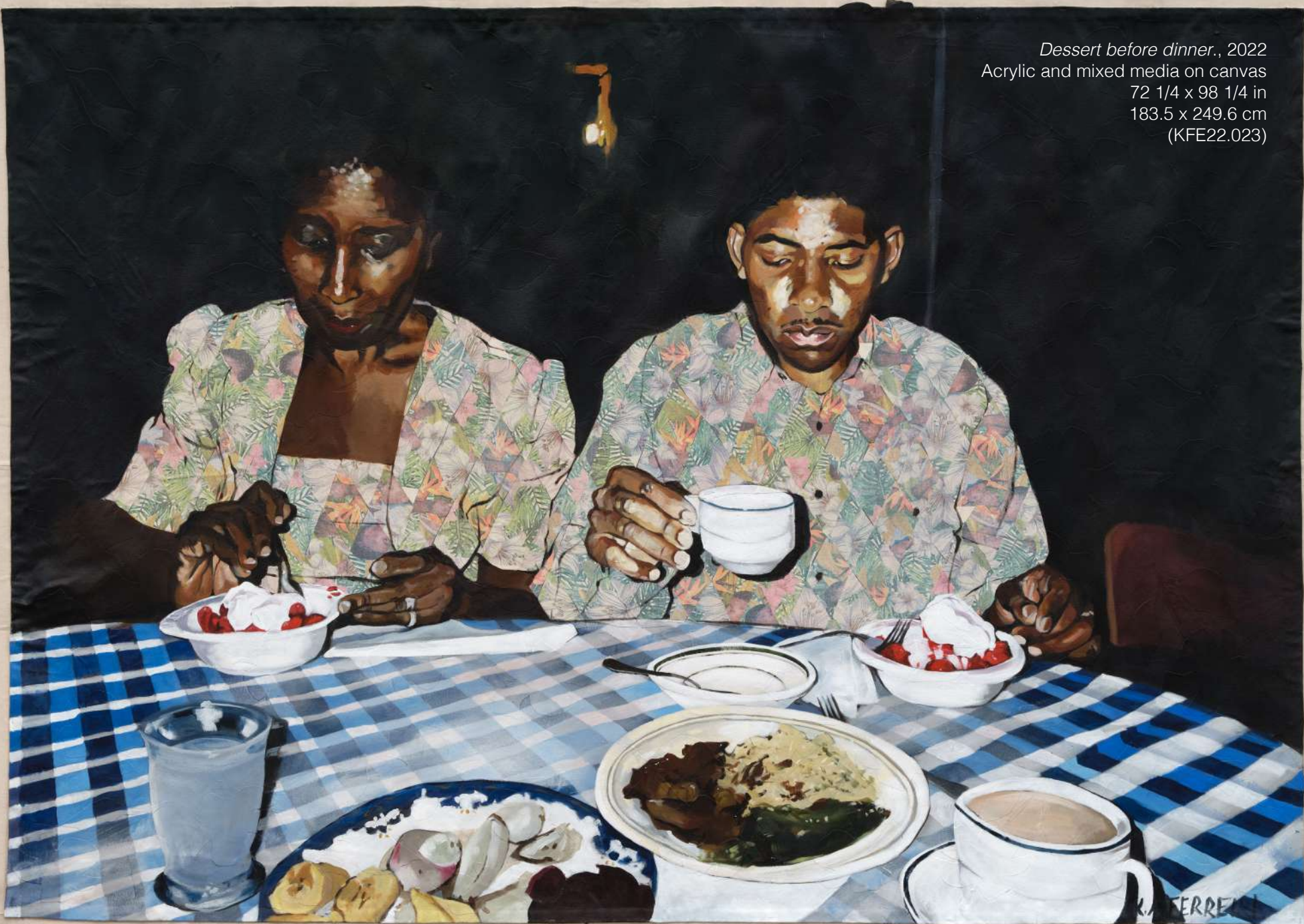
Dessert before dinner. , 2022 Acrylic and mixed media on canvas 72 1/4 x 98 1/4 in 183.5 x 249.6 cm (KFE22.023)