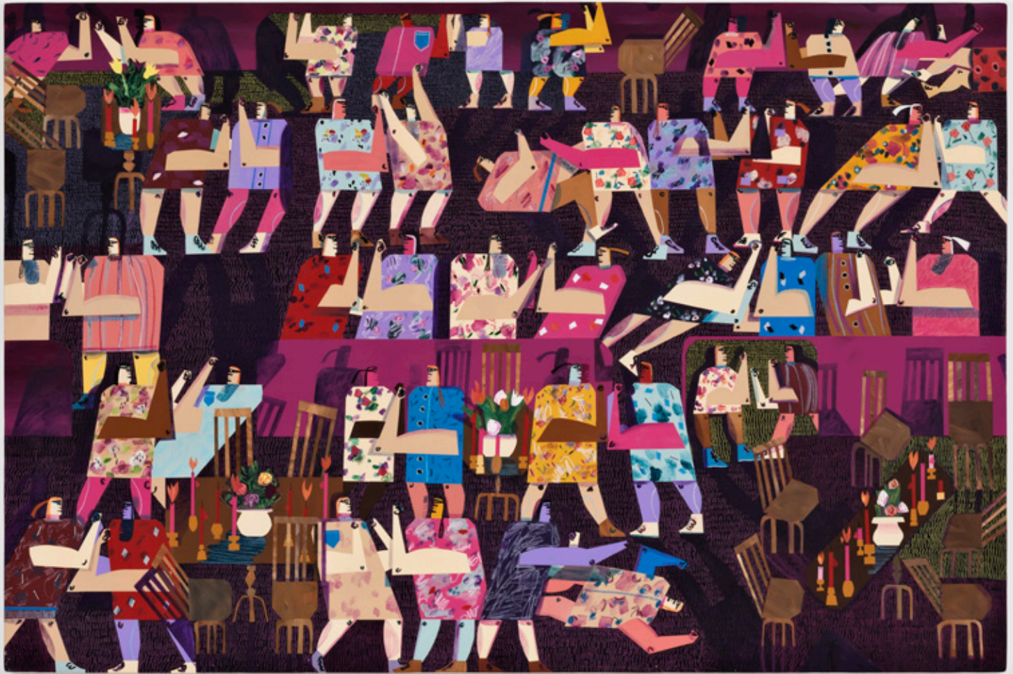
Andrea Joyce Heimer I Fight Myself Over And Over And Over And Over And Over Again., 2021 Acrylic and oil pastel on panel 40 x 60 in 101.6 x 152.4 cm (AJO21.005)