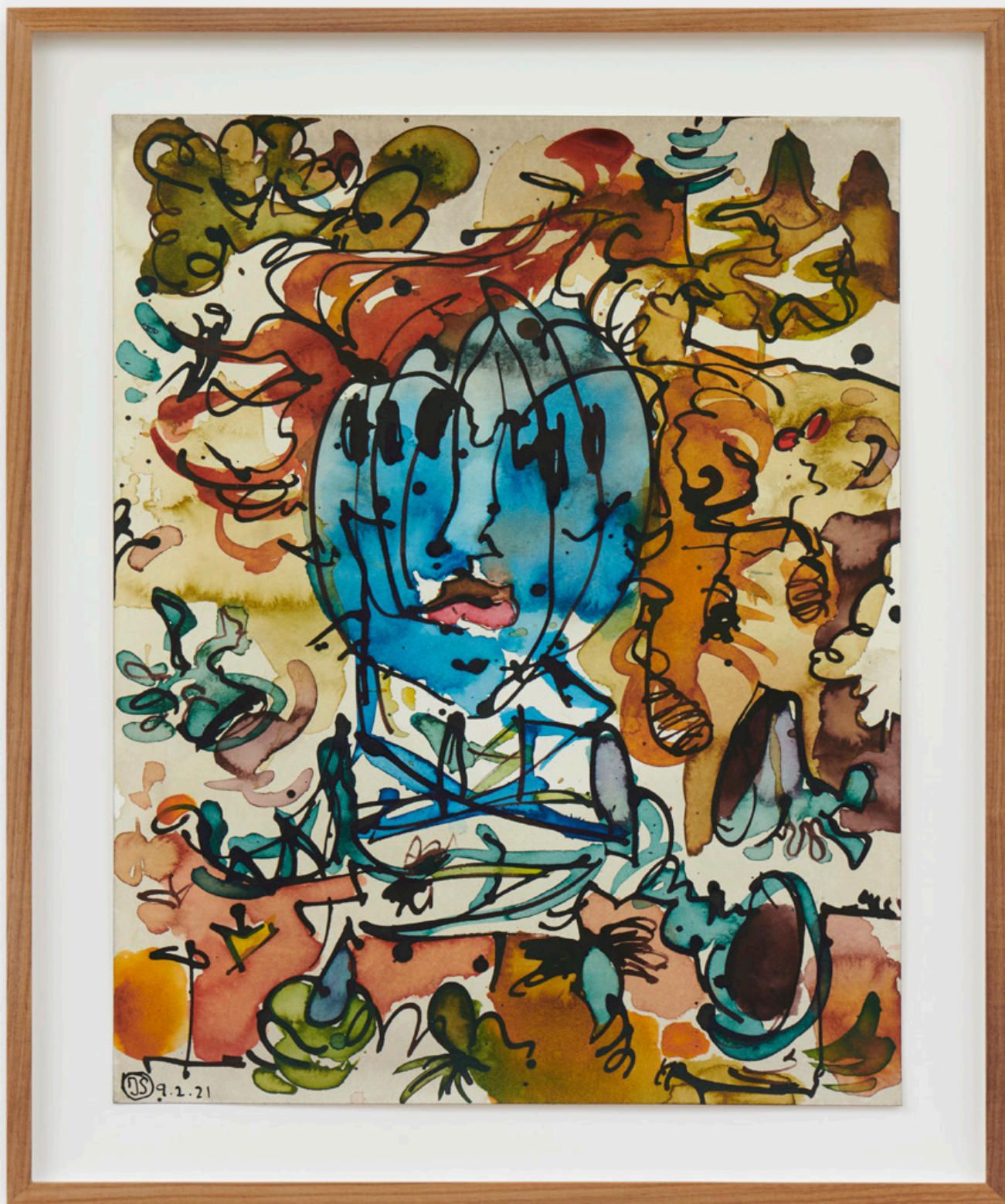
Untitled , 2021 Ink, watercolor on paper 12 1/4 x 9 1/8 in 31 x 23 cm (JS21.007)