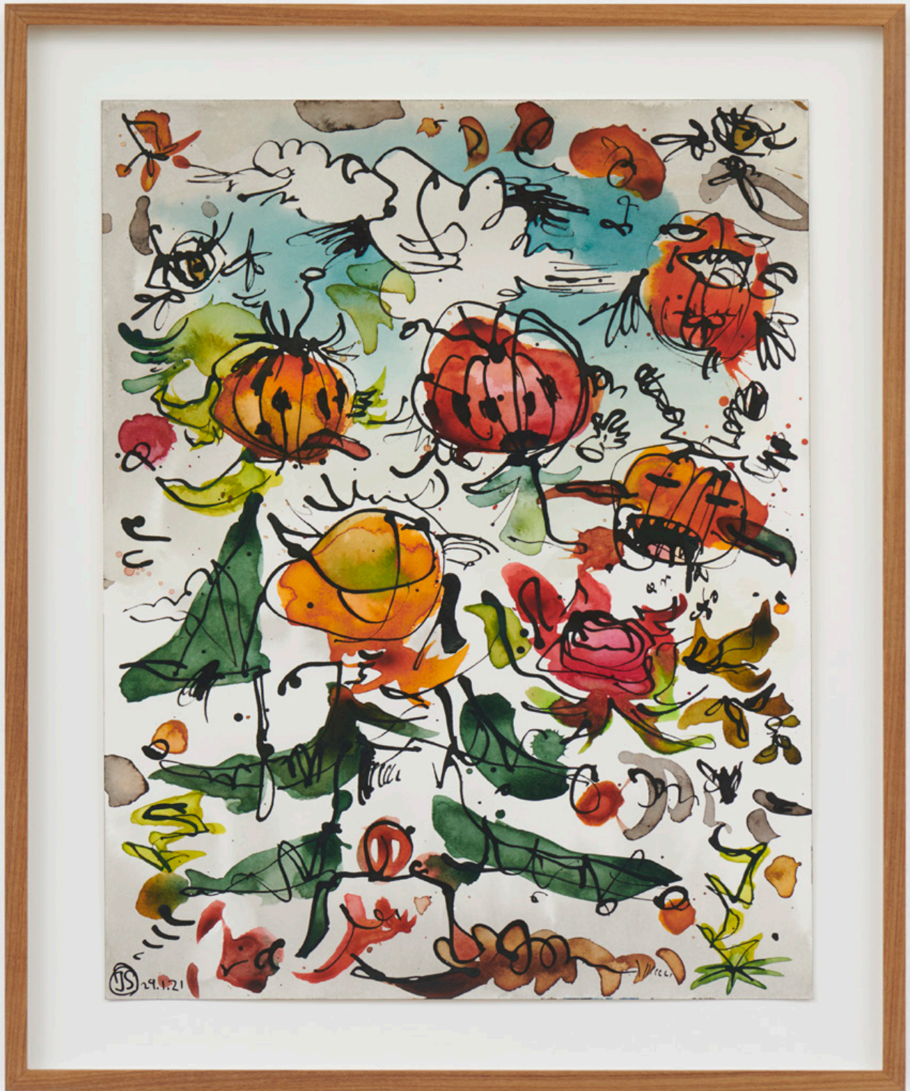
Untitled , 2021 Ink, watercolor on paper 12 1/4 x 9 1/8 in 31 x 23 cm (JS21.004)