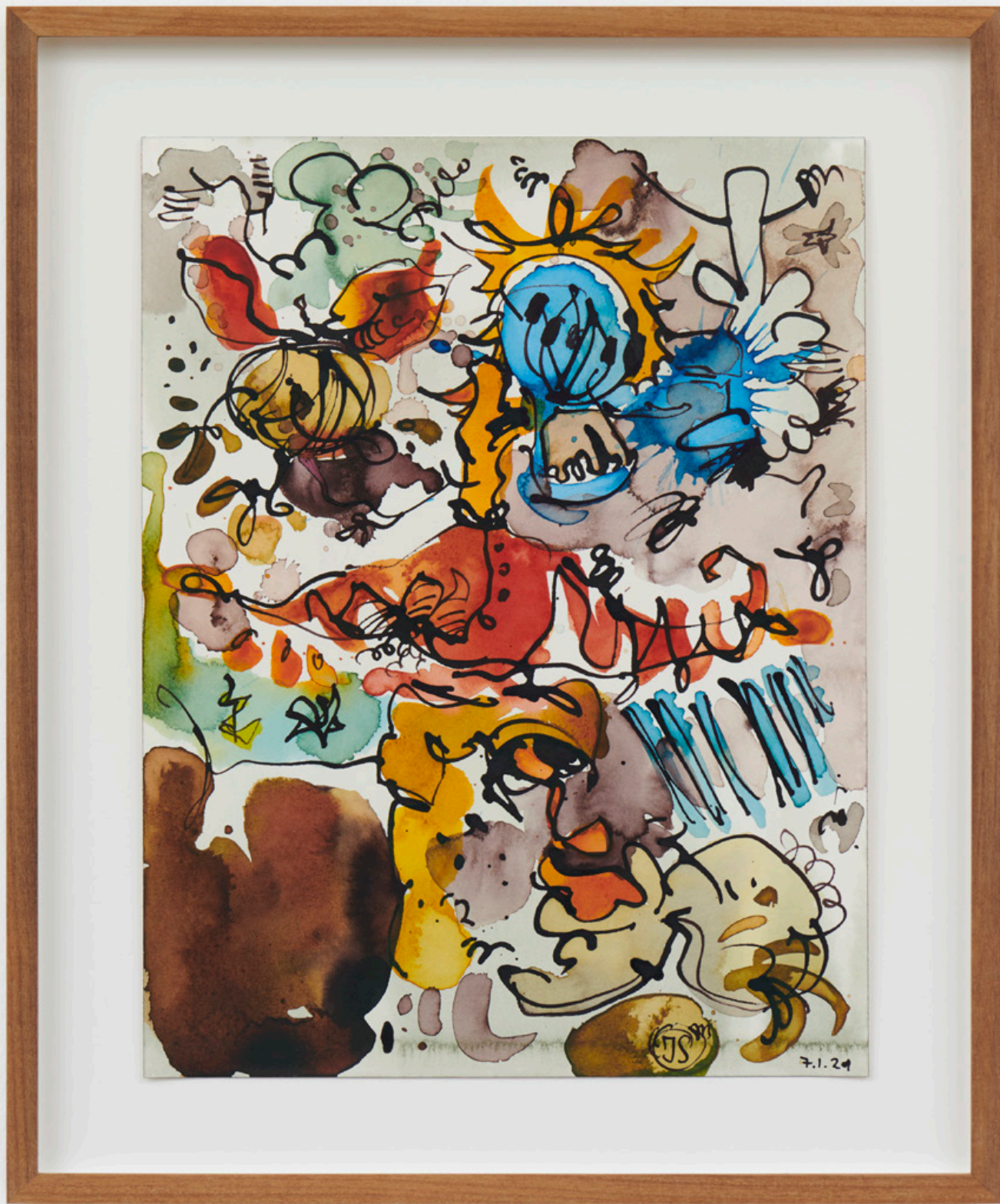
Untitled , 2021 Ink, watercolor on paper 12 1/4 x 9 1/8 in 31 x 23 cm (JS21.009)