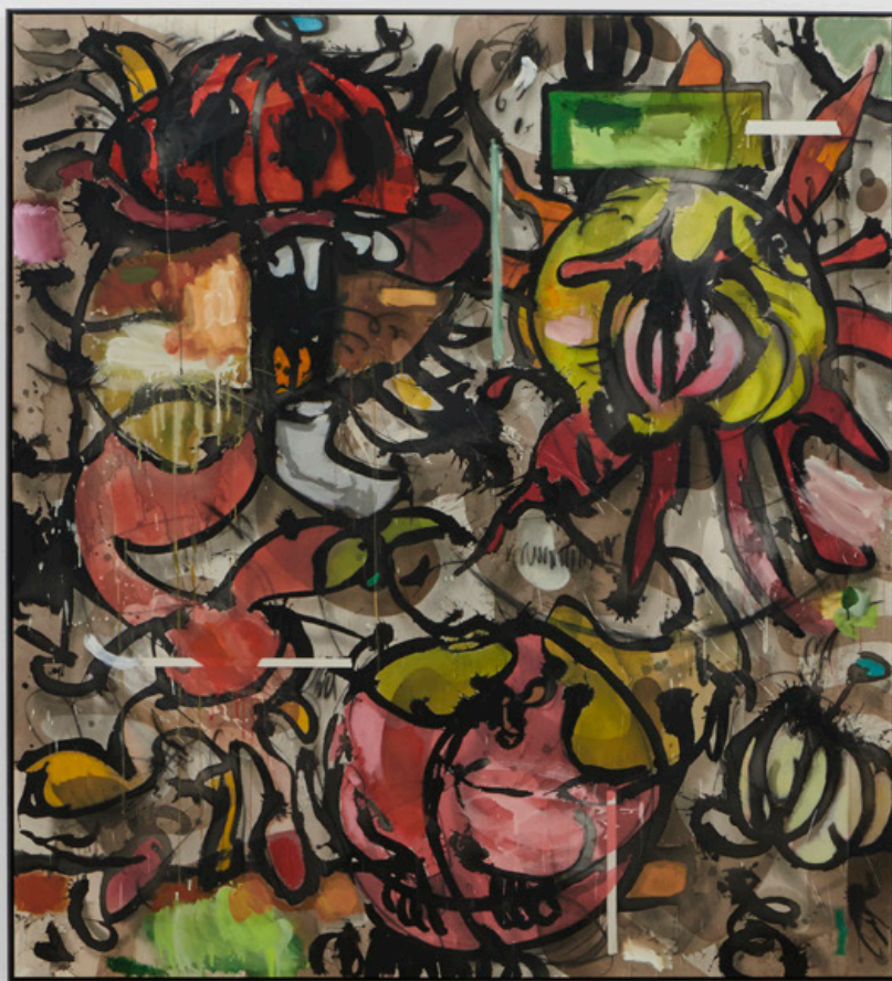
Allergie&Schoenheit (allergy&beauty) , 2021 Ink, acrylic, charcoal and oil pastel color on canvas 78 3/4 x 70 7/8 in 200 x 180 cm (JS21.013)