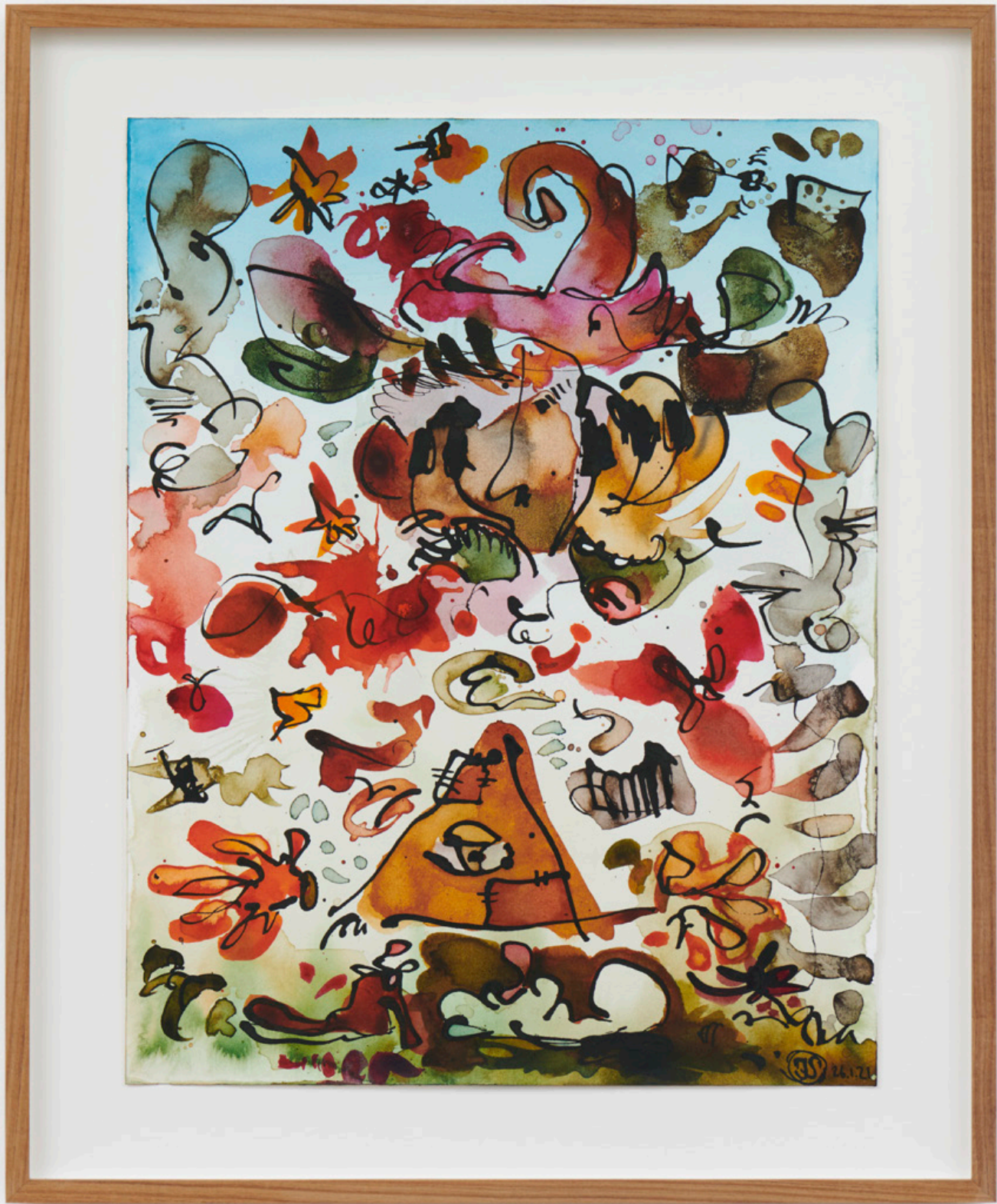
Untitled , 2021 Ink, watercolor on paper 12 1/4 x 9 1/8 in 31 x 23 cm (JS21.005)