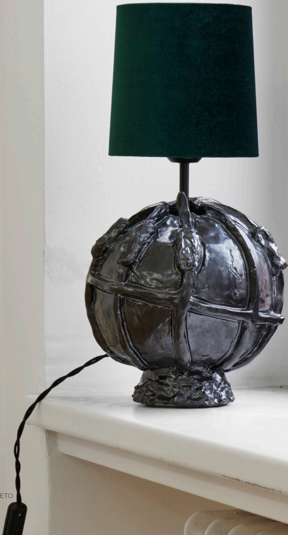
Jan-Ole Schiemann Untitled (globus), 2021 Jan-Ole Schiemann & LETO Ceramic 19 3/4 x 9 7/8 x 9 7/8 in 50 x 25 x 25 cm (JS21.014)