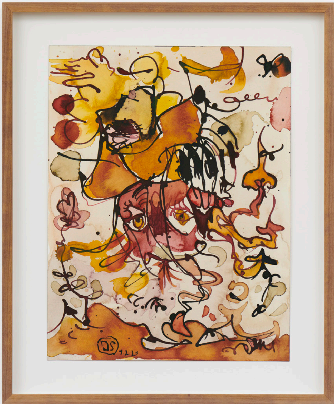
Untitled , 2021 Ink, watercolor on paper 12 1/4 x 9 1/8 in 31 x 23 cm (JS21.012)