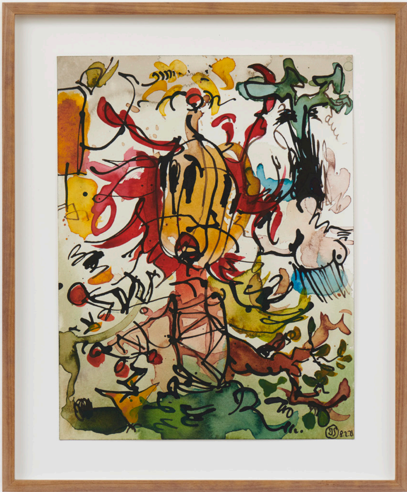
Untitled , 2021 Ink, watercolor on paper 31 x 23 cm 12 1/4 x 9 1/8 in (JS21.008)