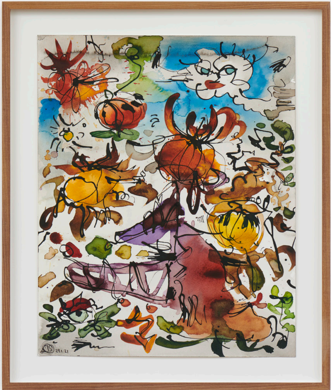
Untitled , 2021 Ink, watercolor on paper 12 1/4 x 9 1/8 in 31 x 23 cm (JS21.006)