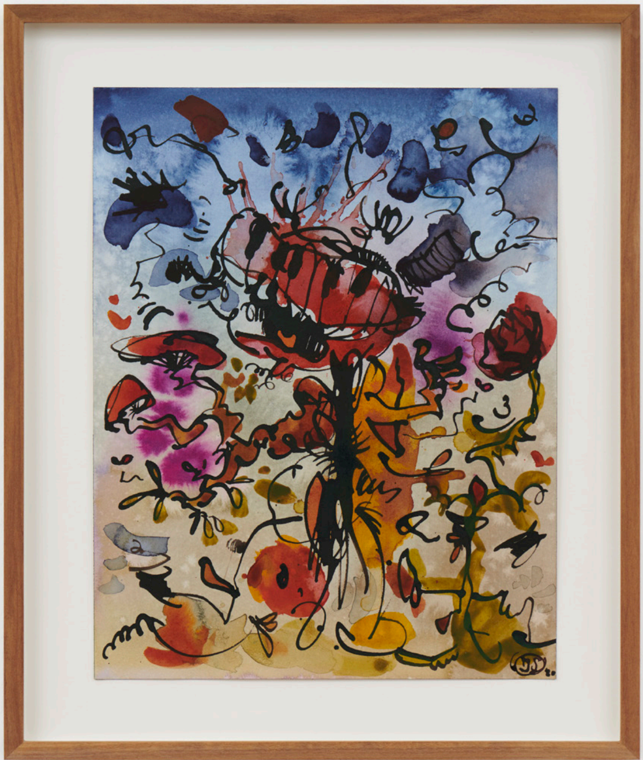
Untitled , 2021 Ink, watercolor on paper 12 1/4 x 9 1/8 in 31 x 23 cm (JS21.003)