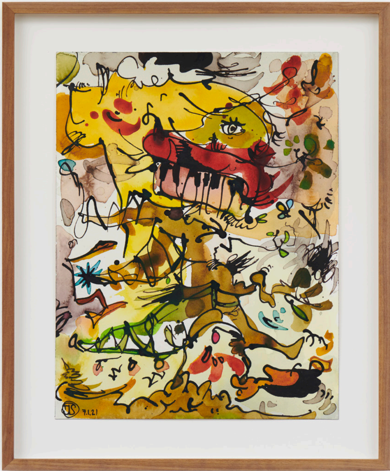
Untitled , 2021 Ink, watercolor on paper 12 1/4 x 9 1/8 in 31 x 23 cm (JS21.010)