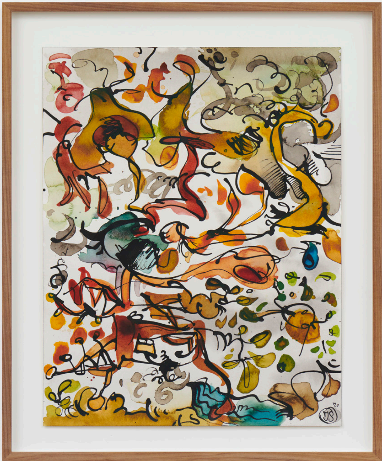
Untitled , 2021 Ink, watercolor on paper 12 1/4 x 9 1/8 in 31 x 23 cm (JS21.011)