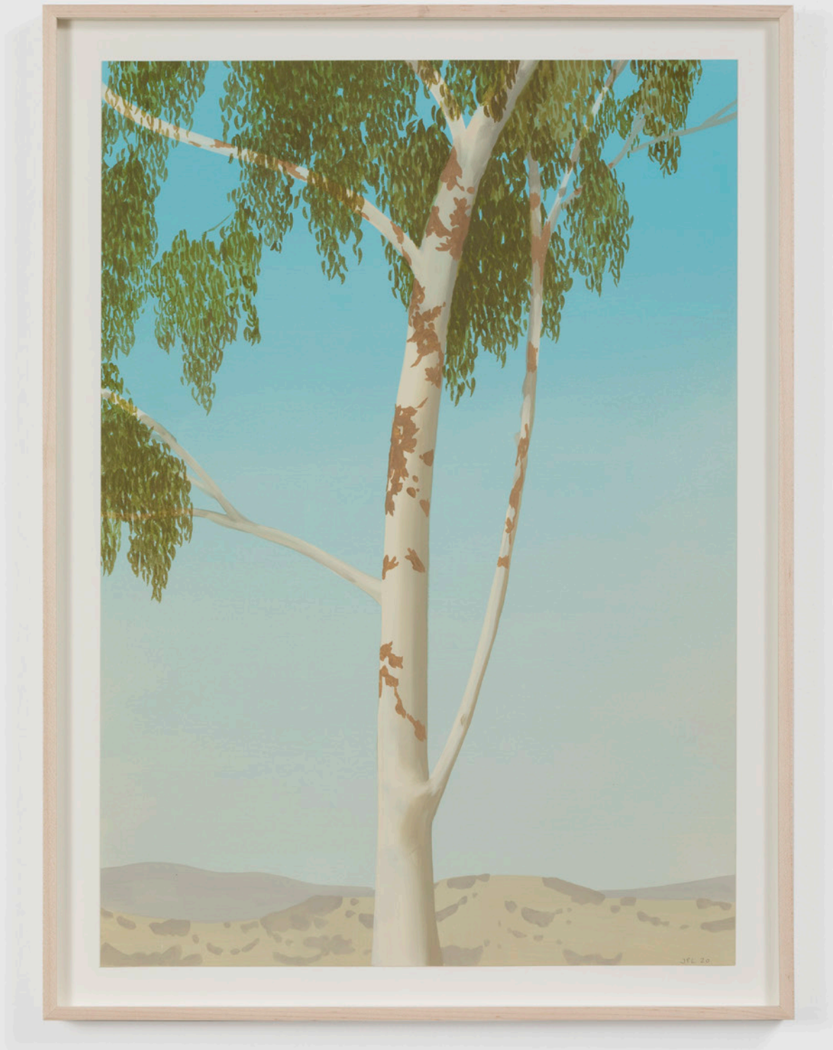
Sand Canyon 19 , 2021 oil on paper 21 x 14 in 53.3 x 35.6 cm (JLO20.078)