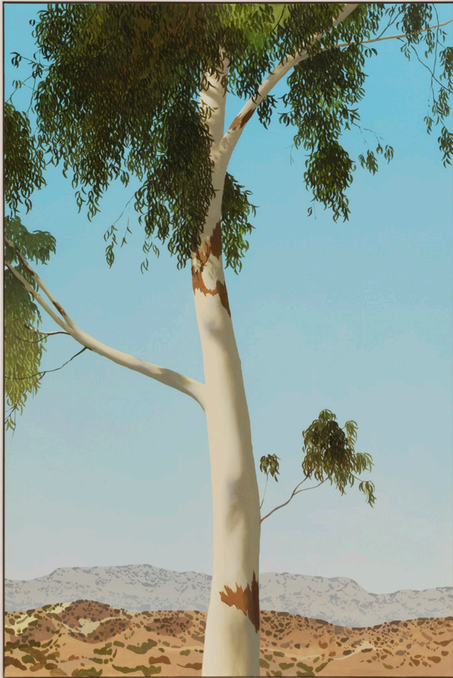
Sand Canyon (Eucalyptus 4) , 2021 oil on muslin 84 x 56 in 85 x 57 x 2.5 in, framed (JLO20.082)