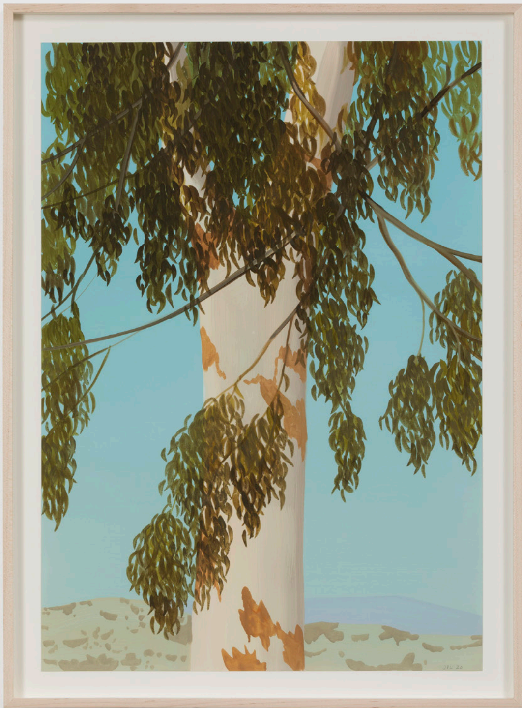
Sand Canyon 16, 2021 oil on paper 21 x 14 in 53.3 x 35.6 cm (JLO20.081) SOLD