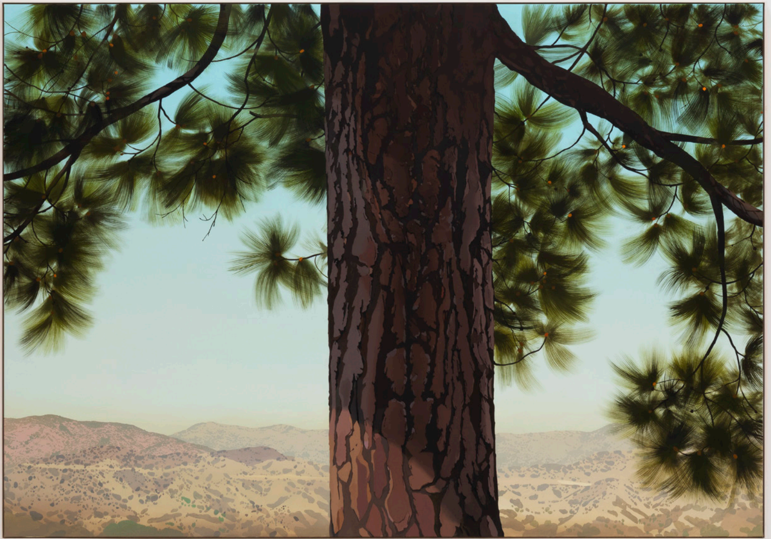
Sand Canyon (Pine 1) ...The one w thickest trunk, 2021 oil on muslin 84 x 120 in 85 x 121 x 2.5 in, framed (JLO20.060)