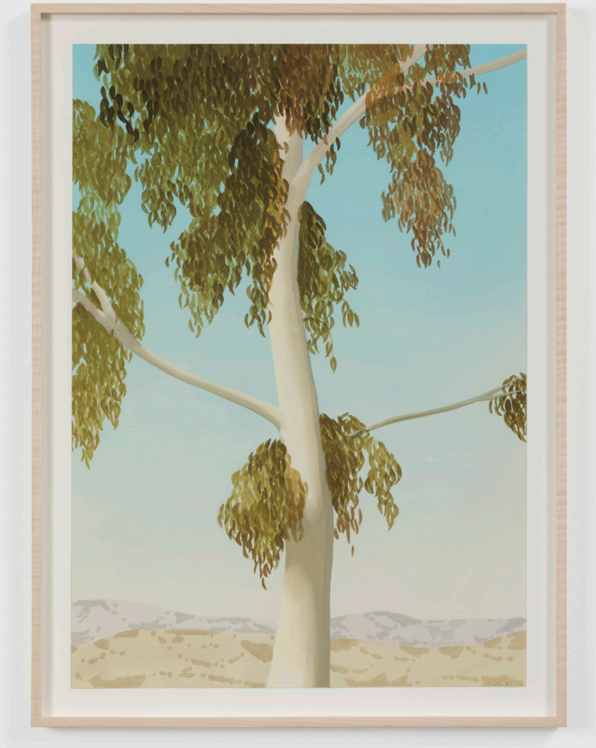
Sand Canyon 18 , 2021 oil on paper 21 x 14 in 53.3 x 35.6 cm (JLO20.079)