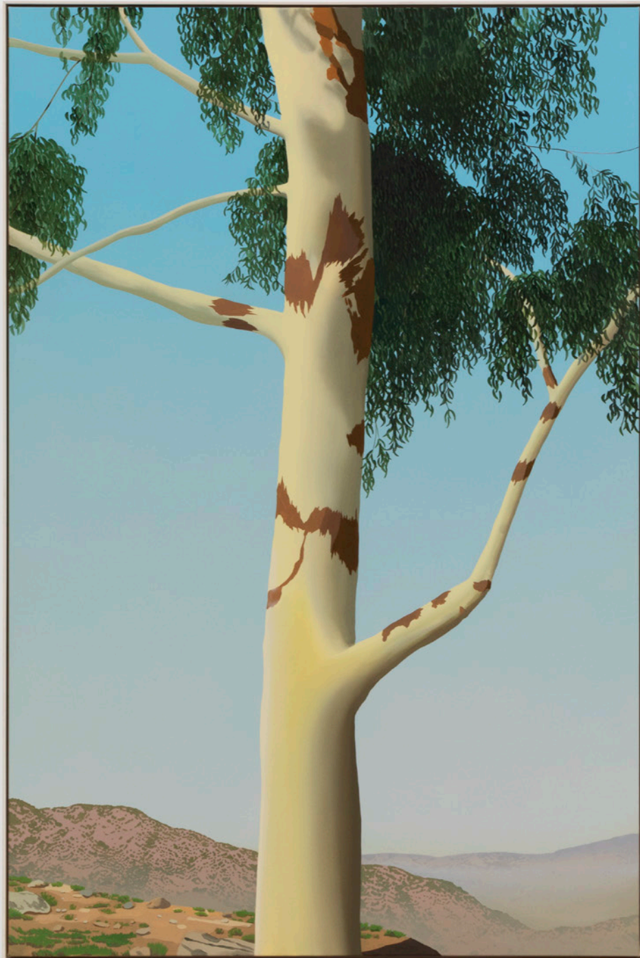
Sand Canyon (Eucalyptus 3) , 2021 oil on muslin 84 x 56 in 85 x 57 x 2.5 in, framed (JLO20.083)