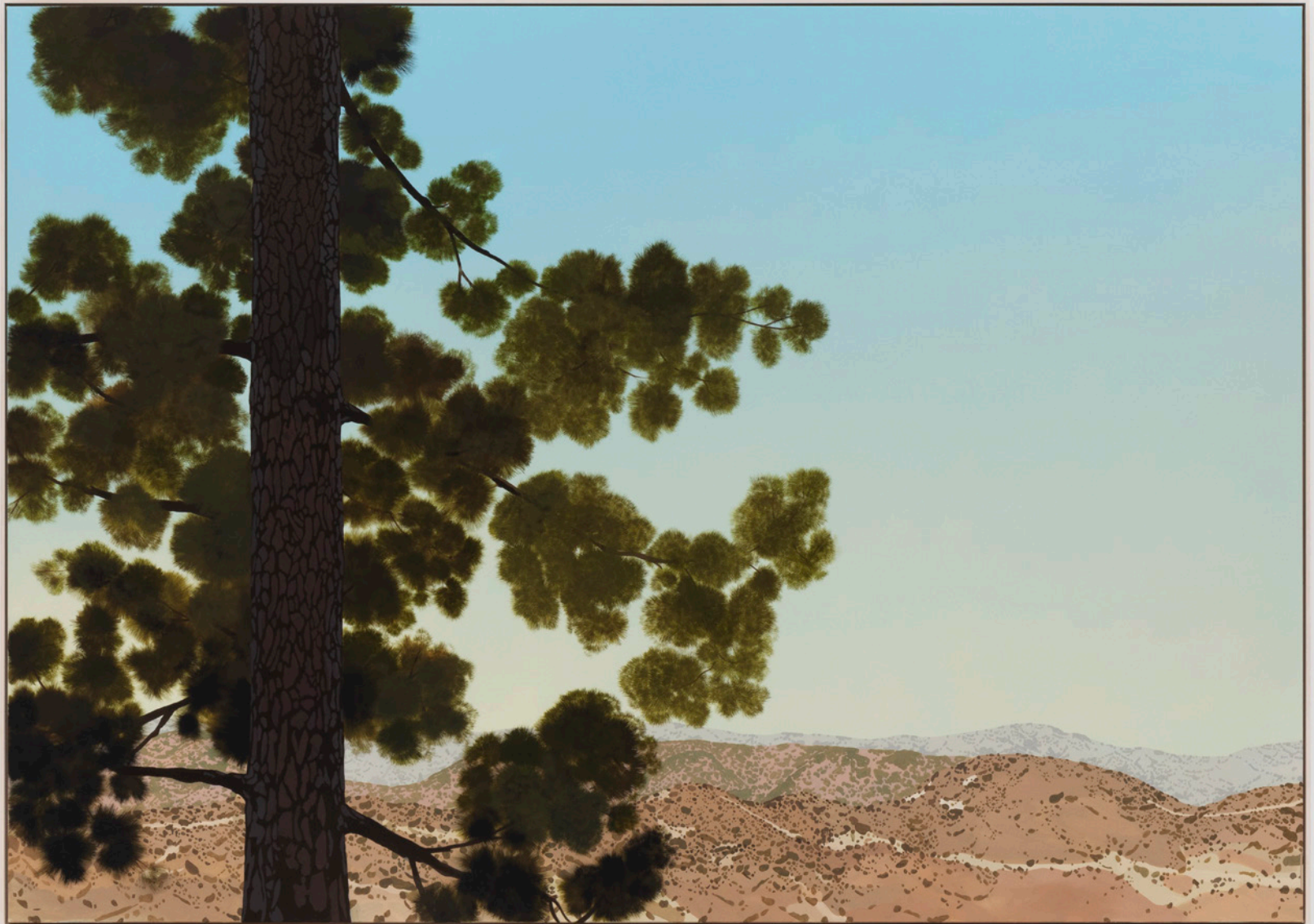
Sand Canyon (Pine 2) , 2021 oil on muslin 84 x 120 in 85 x 121 x 2.5 in, framed (JLO20.061)