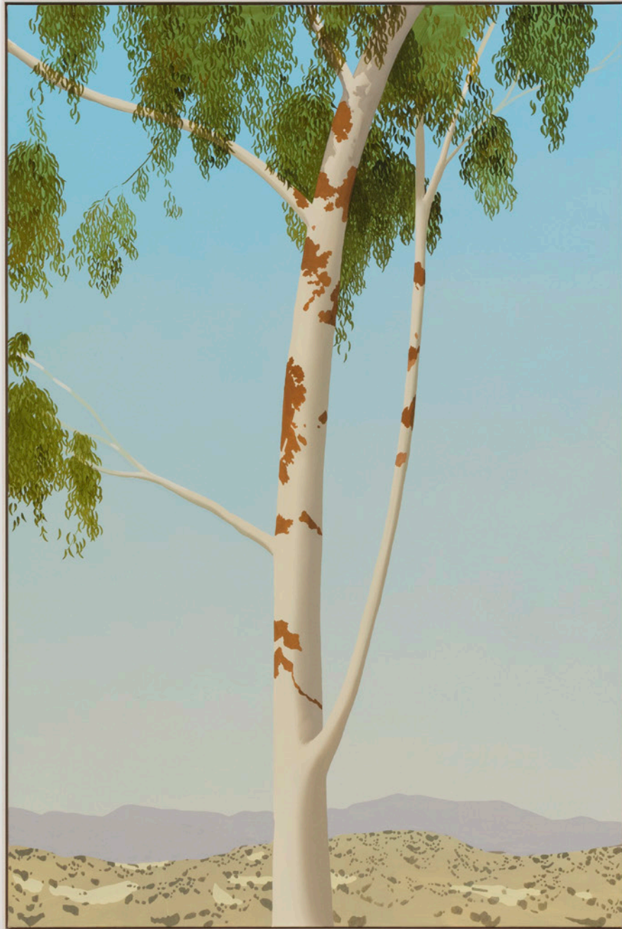
Sand Canyon (Eucalyptus 1) , 2021 oil on muslin 84 x 56 in 85 x 57 x 2.5 in, framed (JLO20.085)