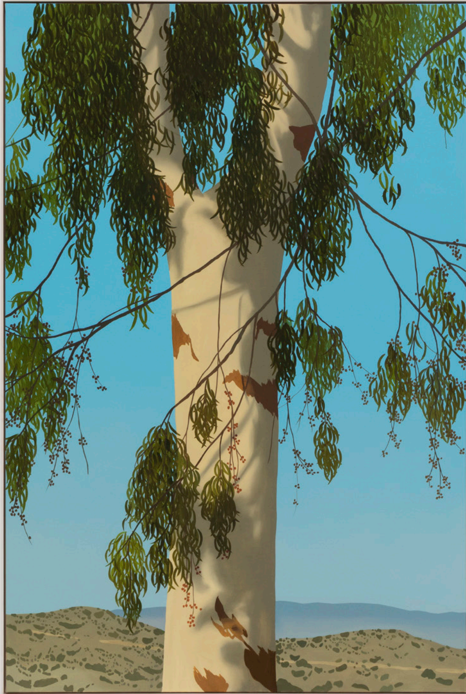
Sand Canyon (Eucalyptus 2) , 2021 Oil on muslin 84 x 56 in. 85 x 57 x 2.5 in, framed (JLO20.084)