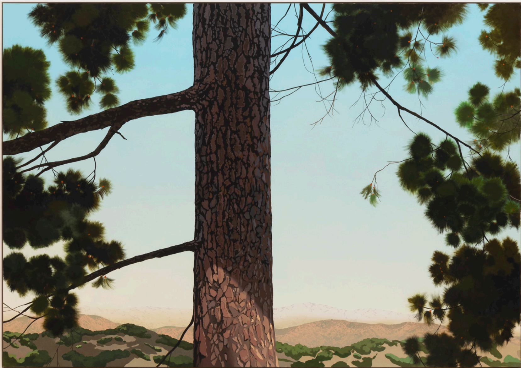
Sand Canyon (Pine 3) , 2021 oil on muslin 84 x 120 in 213.4 x 304.8 cm 85 x 121 x 2.5 in, framed 215.9 x 307.3 x 31.8 cm, framed (JLO20.062)