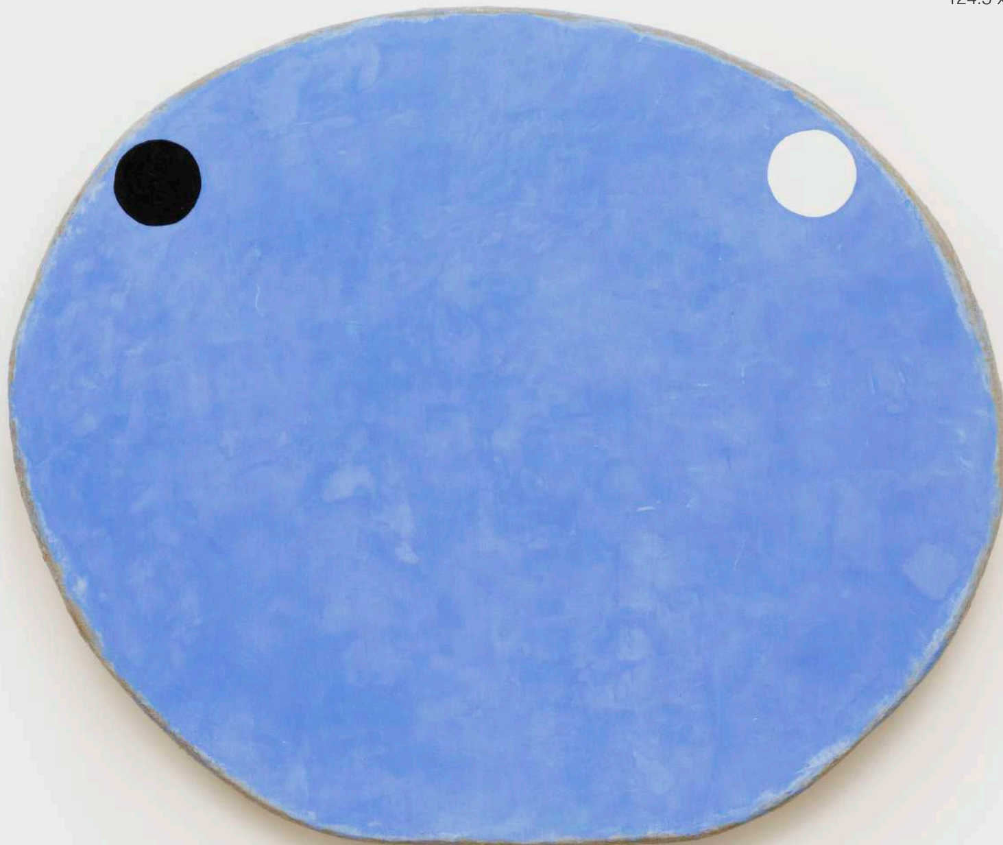
Large Blue with One White and One Black Circle, 2021 Acrylic on linen on wood 49 x 58 x 5 in 124.5 x 147.3 x 12.7 cm (OJO21.003)