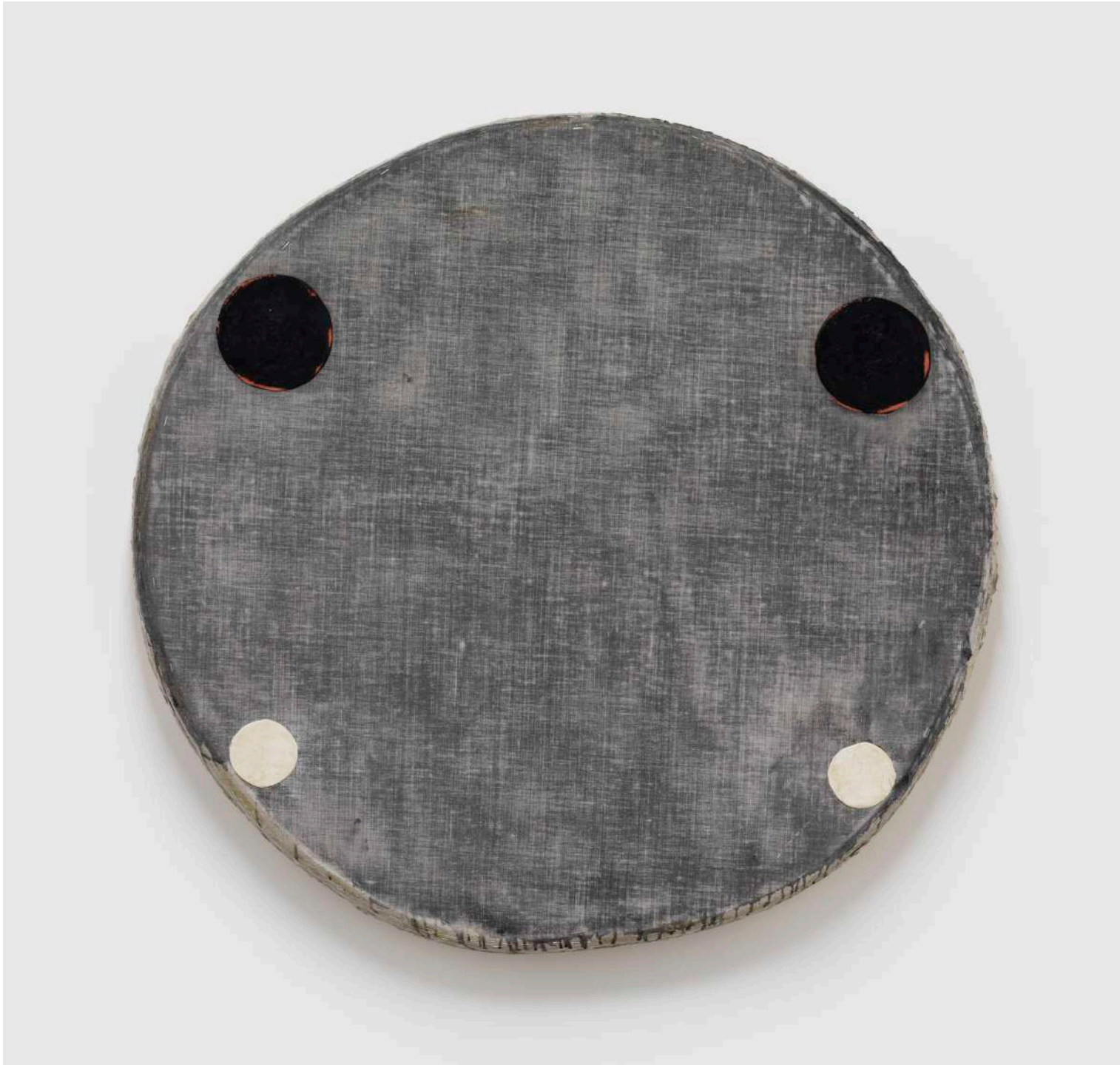
Four Circles, Two Black, Two Tan, 2020 Acrylic on linen 36 1/2 x 37 1/2 x 4 1/2 in 92.7 x 95.3 x 11.4 cm (OJO20.002)