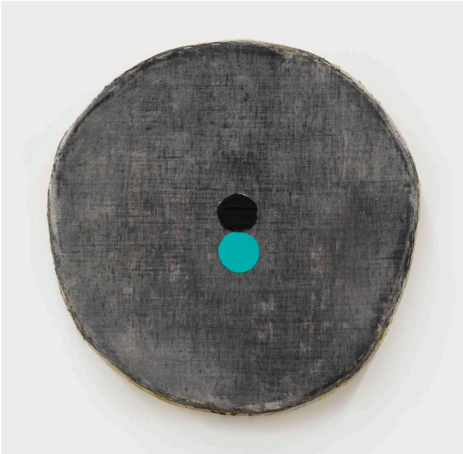
Black Circle, Aqua Circle, 2021 Acrylic on linen on wood 19 3/4 x 20 x 3 in 50.2 x 50.8 x 7.6 cm (OJO21.010)