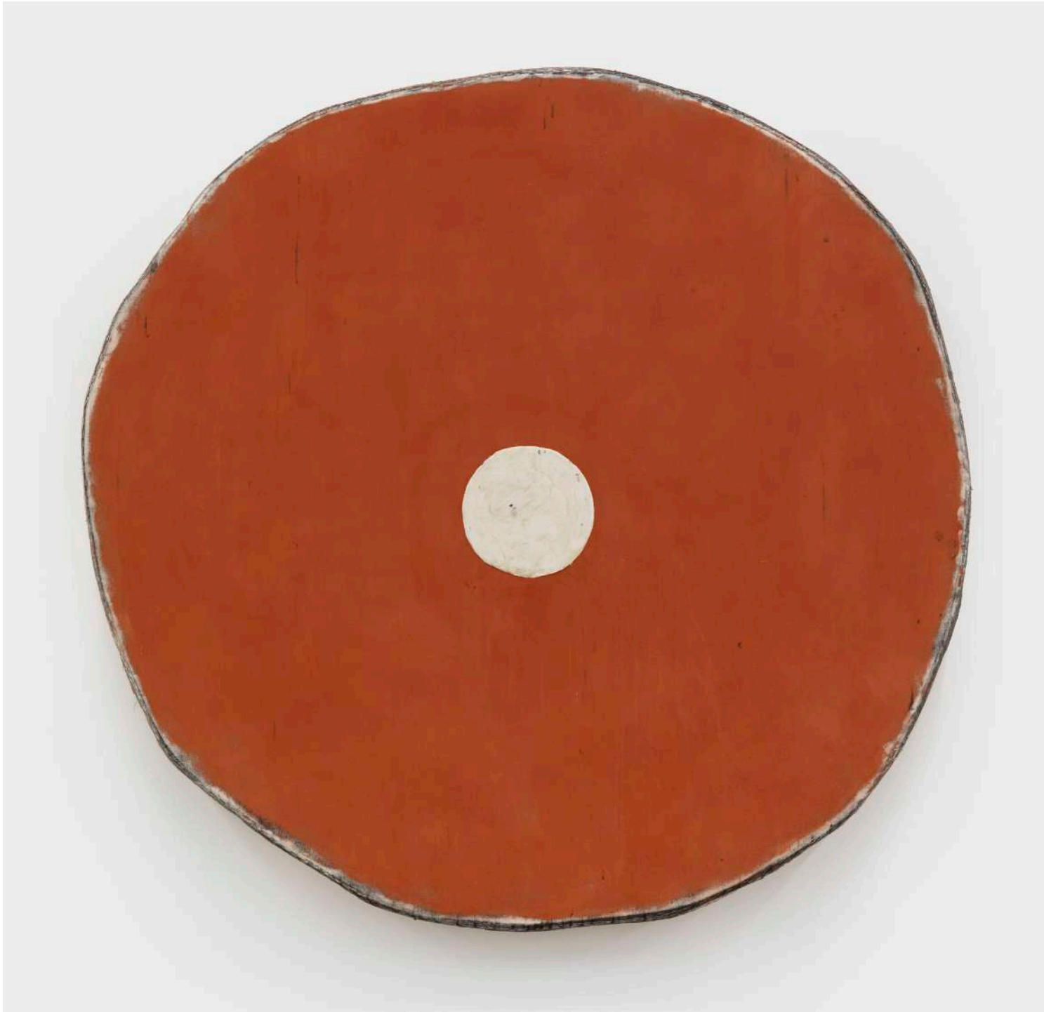
Red Oxide with Dirty White Circle, 2021 Acrylic on linen on wood 55 1/2 x 57 3/4 x 5 in 141 x 146.7 x 12.7 cm (OJO21.011)