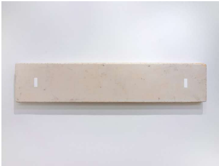
Otis Jones, "Natural with Two White Rectangles Far Apart" (2018), acrylic on canvas on wood, 17.5 x 85.5 x 4 inches

Jones's paintings do not recall anything from our experience. They exist on what Frecon would consider the high plane of abstraction, which is something unto itself. This is the power, surprise, and revelation of the exhibition. Jones has taken an abstract, reductive possibility and made something fresh and austere (or is it sensually austere) out of it. Rather than commenting on history, he is moving its possibilities down the road a bit. In the age of nothing new under the sun, that's more than an accomplishment. It's practically a miracle.