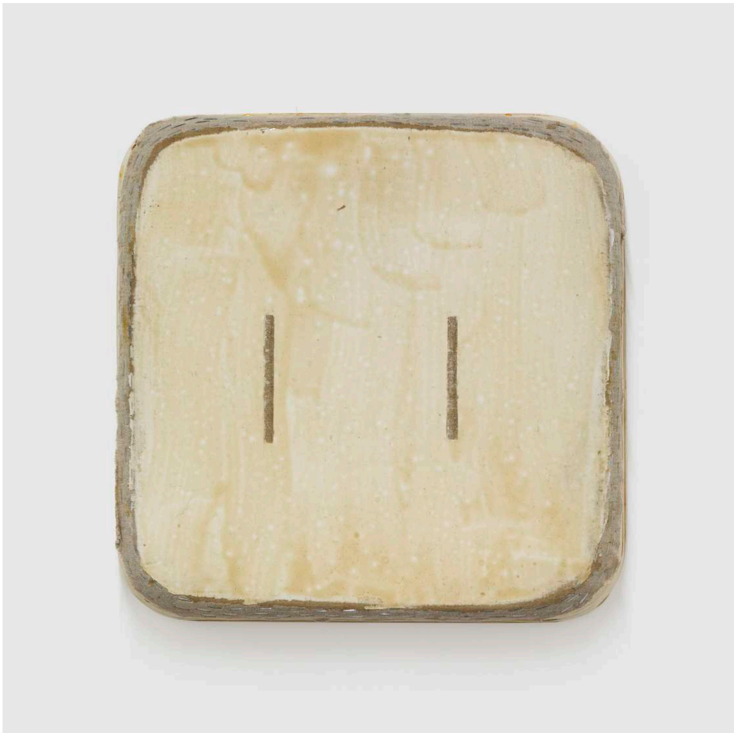
Tan With Two Lines , 2020 Acrylic on linen 16 1/2 x 16 1/2 x 3 1/4 in 41.9 x 41.9 x 8.3 cm (OJO20.001)