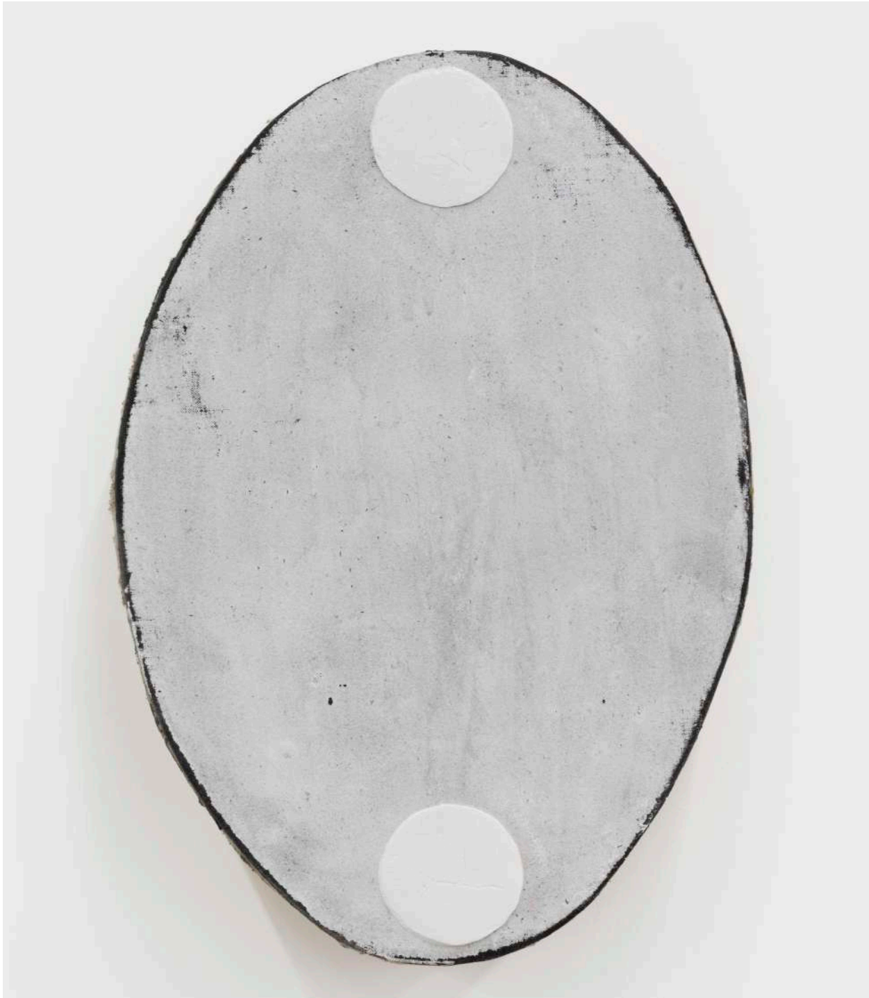
Oval with Two White Circles, 2021 Acrylic on linen on wood 20 1/2 x 14 1/2 x 3 in 52.1 x 36.8 x 7.6 cm (OJO21.008)