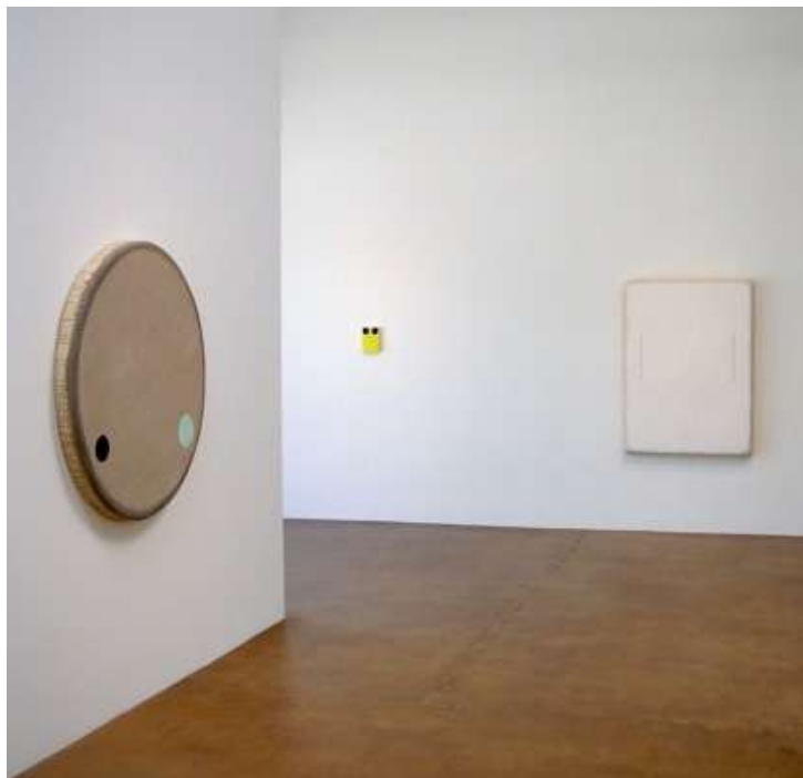
View of "Otis Jones and Bret Slater," 2014.

Otis Jones and Bret Slater each make spare, nearly monochromatic paintings that are injected with basic shapes of opposing colors. Both artists toy with oddly shaped canvases and an elementary language of marks and forms. Nominally, their work seems primed to elicit a correspondence, which is the occasion for their latest exhibition together, but upon closer inspection Jones and Slater are making very different paintings.