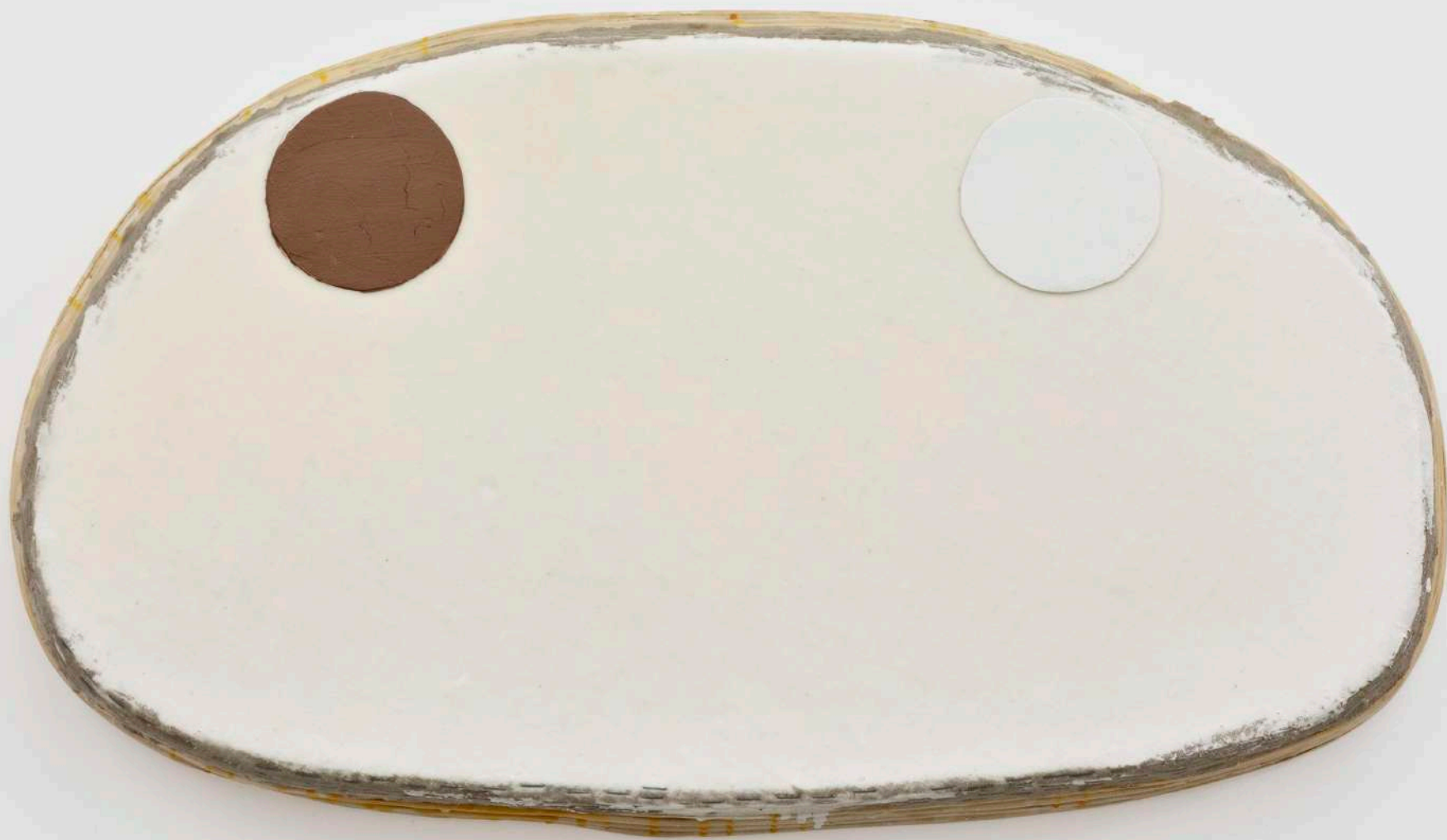
Ivory with Brown and White Circles, 2019 Acrylic on linen on wood 17 1/2 x 27 1/2 x 3 3/4 in 44.5 x 69.8 x 9.5 cm (OJO19.002)