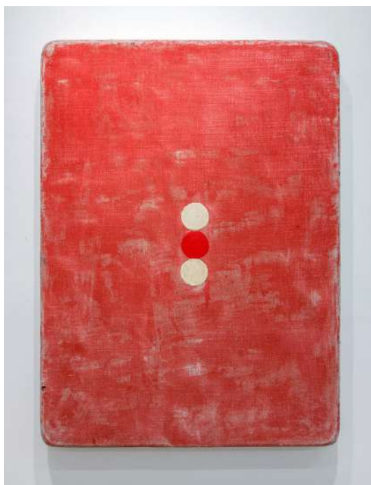
Otis Jones, “Red with One Red and Two White Circles” (2018), acrylic on canvas on wood, 47.5 x 36 x 4 inches

Jones has developed an inventive approach to being true to materials and process. From the making of the shaped, homemade support, to his expressive use of staples to attach the canvas, to the application and removal of paint, everything he does underscores the material identity of the thing itself. Essentially, Jones has taken Frank Stella’s clarion call for opticality, as encoded in his dictum “What you see is what you see,” and stood it on its head. By eschewing the optical in favor of the visceral, as well as rejecting the mechanical for the handmade (while downplaying gesture and overt mark-making), Jones proves that painting’s parameters continue to be commodious. Even reductive painting has not been used up.