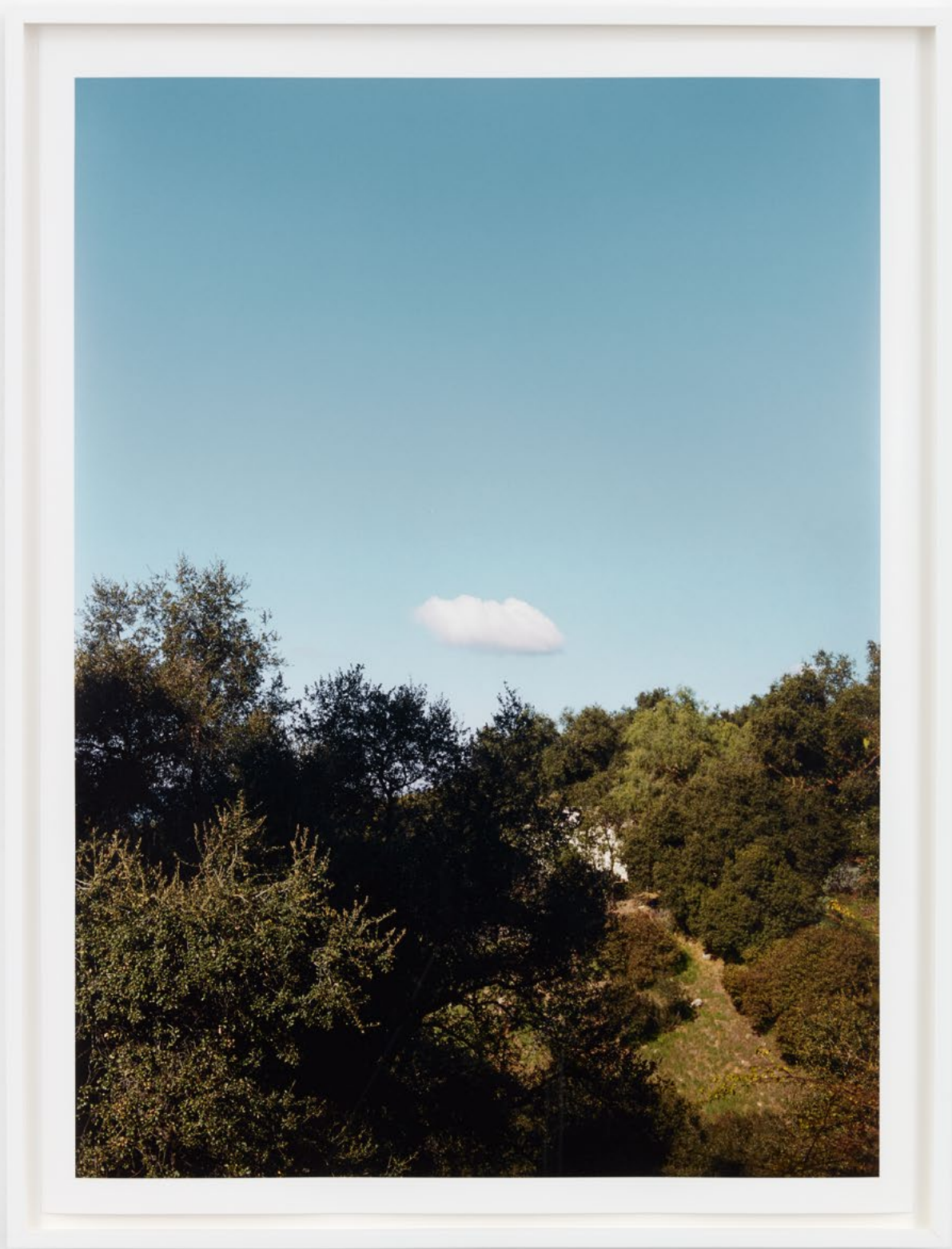
Please don't leave , 2021 Archival pigment print 32 x 24 inches (unframed) 81.3 x 61 cms (unframed) 33 3/4 x 25 3/4 inches (framed) 85.7 x 65.4 cms (framed) Ed. 1 of 3 + 2 AP (MJA21.001)