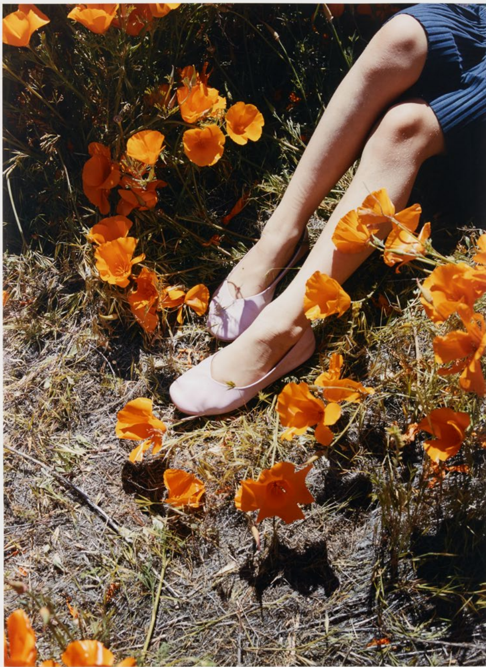
Yours , 2021 Archival pigment print 32 x 24 inches (unframed) 81.3 x 61 cms (unframed) 33 3/4 x 25 3/4 inches (framed) 85.7 x 65.4 cms (framed) Ed. 1 of 3 + 2 AP (MJA21.004)