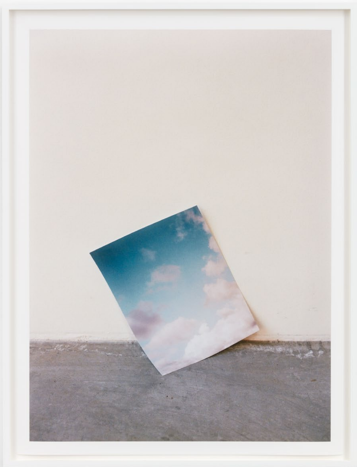
Let forever be delayed , 2021 Archival pigment print 32 x 24 inches (unframed) 81.3 x 61 cms (unframed) 33 3/4 x 25 3/4 inches (framed) 85.7 x 65.4 cms (framed) Ed. 1 of 3 + 2 AP (MJA21.004)