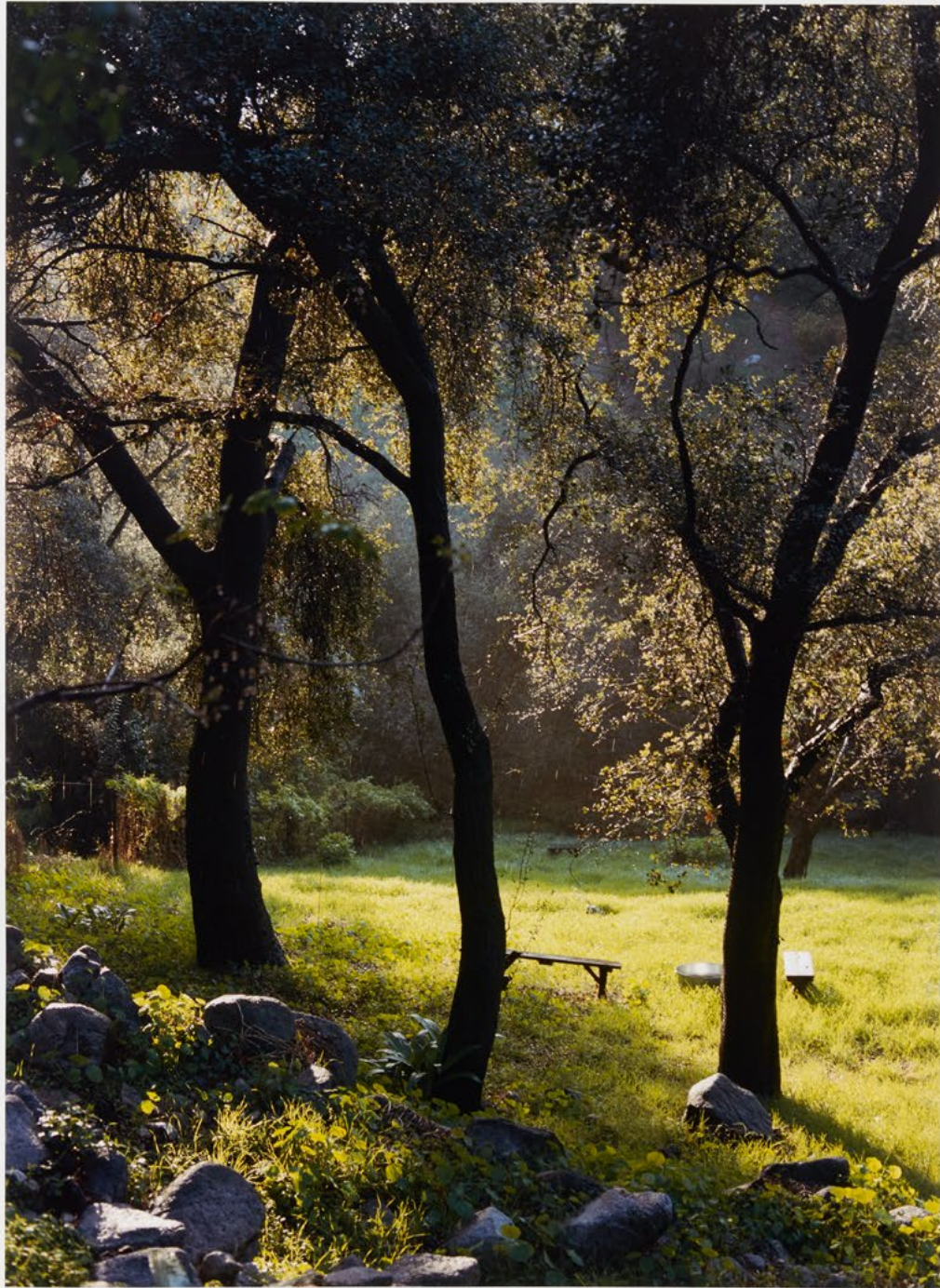
Where you'll find me , 2021 Archival pigment print 32 x 24 inches (unframed) 81.3 x 61 cms (unframed) 33 3/4 x 25 3/4 inches (framed) 85.7 x 65.4 cms (framed) Ed. 1 of 3 + 2 AP (MJA21.005)