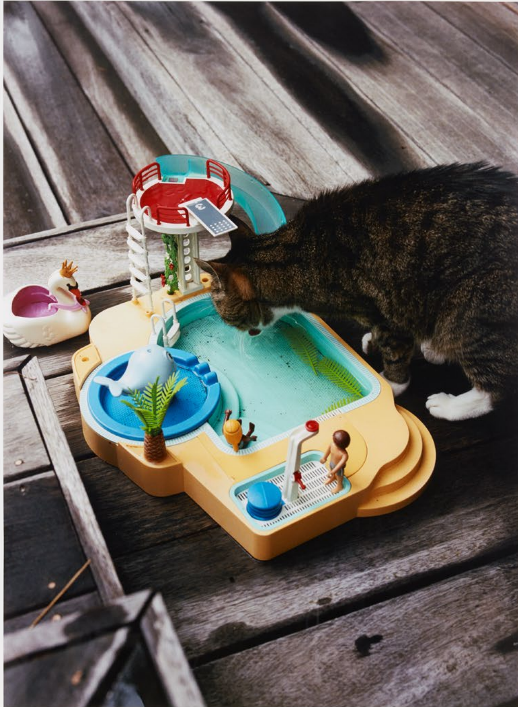
Summers End , 2021 Archival pigment print 32 x 24 inches (unframed) 81.3 x 61 cms (unframed) 33 3/4 x 25 3/4 inches (framed) 85.7 x 65.4 cms (framed) Ed. 1 of 3 + 2 AP (MJA21.004)