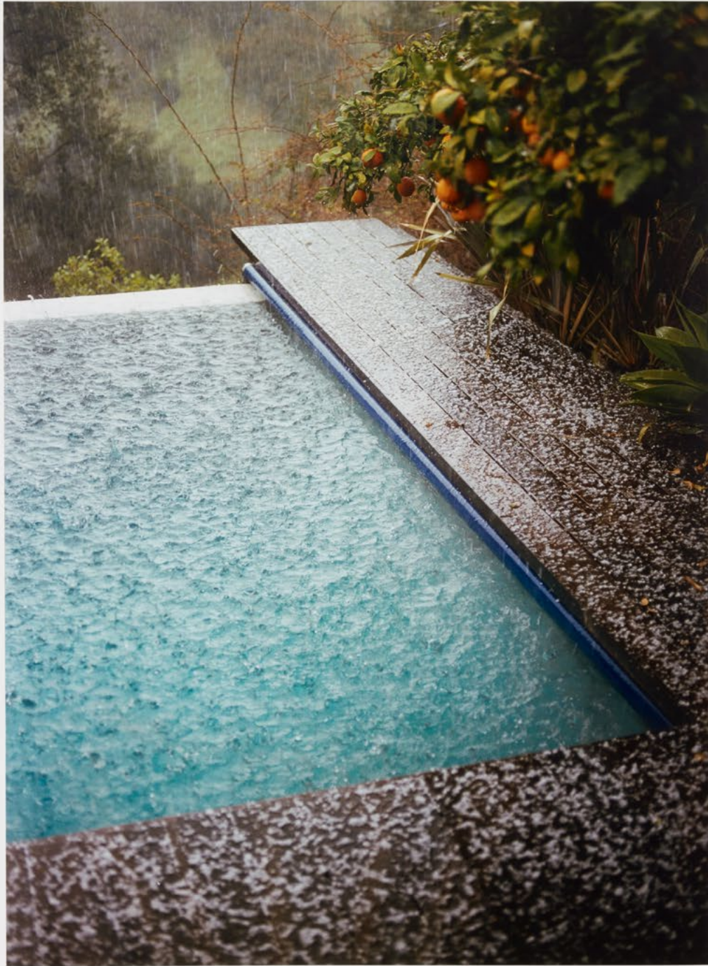
Dear Uncertainty,, 2021 Archival pigment print 32 x 24 inches (unframed) 81.3 x 61 cms (unframed) 33 3/4 x 25 3/4 inches (framed) 85.7 x 65.4 cms (framed) Ed. 1 of 3 + 2 AP (MJA21.004)