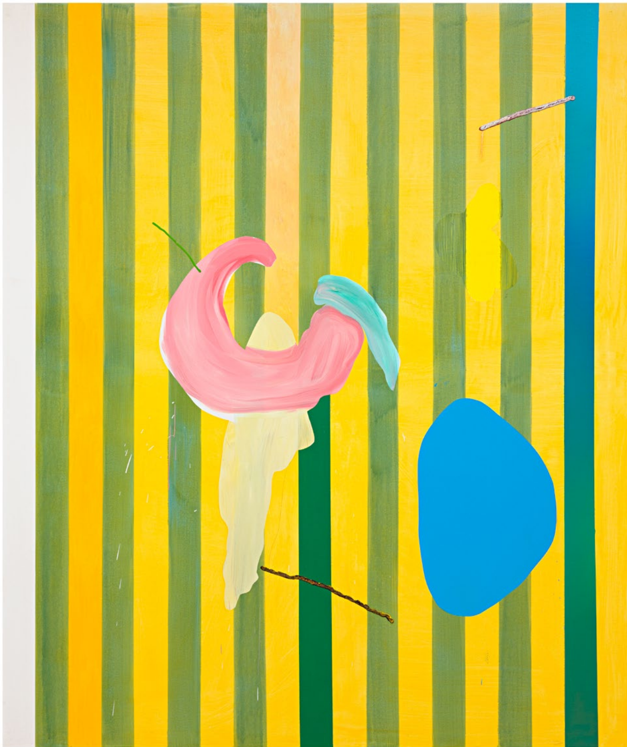
Andreas Breunig E_C_P_No06 , 2021 Acrylic, oil, graphite and charcoal on canvas 90 1/2 x 74 3/4 in 230 x 190 cm (ABR21.017)