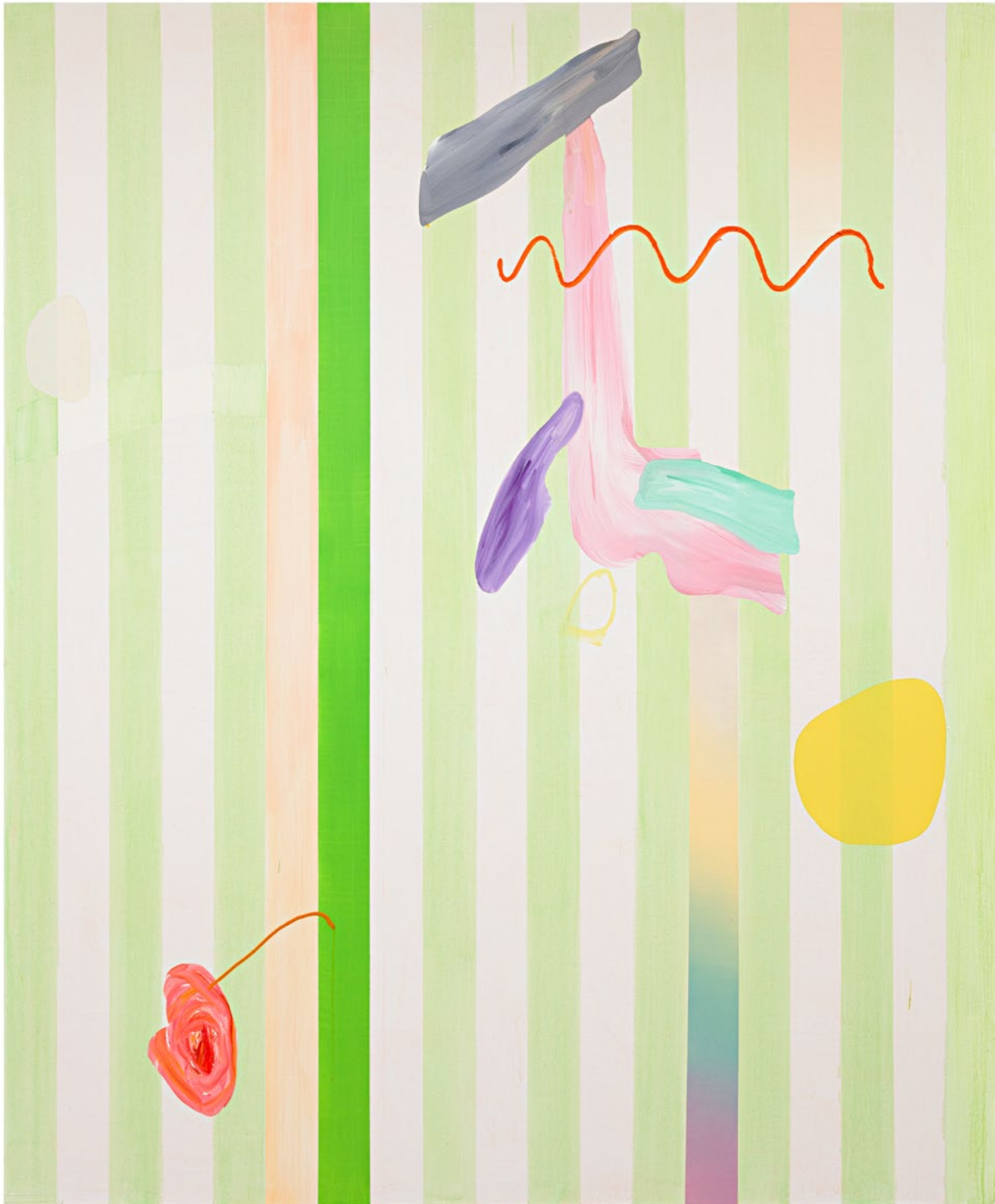
Andreas Breunig E_C_P_No05 , 2021 Acrylic, oil, graphite and charcoal on canvas 90 1/2 x 74 3/4 in 230 x 190 cm (ABR21.015)