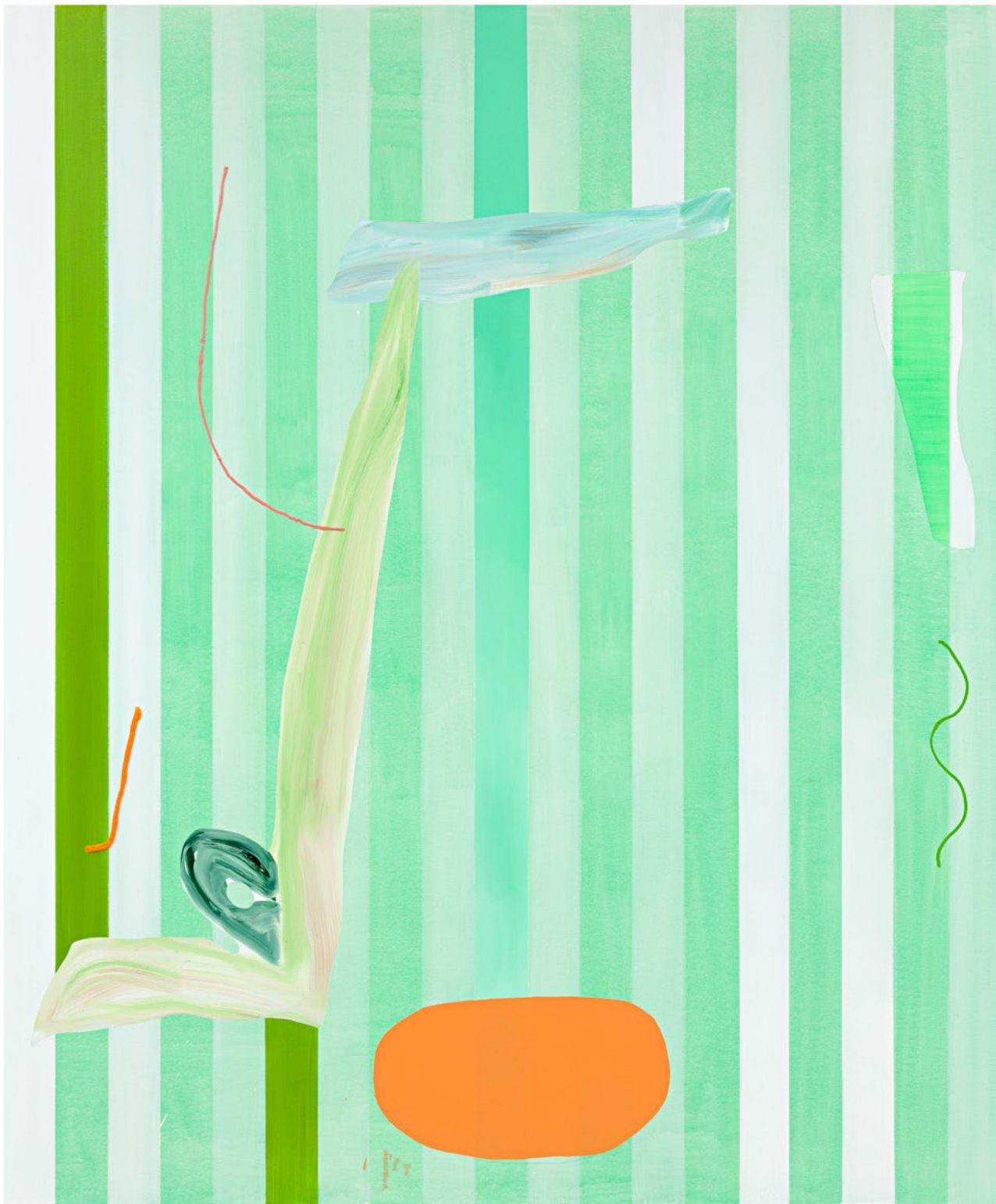
Andreas Breunig E_C_P_No16 , 2021 Acrylic, oil, graphite and charcoal on canvas 90 1/2 x 74 3/4 in 230 x 190 cm (ABR21.022)