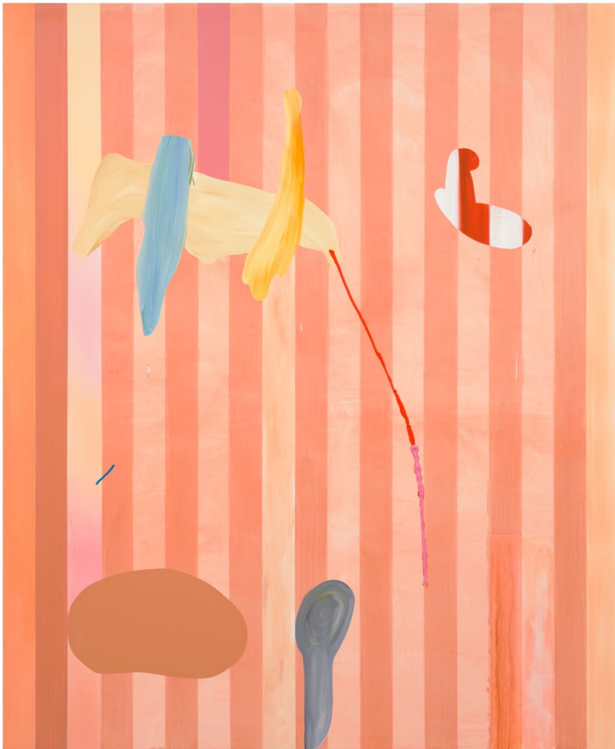
Andreas Breunig E_C_P_No04 , 2021 Acrylic, oil, graphite and charcoal on canvas 90 1/2 x 74 3/4 in 230 x 190 cm (ABR21.018)