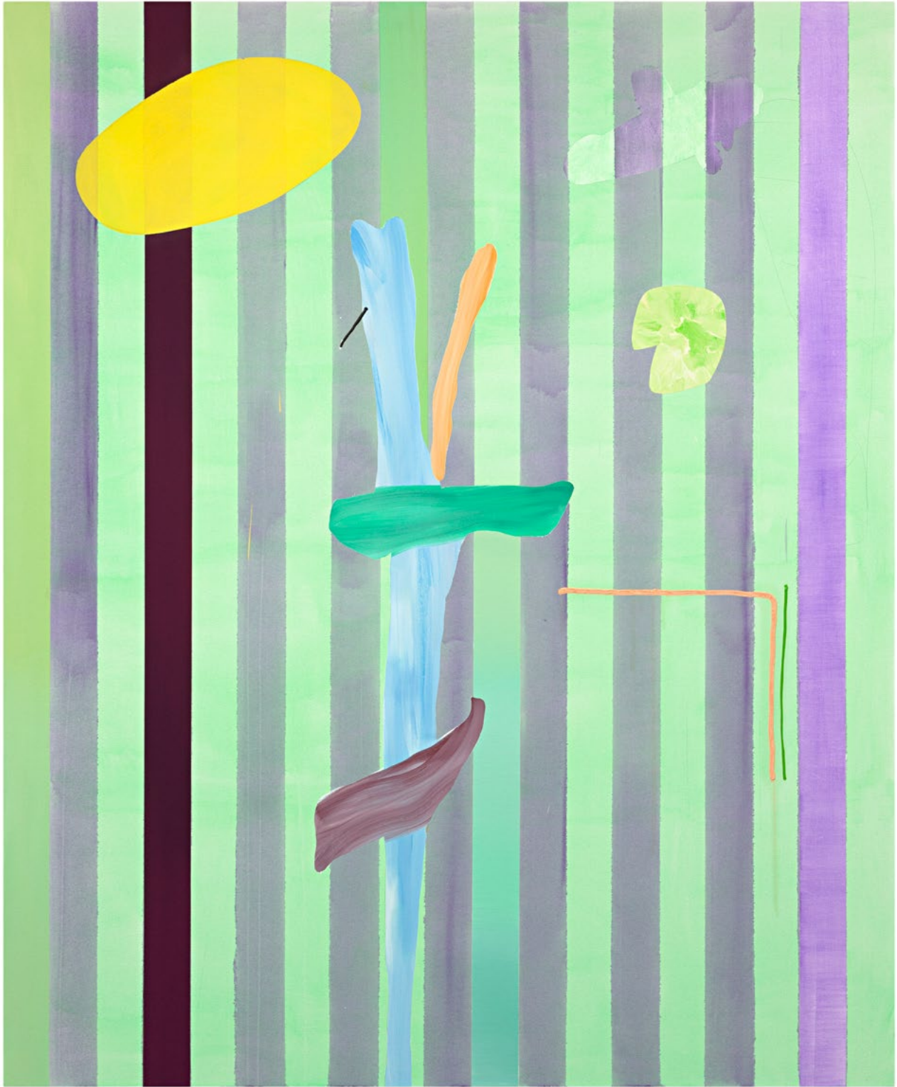
Andreas Breunig E_C_P_No02 , 2021 Acrylic, oil, graphite and charcoal on canvas 90 1/2 x 74 3/4 in 230 x 190 cm (ABR21.014)