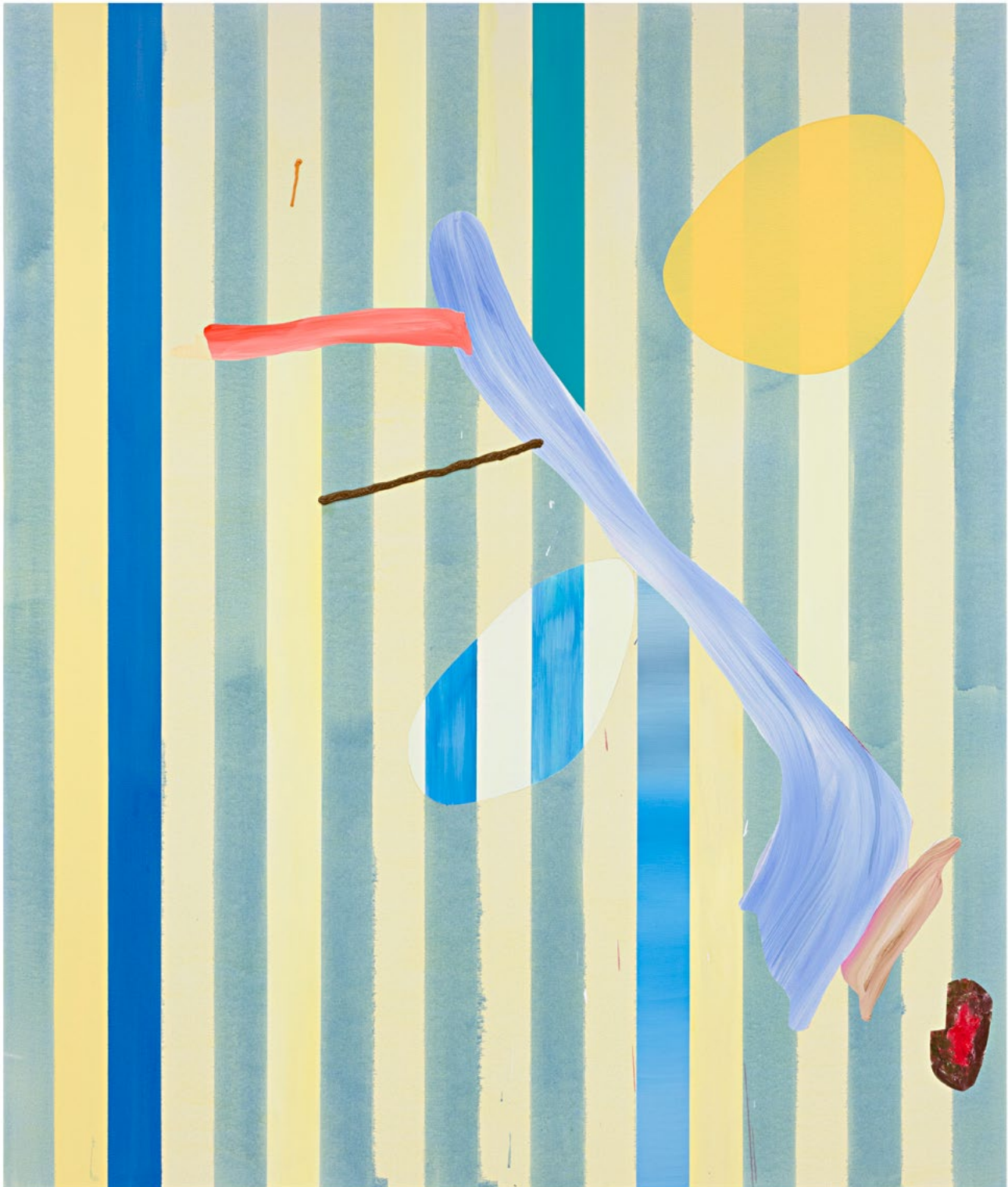
Andreas Breunig E_C_P_No14 , 2021 Acrylic, oil, graphite and charcoal on canvas 90 1/2 x 74 3/4 in 230 x 190 cm (ABR21.019)