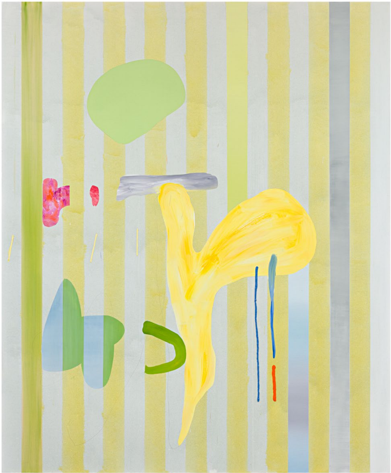
Andreas Breunig E_C_P_No13 , 2021 Acrylic, oil, graphite and charcoal on canvas 90 1/2 x 74 3/4 in 230 x 190 cm (ABR21.021)