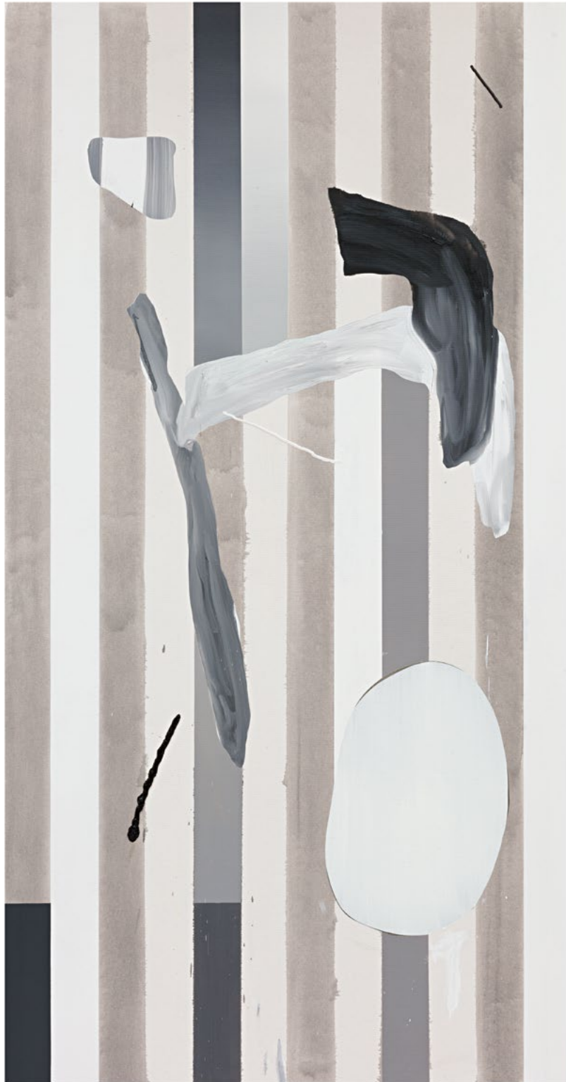
Andreas Breunig E_C_P_No10 , 2021 Acrylic, oil, graphite and charcoal on canvas 90 1/2 x 47 1/4 in 230 x 120 cm (ABR21.024)