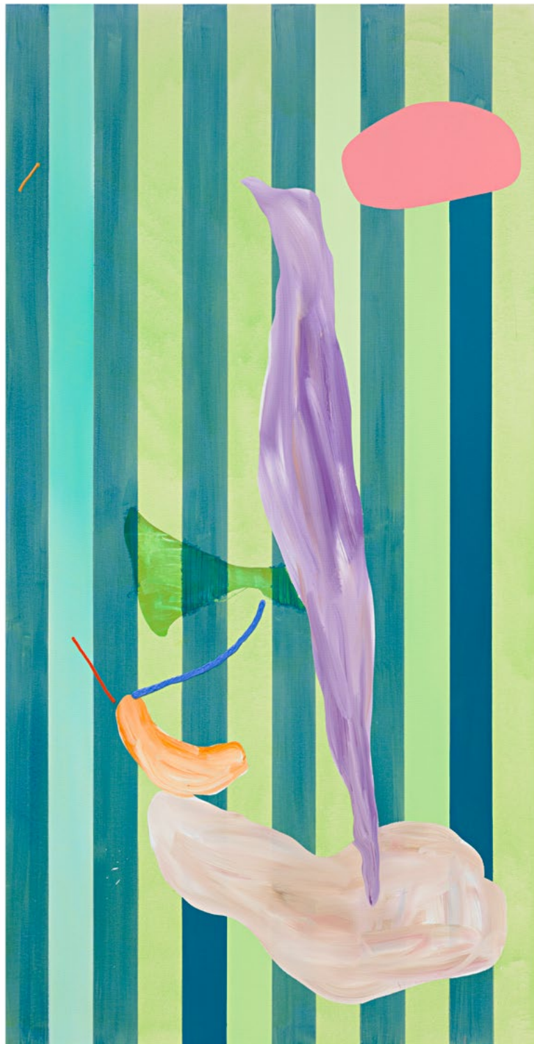
Andreas Breunig E_C_P_No08 , 2021 Acrylic, oil, graphite and charcoal on canvas 90 1/2 x 47 1/4 in 230 x 120 cm (ABR21.025)