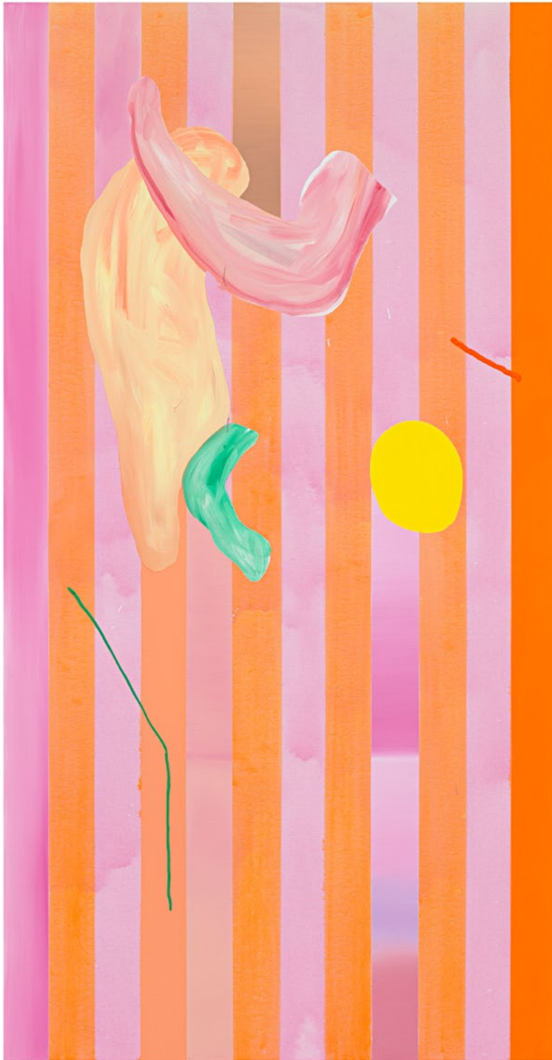
Andreas Breunig E_C_P_No11 , 2021 Acrylic, oil, graphite and charcoal on canvas 90 1/2 x 47 1/4 in 230 x 120 cm (ABR21.023)