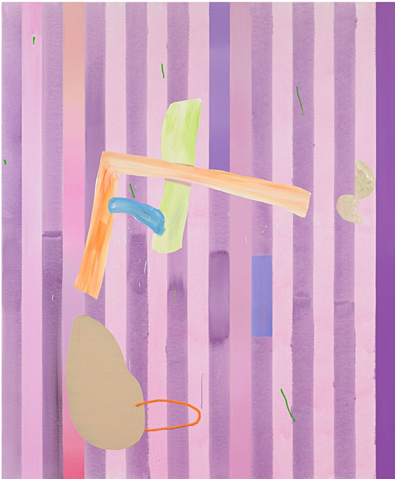
Andreas Breunig E_C_P_No07 , 2021 Acrylic, oil, graphite and charcoal on canvas 90 1/2 x 74 3/4 in 230 x 190 cm (ABR21.013)