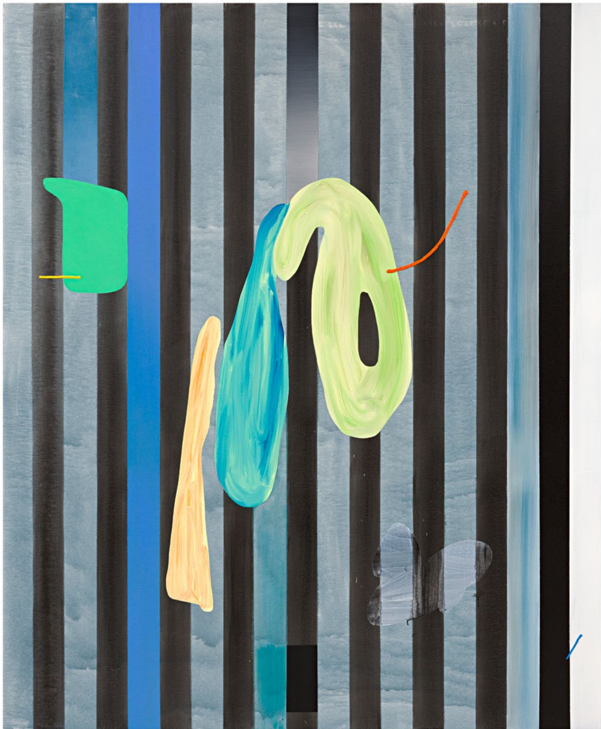
André Butzer E_C_P_No17 , 2019 Oil on canvas 87 1/2 x 68 in 222.3 x 172.7 cm (AB19.078)