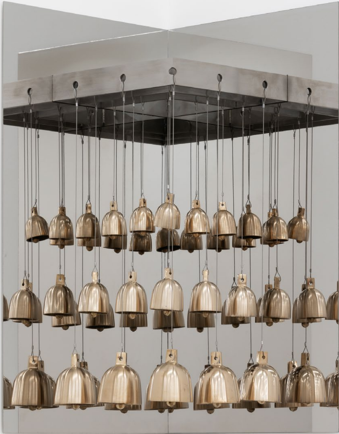
Resonating Space (Square Bells 90°) , 2021 | Various size of bronze bells, steel, stainless steel mirror polished | 24 3/4 x 16 1/2 x 17 3/8 in 63 x 42 x 44 cm (NAL21.010)