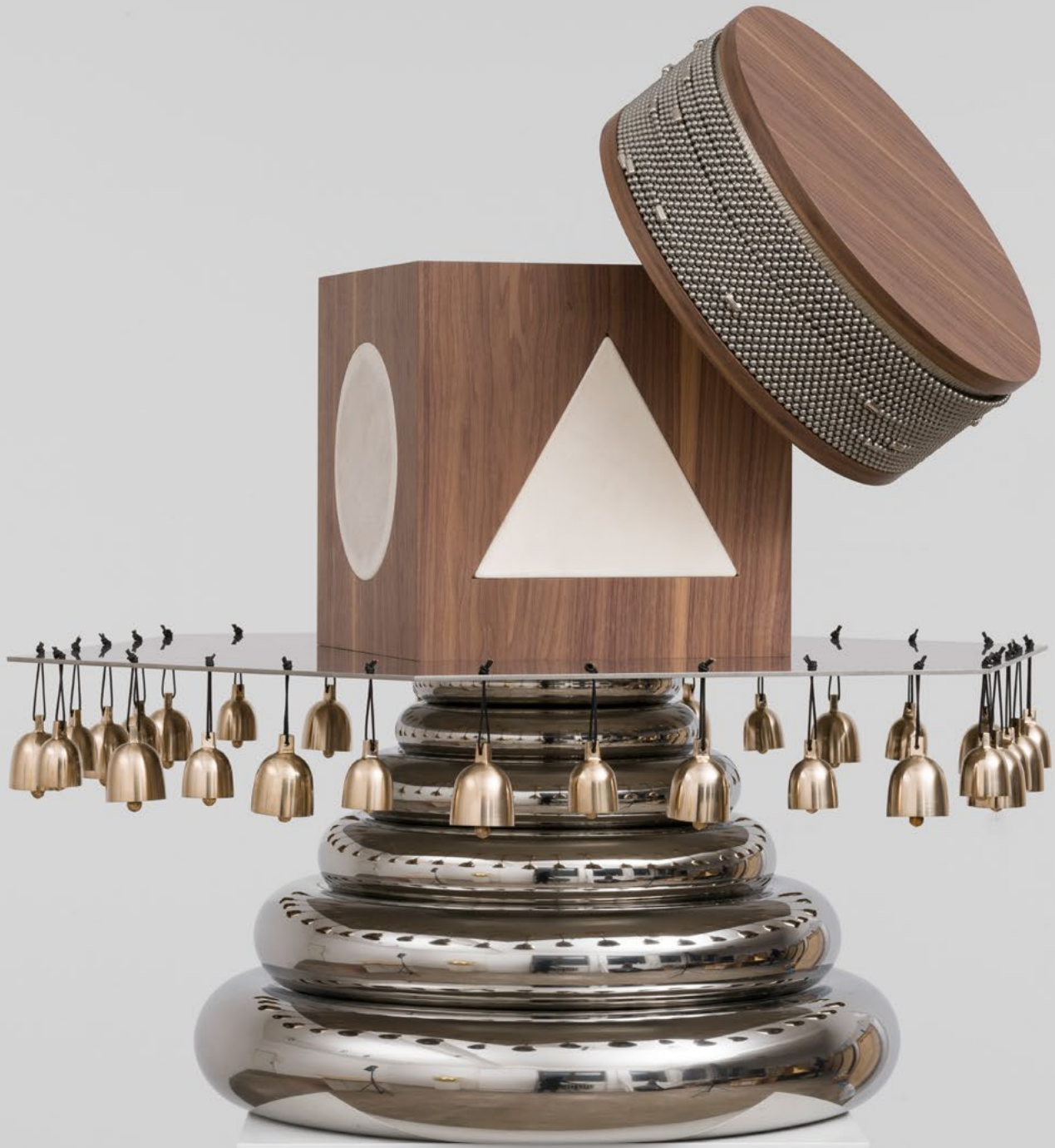
Resonator Percussion , 2019 | Stainless steel, plywood, leather, bronze Ed 3/3 | 37 3/8 x 39 3/8 x 39 3/8 in, 95 x 100 x 100 cm | (NAL21.003)