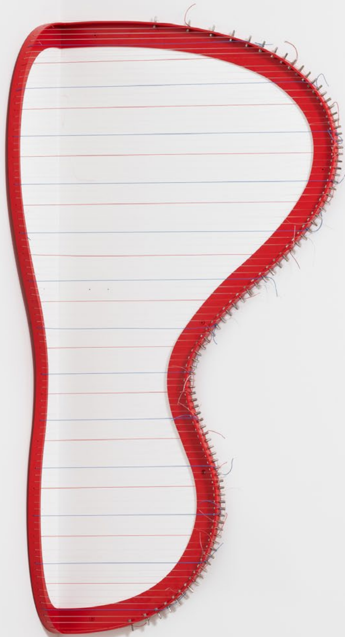
Resonating Space (Corner Harp, red) , 2021 | Powder coated steel, colored red, harp mechanism, strings | 74 3/8 x 35 1/8 x 14 5/8 in, 189 x 89 x 37 cm (NAL21.009)