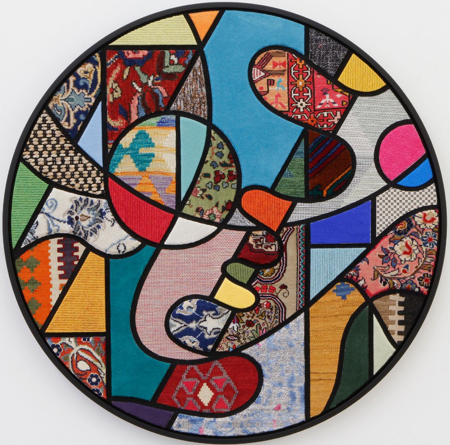
Social Fabric (match) , 2021 | Carpet pieces on wood, framed | 41 x 41 in, 104 x 104 cm | (NAL21.004)