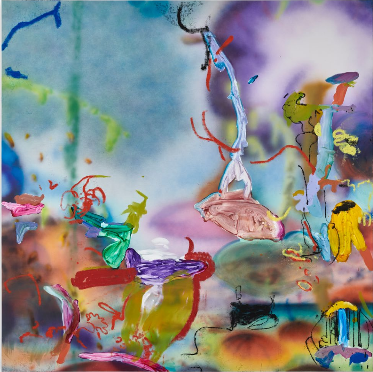
outdoor we miss you! , 2022 | Acrylic on canvas | 78 3/4 x 78 3/4 in, 200 x 200 cm | (HOR22.002)