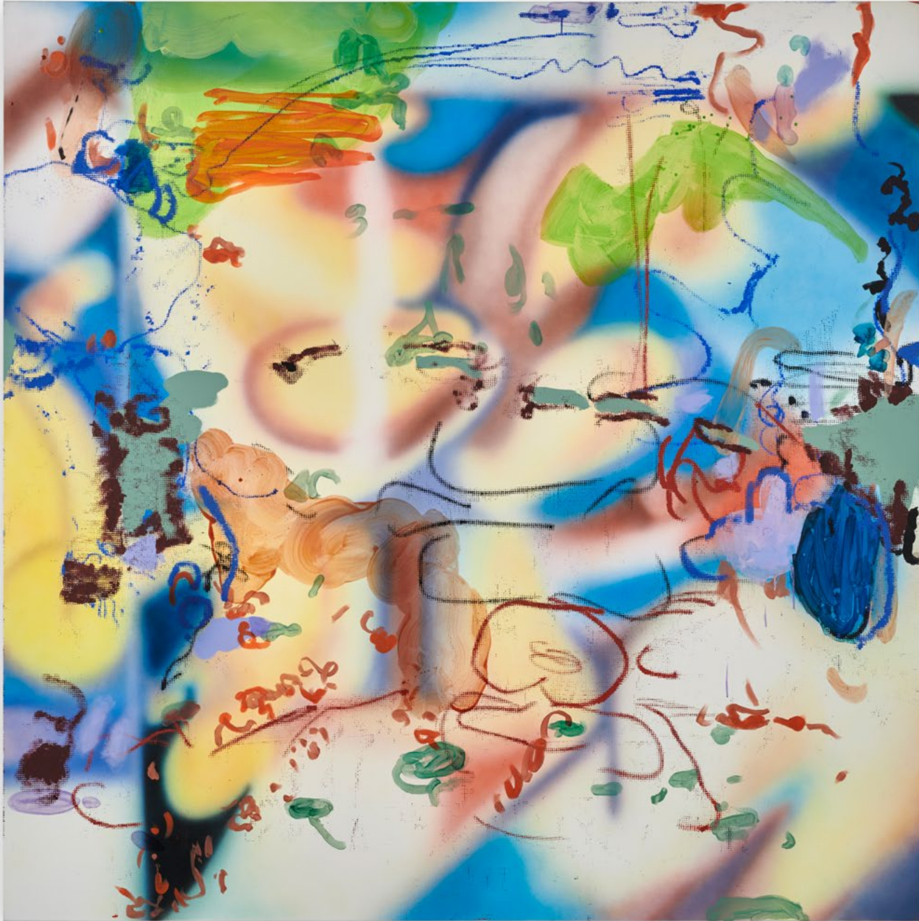
golden coffee addict , 2022 | Acrylic on canvas | 78 3/4 x 78 3/4 in, 200 x 200 cm | (HOR22.018) |