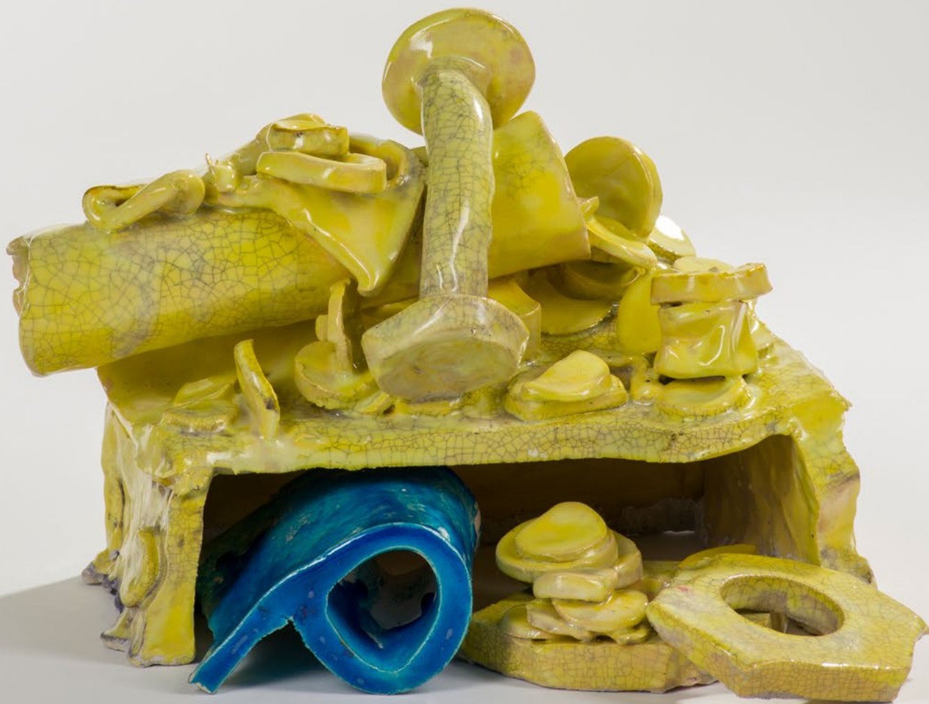
Picsou's most relevant tool , 2022 | Glazed Ceranmic | Various Dimensions | (HOR22.030)