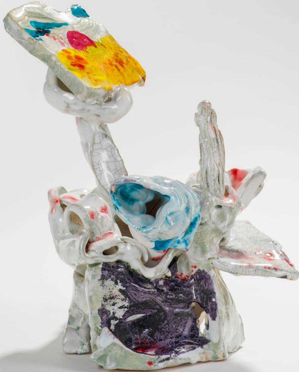
Escorte us to nung river , 2022 | Glazed Ceranmic | Various Dimensions | (HOR22.024)