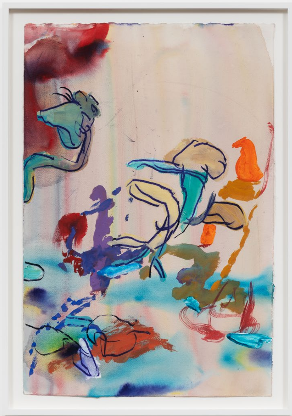
Everyone is waiting for a stack of something , 2022 | Acrylic and ink on 300g paper | 23 5/8 x 15 3/4 in, 60 x 40 cm (HOR22.014)