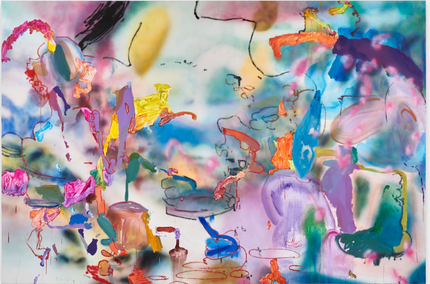
language parade , 2022 Acrylic on canvas 78 3/4 x 118 1/8 in 200 x 300 cm | (HOR22.006)