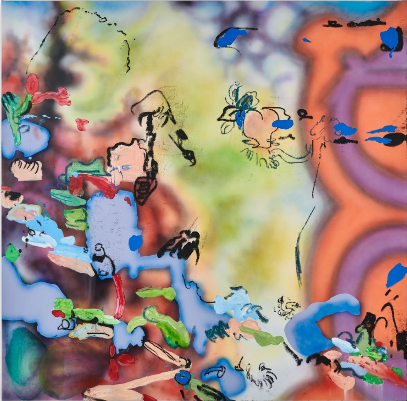
den is a bridge, go find it , 2022 | Acrylic on canvas | 78 3/4 x 78 3/4 in, 200 x 200 cm | (HOR22.003)