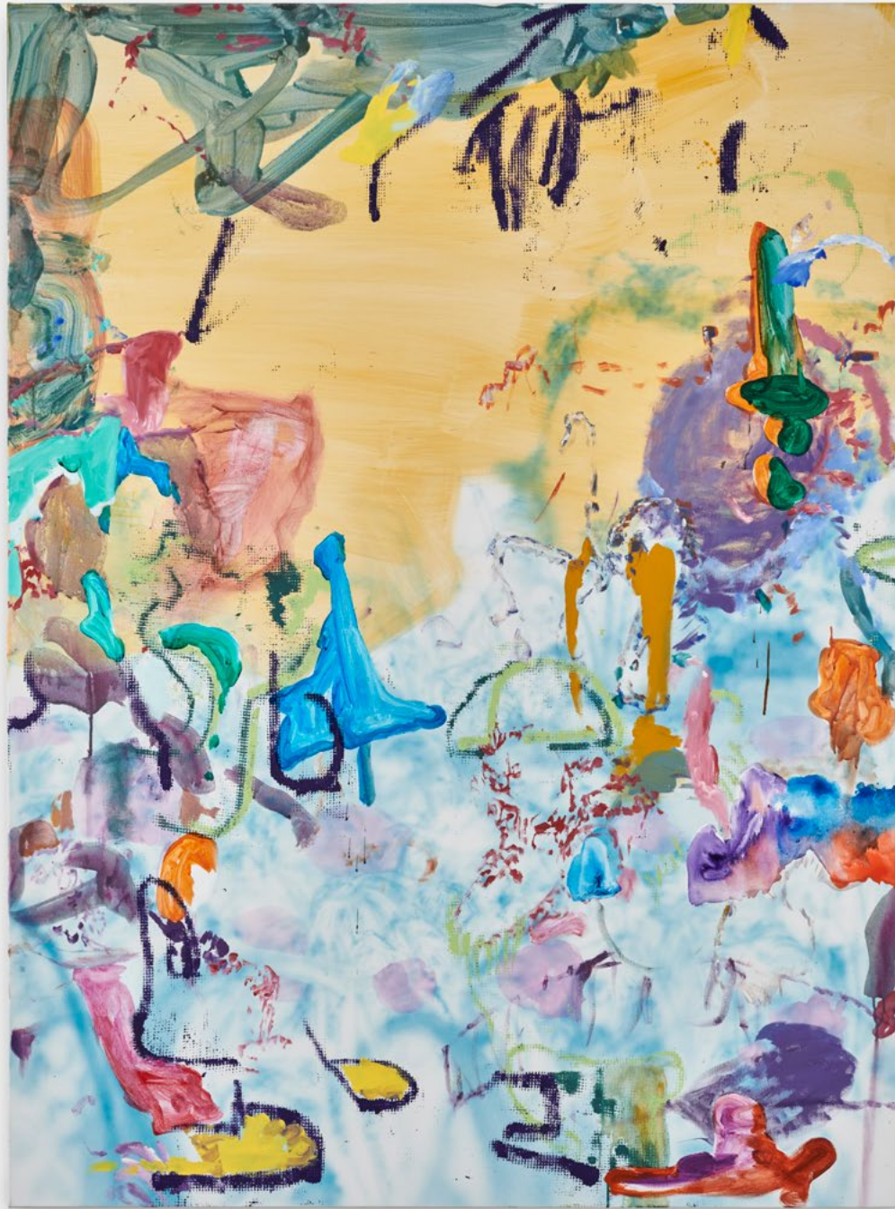
crunch the branches it's hot , 2022 | Acrylic on canvas | 68 7/8 x 51 1/8 in, 175 x 130 cm | (HOR22.022)