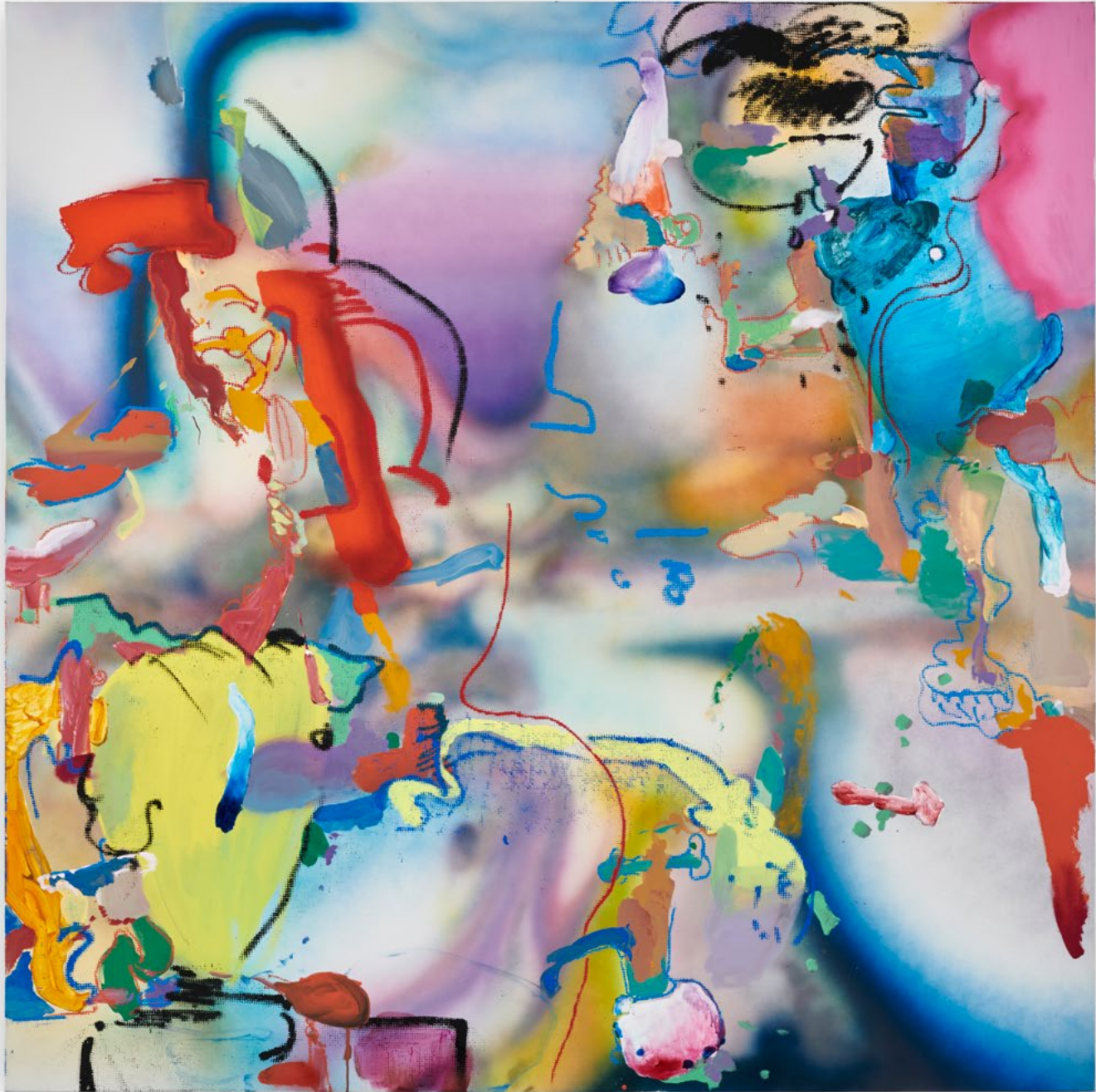
cosmopurps , 2022 | Acrylic on canvas | 78 3/4 x 78 3/4 in, 200 x 200 cm | (HOR22.015)