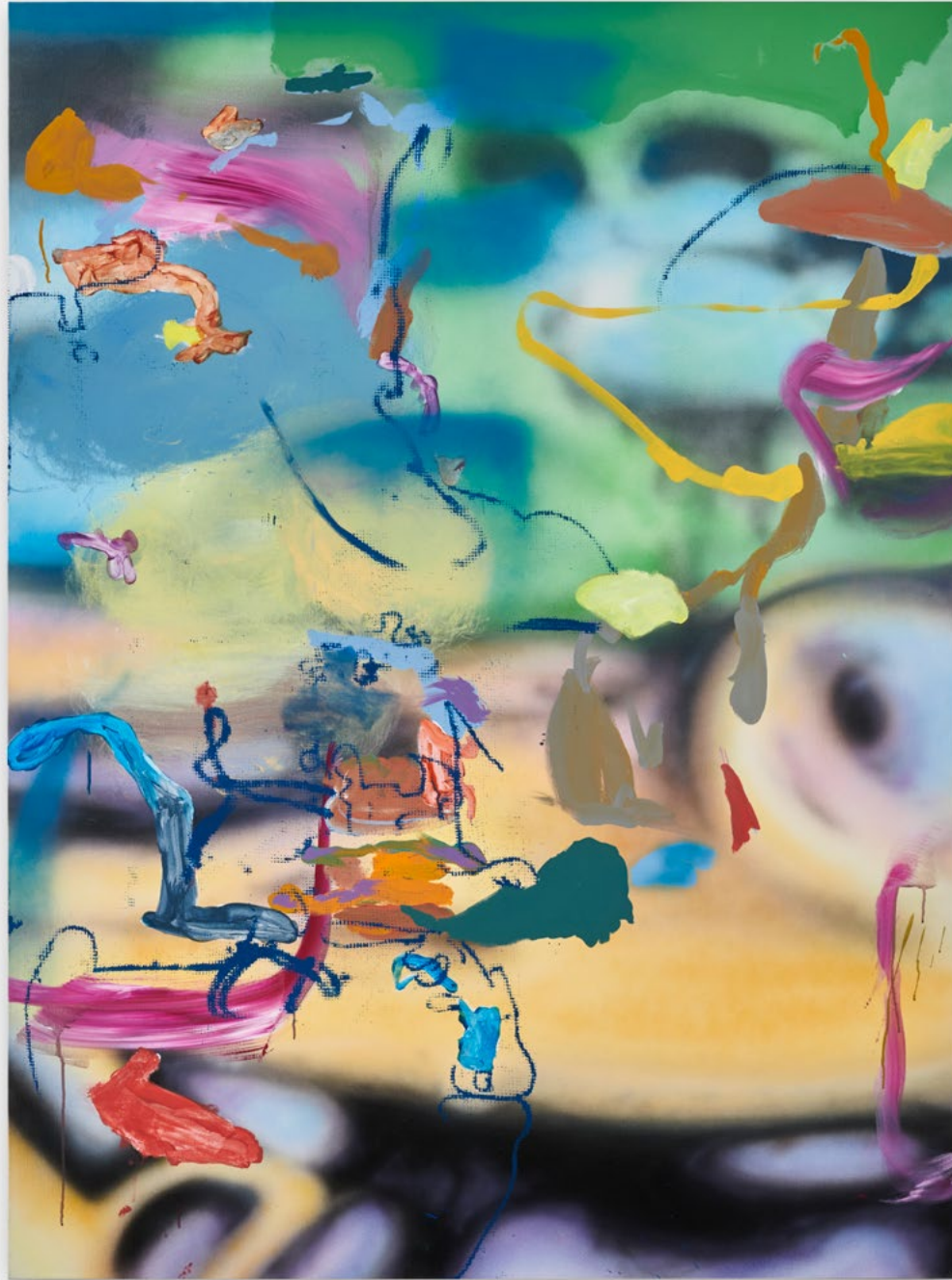
battle-toads battle-maniacs , 2022 | Acrylic on canvas | 68 7/8 x 51 1/8 in, 175 x 130 cm | (HOR22.021)