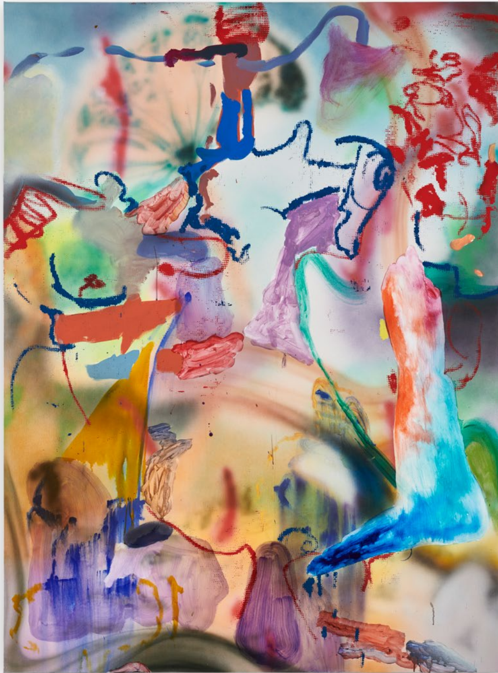
micro culture re/set/search , 2022 | Acrylic on canvas | 68 7/8 x 51 1/8 in, 175 x 130 cm | (HOR22.005)