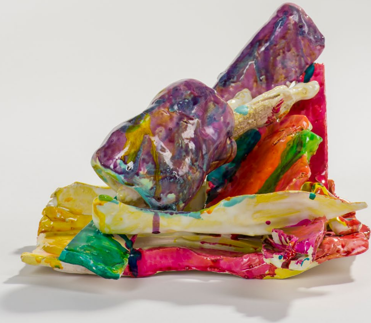
Eat my shorts , 2022 | Glazed Ceranmic | Various Dimensions | (HOR22.026)