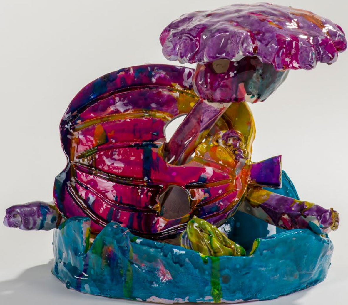
Traces of introspection , 2022 | Glazed Ceramic | Various Dimensions | (HOR22.028)