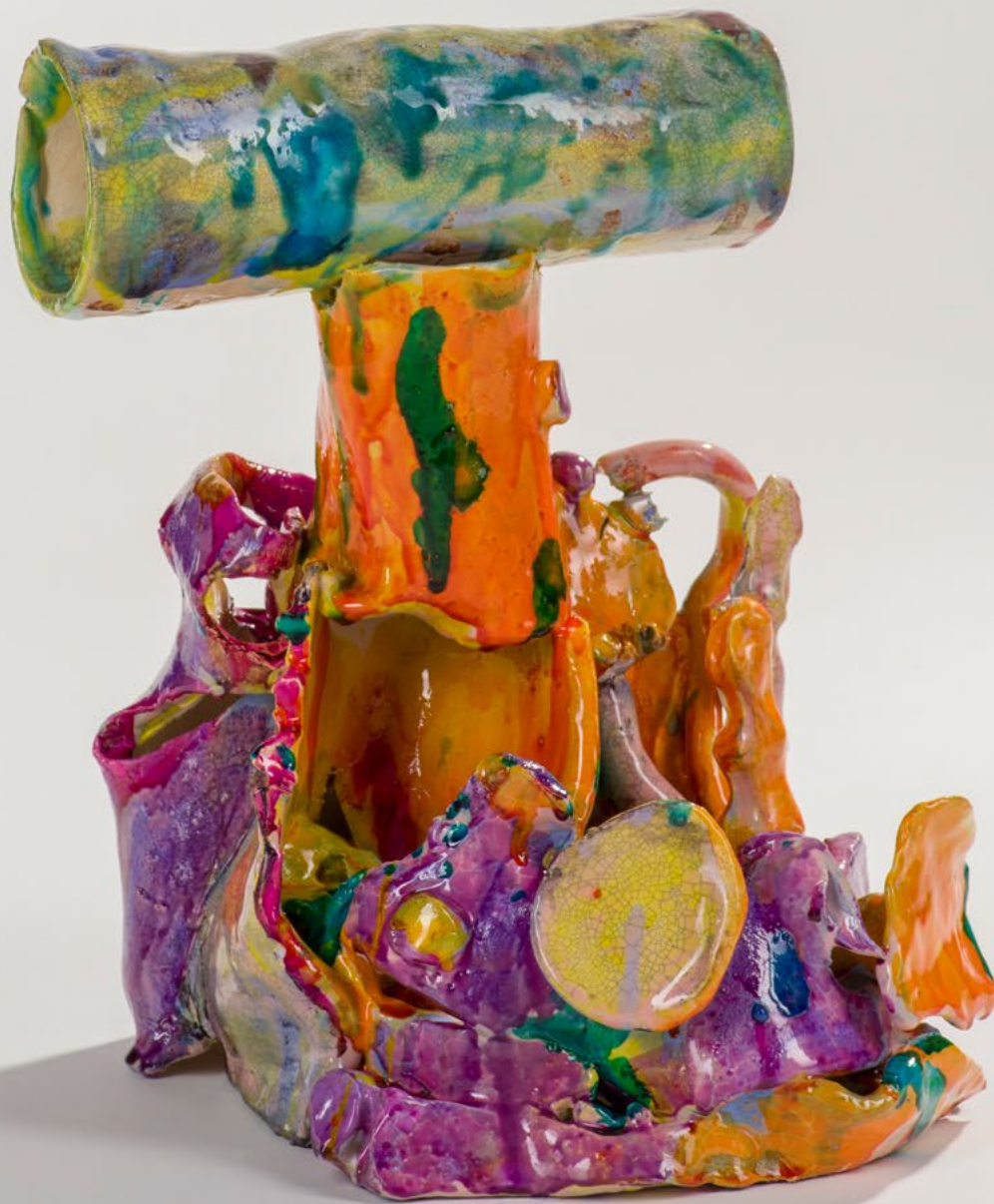
Frozen's trash , 2022 | Glazed Ceranmic | Various Dimensions | (HOR22.027)