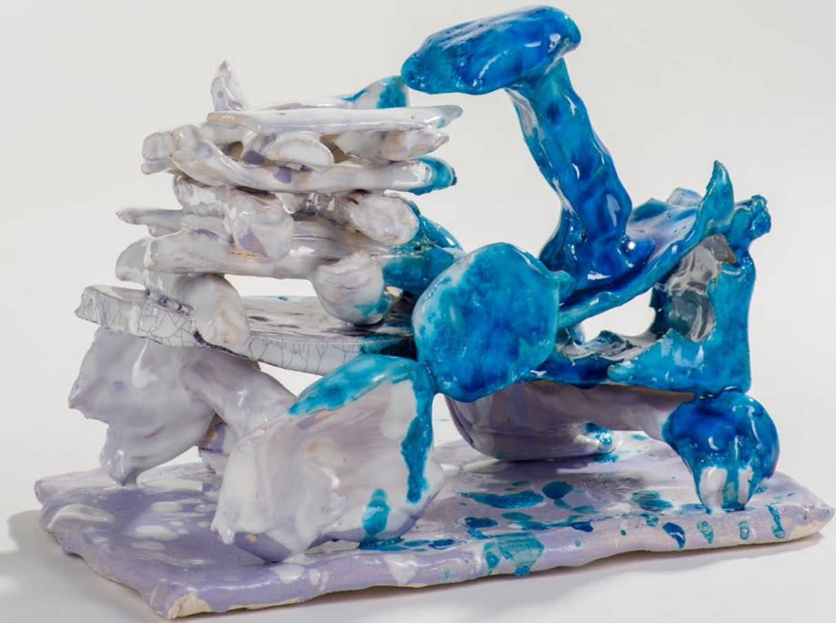
The ballad of Narayama , 2022 | Glazed Ceranmic | (HOR22.029) |