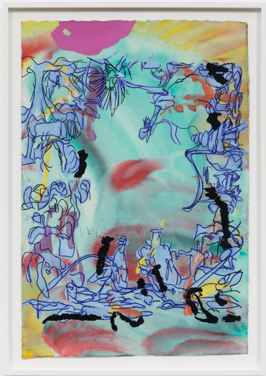
Inside the vacuum , 2022 | Acrylic and ink on 300g paper | 23 5/8 x 15 3/4 in, 60 x 40 cm | (HOR22.012)