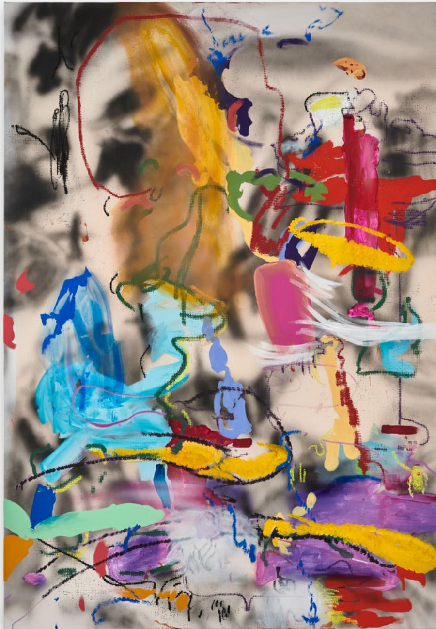
a village in the snow can shine , 2022 | Acrylic on canvas | 68 7/8 x 51 1/8 in, 175 x 130 cm | (HOR22.008)