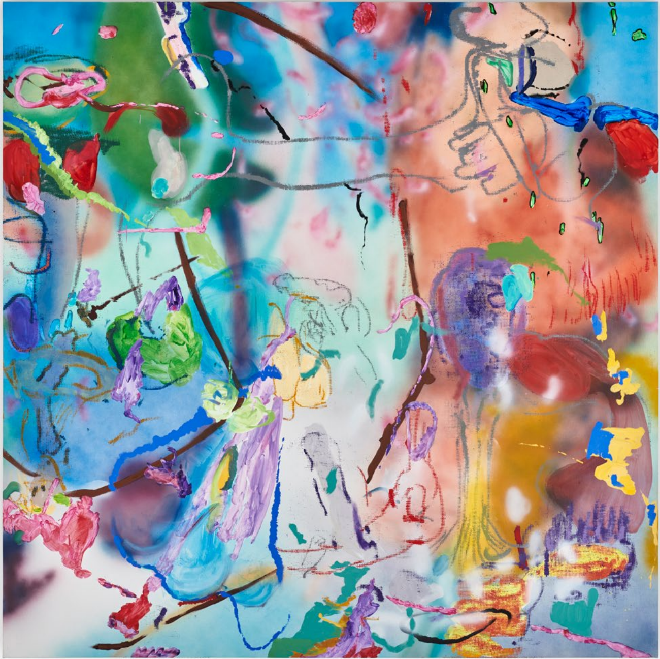
splatter house-ish (up side down) , 2022 | Acrylic on canvas | 78 3/4 x 78 3/4 in, 200 x 200 cm | (HOR22.019)