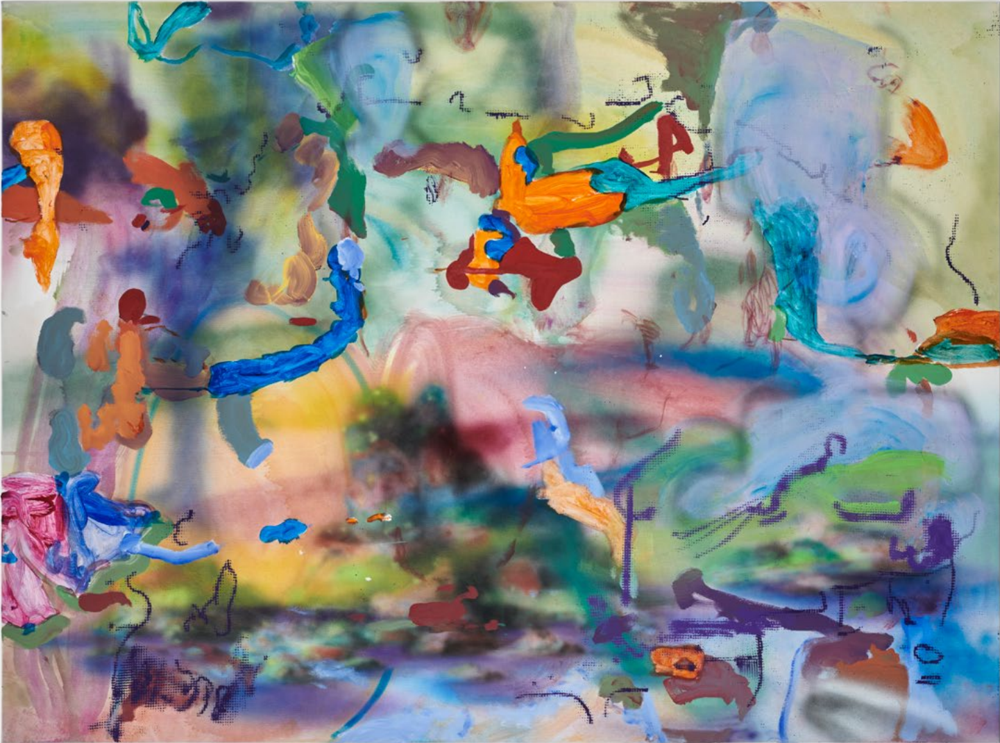
even dream islands got grey zones , 2022 | Acrylic on canvas | 51 1/8 x 68 7/8 in, 130 x 175 cm | (HOR22.016)