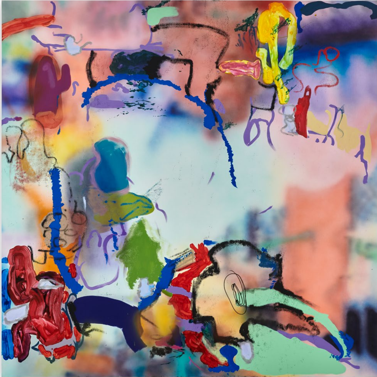
heavy obstacles , 2022 | Acrylic on canvas | 78 3/4 x 78 3/4 in, 200 x 200 cm | (HOR22.001)