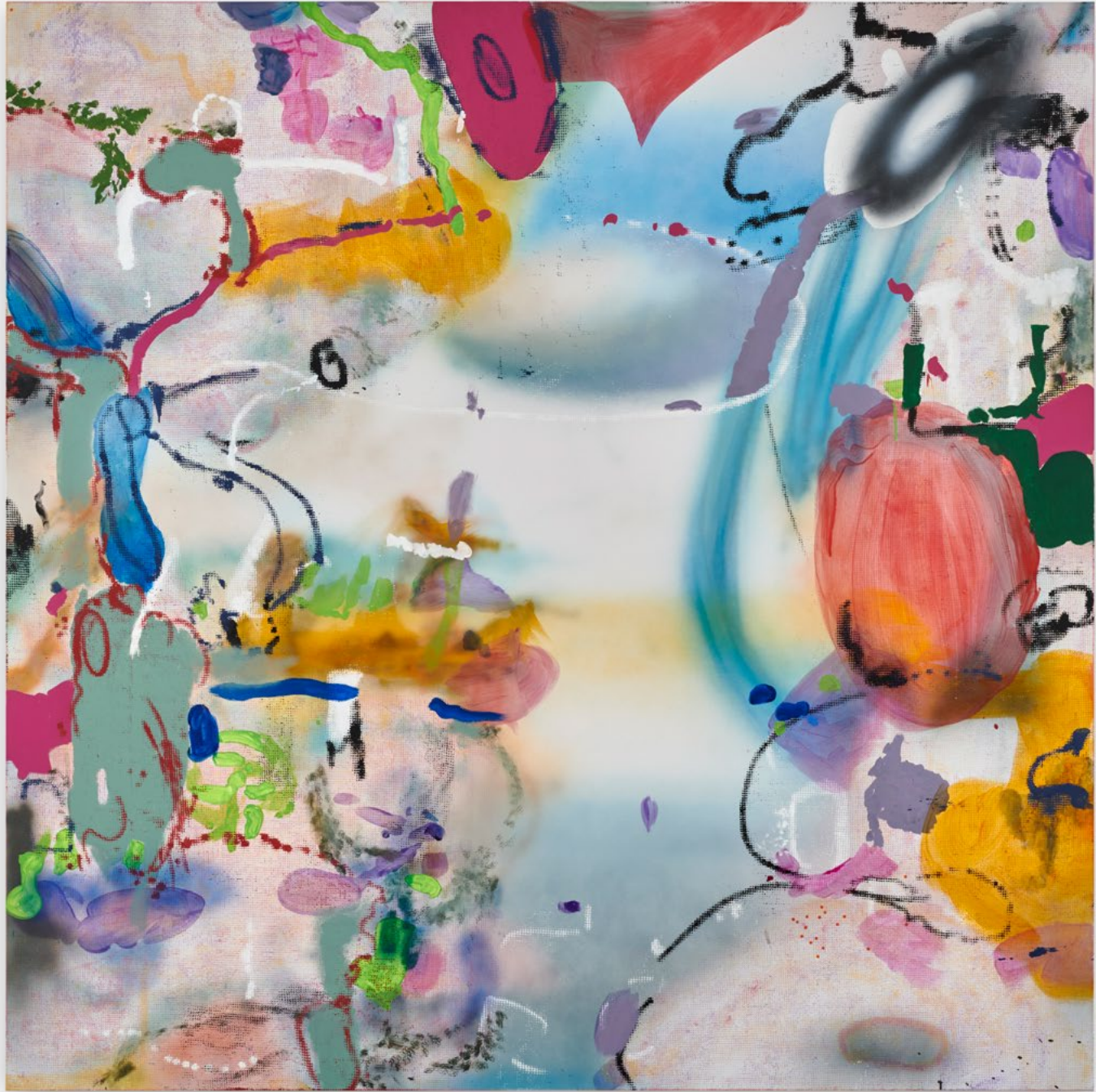
that sweat manège de nuit , 2022 | Acrylic on canvas | 78 3/4 x 78 3/4 in, 200 x 200 cm | (HOR22.020)