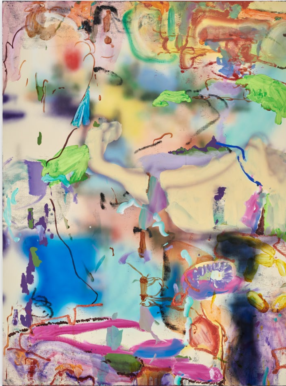
a stack of horizons for a child , 2022 | Acrylic on canvas | 68 7/8 x 51 1/8 in, 175 x 130 cm | (HOR22.017)