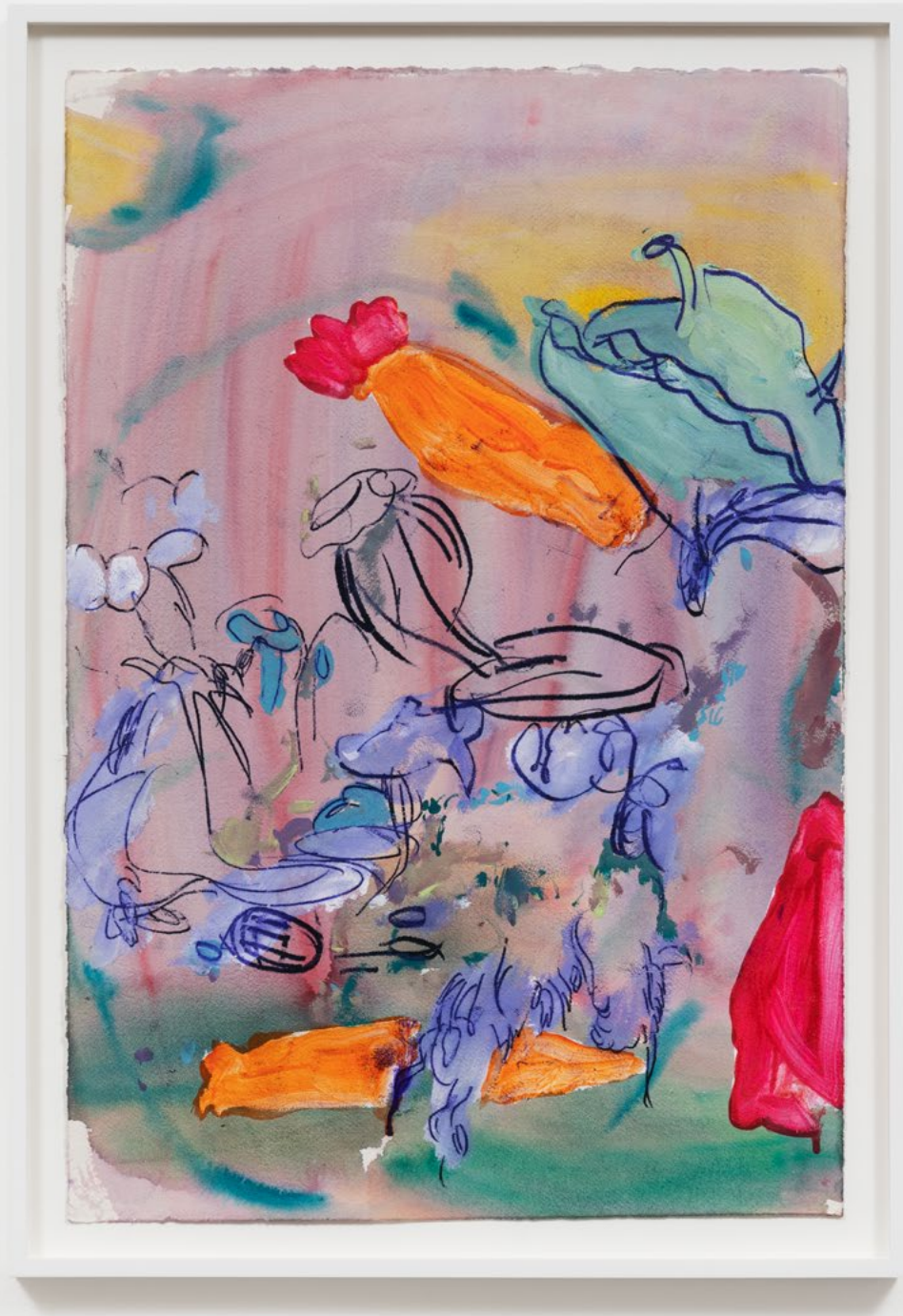
Micro cochmuck , 2022 | Acrylic and ink on 300g paper | 23 5/8 x 15 3/4 in, 60 x 40 cm | (HOR22.010)