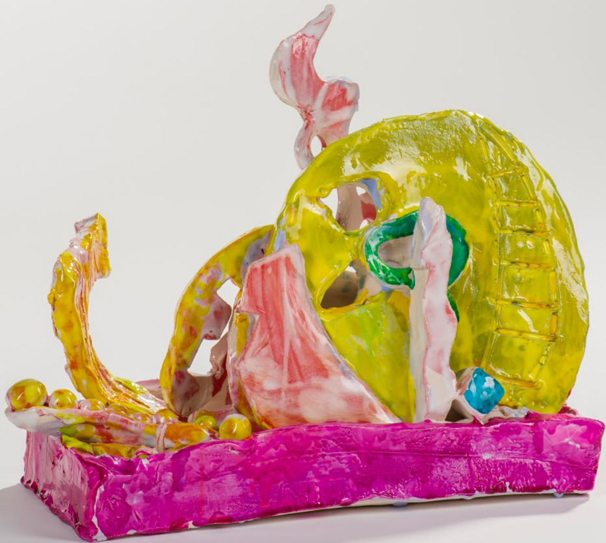
Ice cube will save you! , 2022 | Glazed Ceramic | Various Dimensions | (HOR22.025)