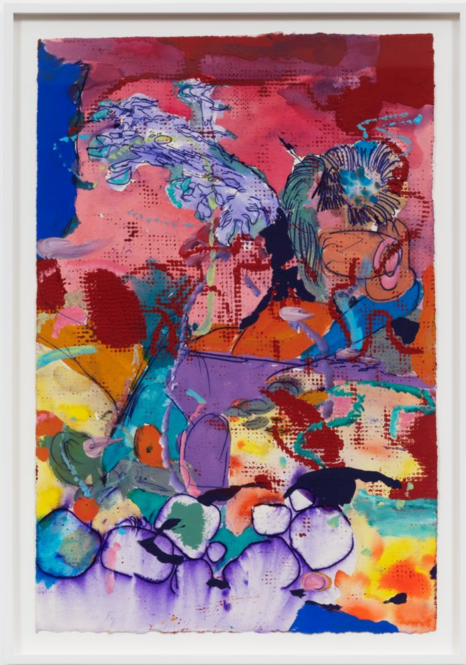
Mature nature , 2022 | Acrylic and ink on 300g paper | 23 5/8 x 15 3/4 in, 60 x 40 cm | (HOR22.013)