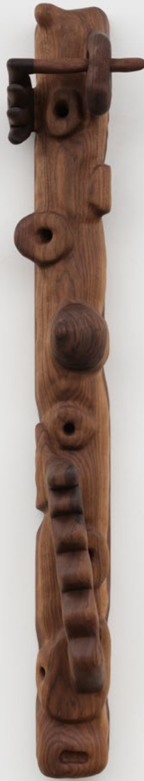
Sculptural Wall Light - Hedylogos, 2022 | Oiled walnut | 80 x 14 1/2 x 11 1/2 in, 203.2 x 36.8 x 29.2 cm | (CMC22.004)