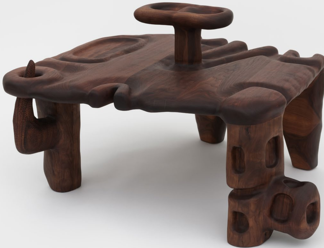
Rhino Horn Coffee Table , 2022 | Oiled walnut | 27 x 40 1/2 x 50 in, 68.6 x 102.9 x 127 cm | (CMC22.003)