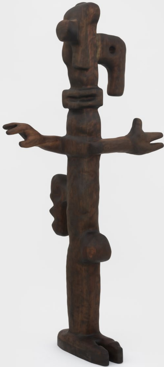
Shake Hands Cross Fingers , 2022 | Oxidized cherry | 80 x 37 x 27 in, 203.2 x 94 x 68.6 cm | (CMC22.013)