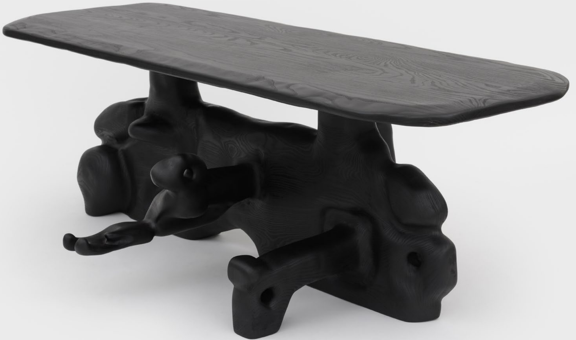
Reach Out Low Table , 2022 | Ebonized ash | 23 x 66 x 36 in, 58.4 x 167.6 x 91.4 cm | (CMC22.012)