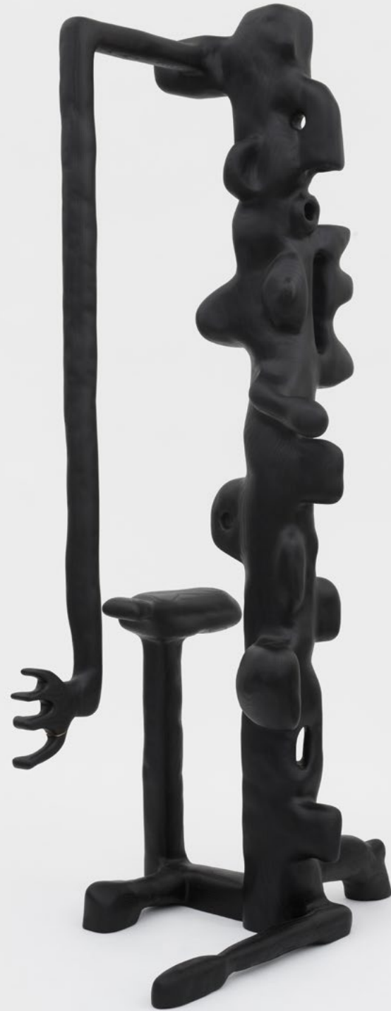
Power of Myth , 2022 | Ebonized ash | 86 x 42 x 27 in, 218.4 x 106.7 x 68.6 cm | (CMC22.011)