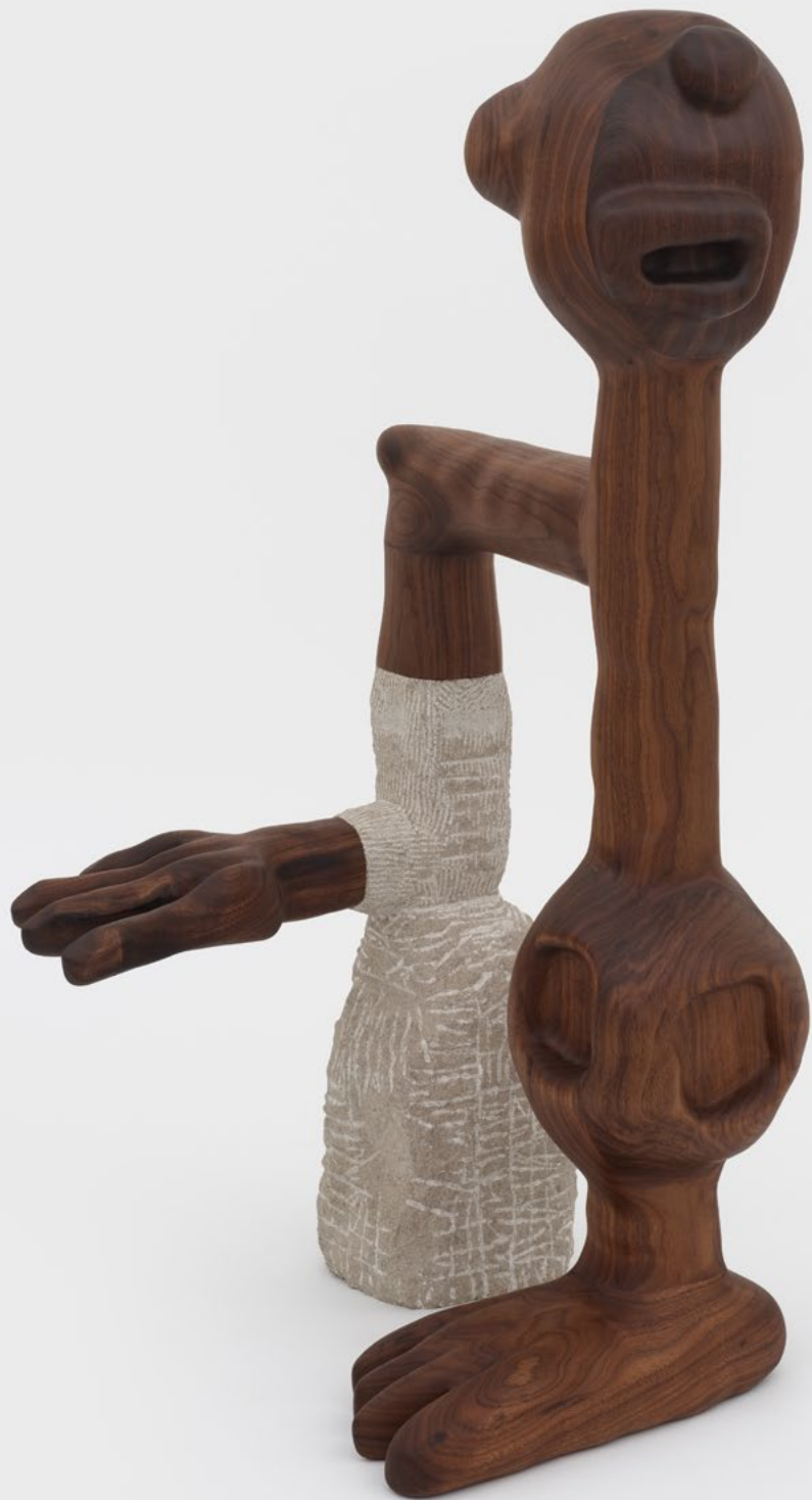
Head with Hand with Foot , 2022 | 41 x 21 x 21 in, 104.1 x 53.3 x 53.3 cm | (CMC22.019)