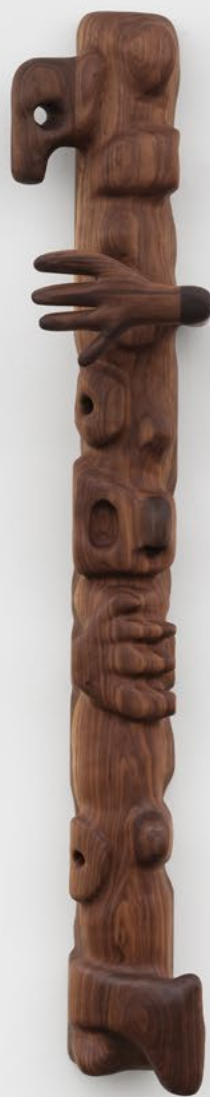
Sculptural Wall Light - Shy Guy , 2022 | Oiled walnut | 80 x 16 1/2 x 11 1/2 in, 203.2 x 41.9 x 29.2 cm | (CMC22.005)