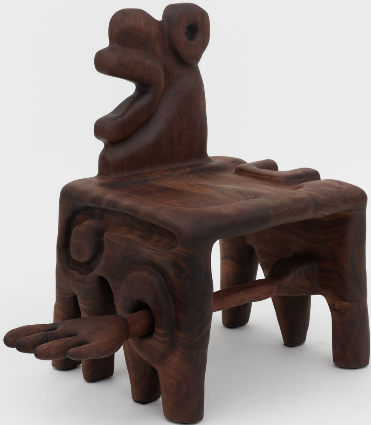
Sculptural Chair (frog) , 2022 | Oiled walnut | 34 1/2 x 35 1/2 x 21 1/2 in, 87.6 x 90.2 x 54.6 cm | (CMC22.002)