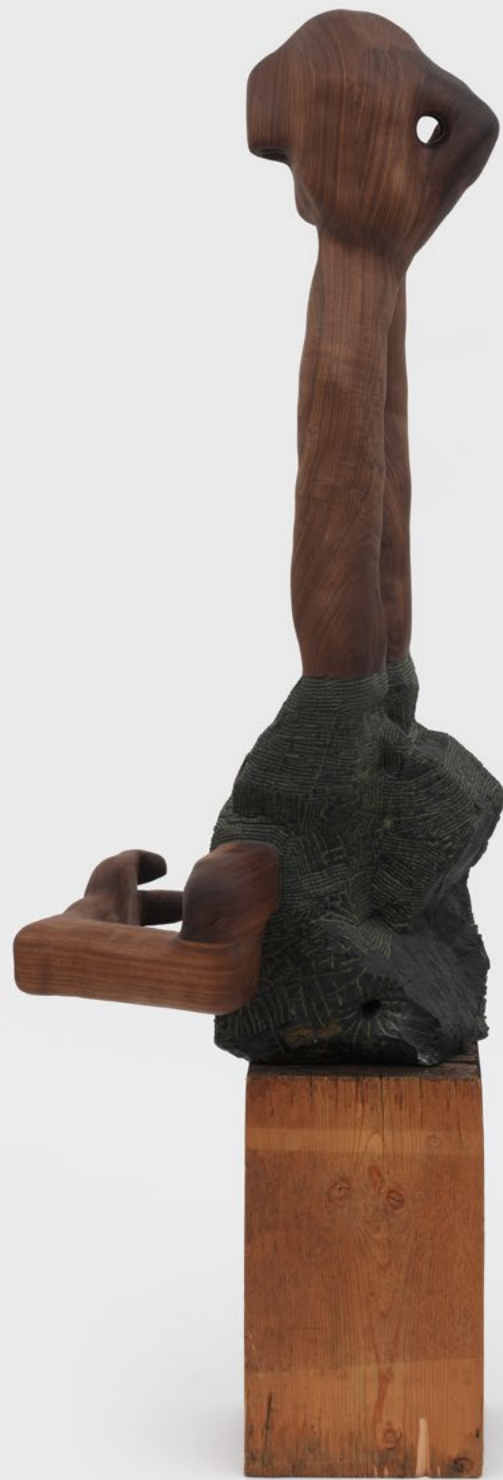
Head with Hands 2 , 2022 | Claro walnut and chlorite | 69 1/2 x 20 x 17 in, 176.5 x 50.8 x 43.2 cm | (CMC22.010)