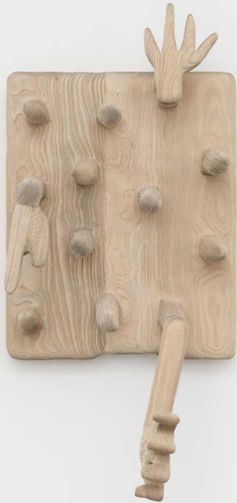
Conversation on a Wall Part 3 , 2022 | Sandblasted ash | 48 x 25 x 28 1/2 in, 121.9 x 63.5 x 72.4 cm | (CMC22.008)