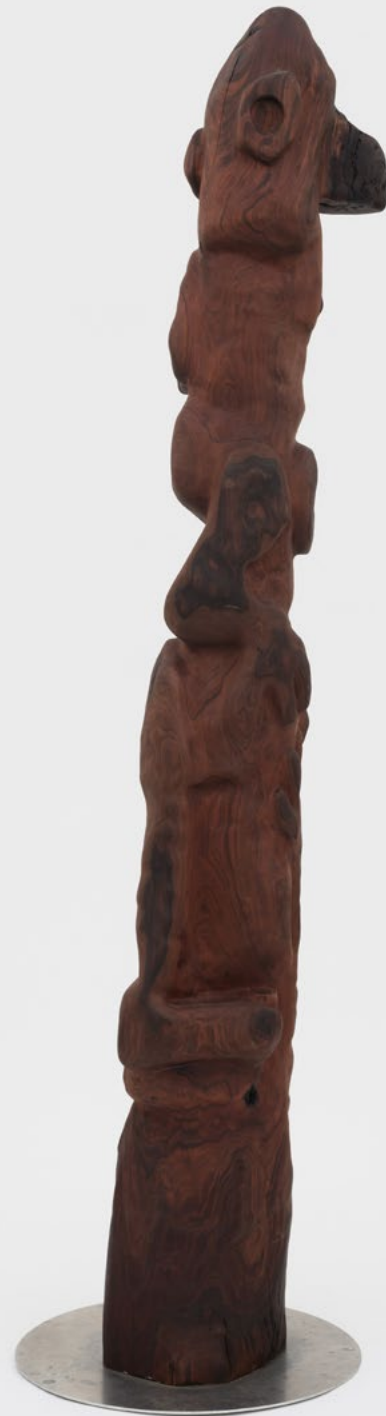
Claro Walnut Totem for Totum , 2021 | Claro walnut | 93 x 24 x 24 in 236.2 x 61 x 61 cm | (CMC22.018)