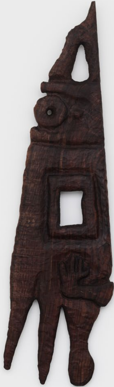
Hanging Sculpture , 2022 | Cedar | 91 x 26 x 5 in, 231.1 x 66 x 12.7 cm | (CMC22.016)