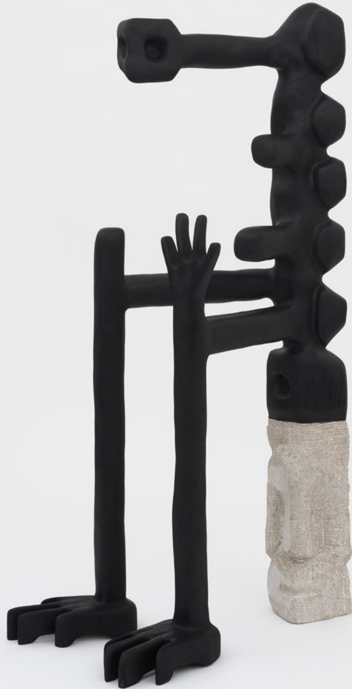
New Liberty, 2022 | Ebonized ash and limestone | 61 1/2 x 35 x 19 in, 156.2 x 88.9 x 48.3 cm | (CMC22.015)