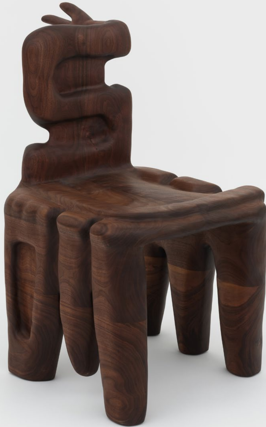
Sculptural Chair 2 (hand) , 2022 | Oiled walnut | 35 x 19 1/2 x 32 in, 88.9 x 49.5 x 81.3 cm | (CMC22.001)