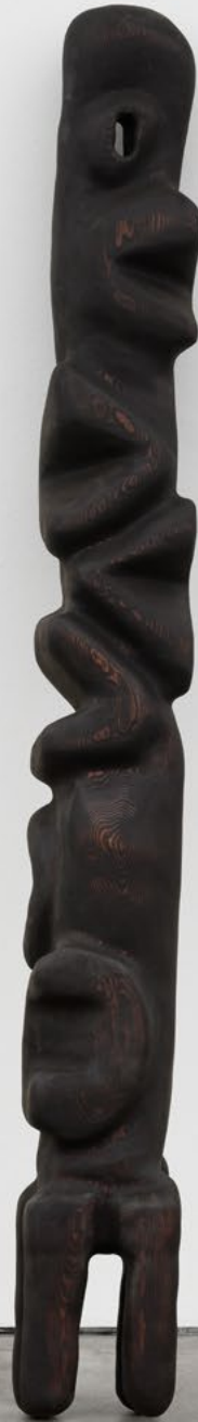
Hanging Sculpture 2 , 2022 | Doug fir | 72 x 8 x 8 in, 182.9 x 20.3 x 20.3 cm | (CMC22.017)