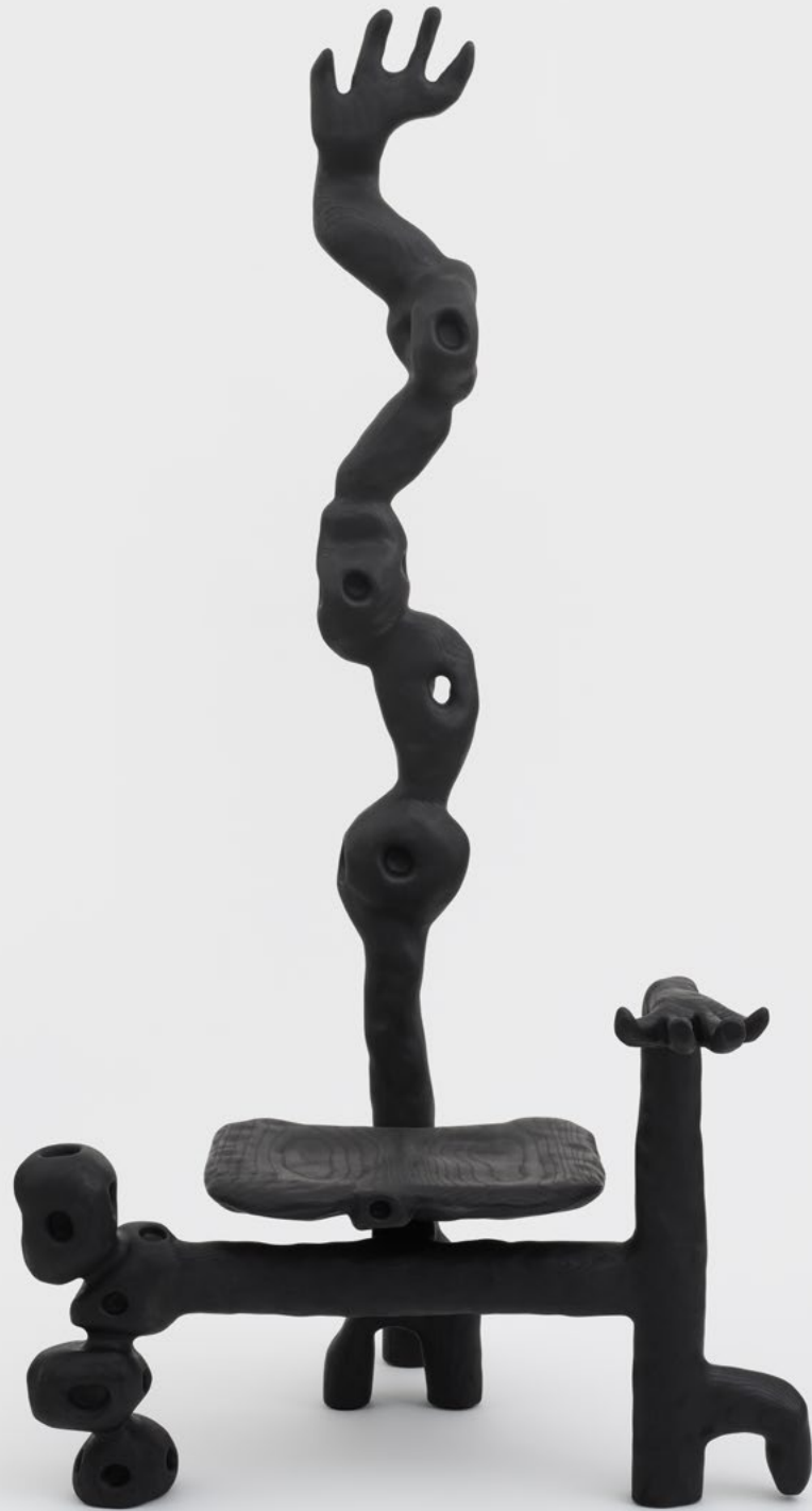
Throne Chair , 2022 | Ebonized ash | 84 1/2 x 38 x 43 in, 214.6 x 96.5 x 109.2 cm | (CMC22.014)