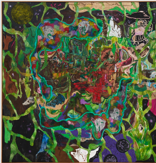
Yellow Moon and Moss-Family Gathering , 2022 | Oil, acrylic, and pastels on canvas 76 x 73 in, 193 x 185.4 cm (framed) | (MBA22.006)