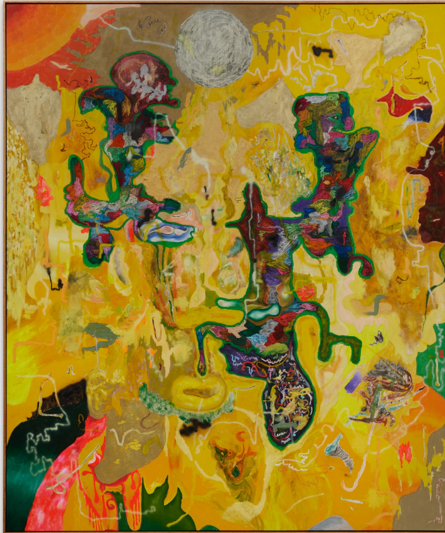
Back to Ether Cave (Hidden Aunt) , 2022 | Oil, acrylic, and pastels on canvas | 72 x 60 in, 182.9 x 152.4 cm (framed) | (MBA22.004)