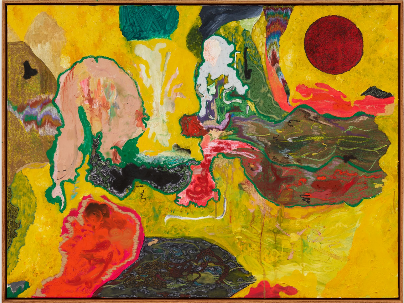
Exhale (Ether-Mother) , 2022 | Oil, acrylic, and pastels on canvas | 30 x 40 in, 76.2 x 101.6 cm (framed) | MBA22.013