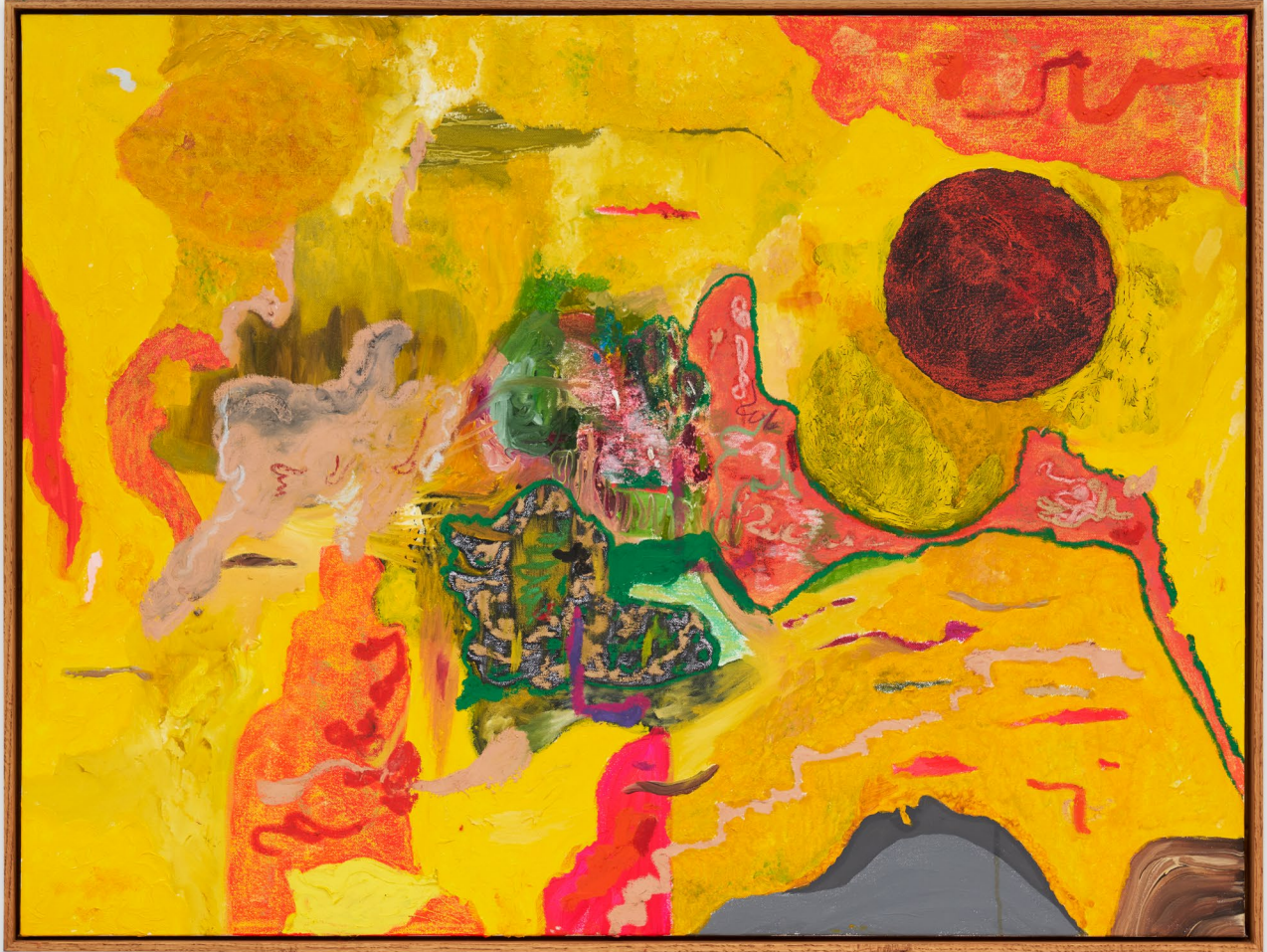
Inhale (Ether-Father) , 2022 | Oil, acrylic, and pastels on canvas | 30 x 40 in, 76.2 x 101.6 cm (framed) | (MBA22.014)