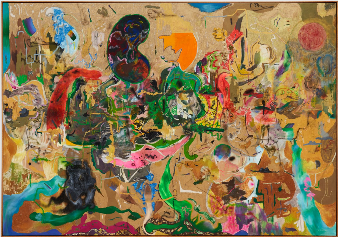
Drunk Bean Man and Golden Dawn , 2021 | Oil, acrylic, and pastels on canvas | 66 x 94 1/2 in, 167.6 x 240 cm (framed) | (MBA22.007)