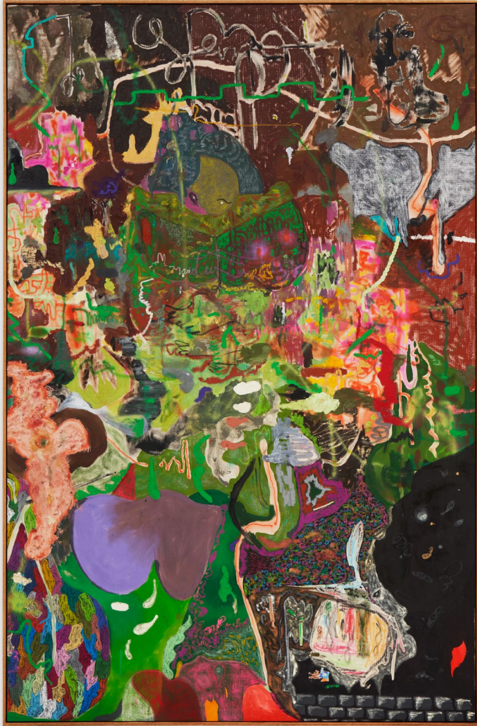
Moss-Father , 2022 | Oil, acrylic, and pastels on canvas | 75 x 49 in, 190.5 x 124.5 cm (framed) | (MBA22.009)