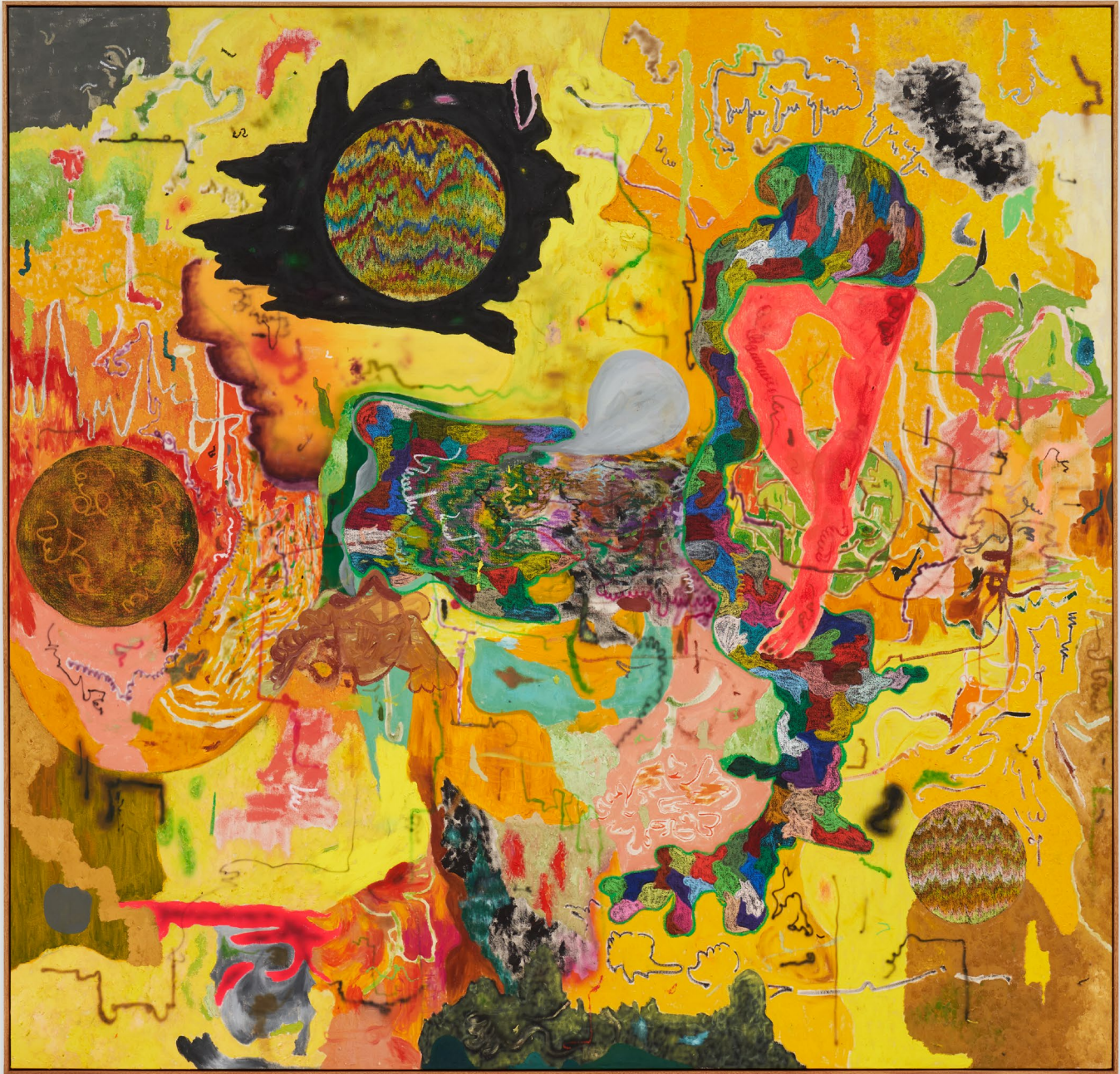
Land of Tiny Hands (Return to Ether Shelter) , 2022 | Oil, acrylic, and pastels on canvas | 77 1/2 x 80 1/2 in, 196.8 x 204.5 cm (framed) | (MBA22.003)