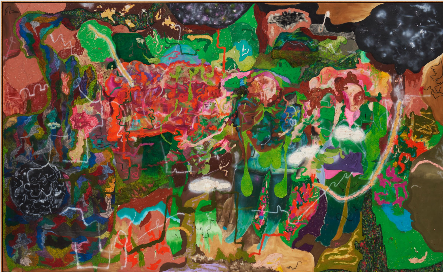
Two Psykers, Grey Aunt mirrored and Space Offerings , 2021 | Oil, crayon, pastel and acrylic on canvas | 67 x 109 in, 170.2 x 276.9 cm (MBA22.002)