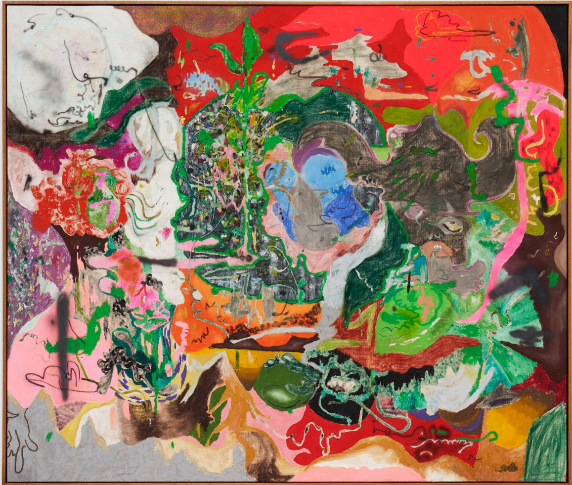
Plant and Grey Uncle (Birthdayboy) , 2022 | Oil, acrylic, and pastels on canvas | 48 1/2 x 57 in, 123.2 x 144.8 cm | (MBA22.011)