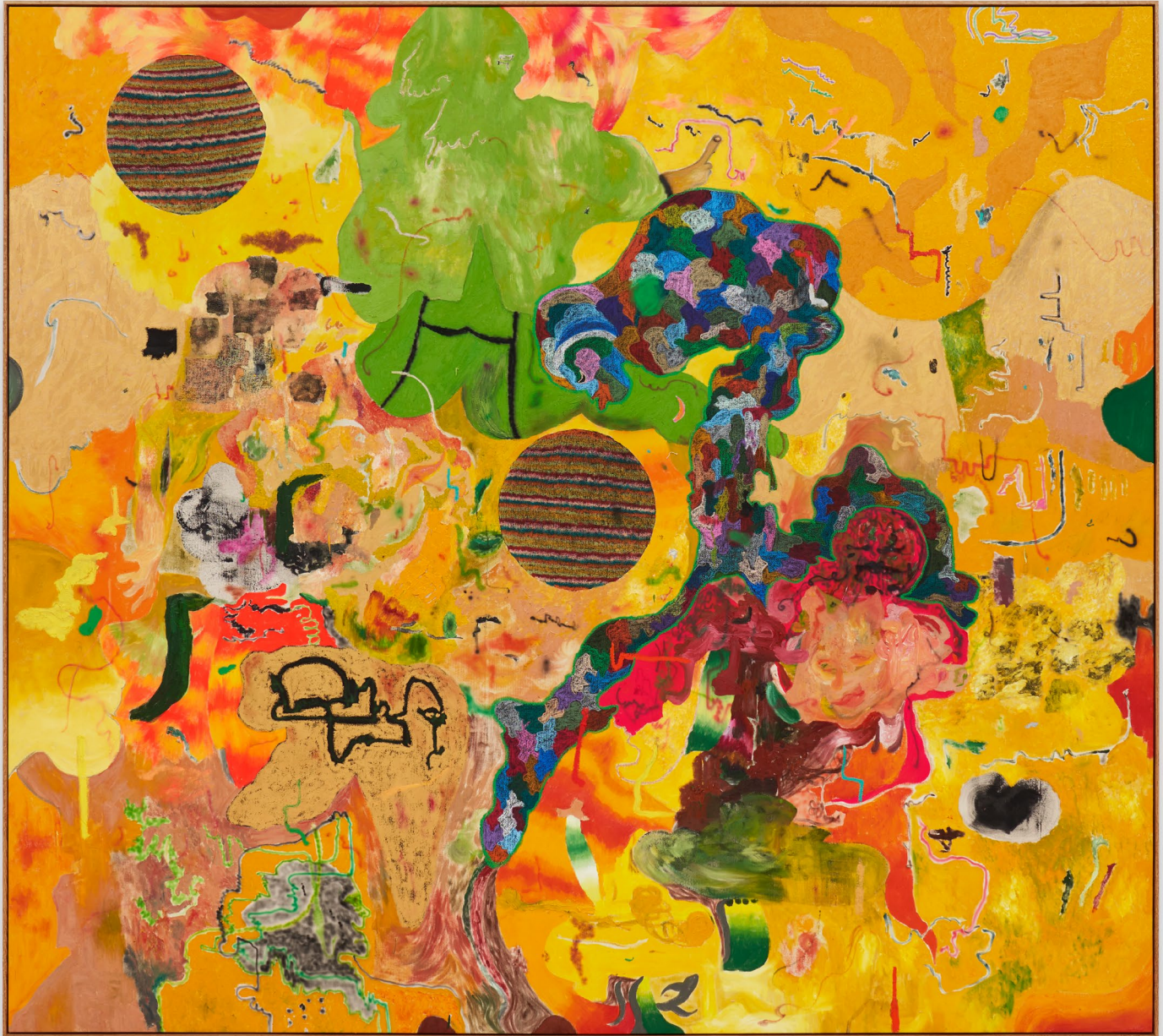
Green Woman, Two Moons (Return to Ether Shelter) , 2022 | Oil, acrylic, and pastels on canvas 86 x 96 in, 218.4 x 243.8 cm (framed) | (MBA22.012)