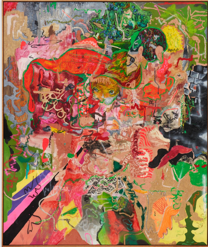
Couple and Vision , 2022 | Oil, acrylic, and pastels on canvas | 62 x 52 in, 157.5 x 132.1 cm (framed) | (MBA22.010)