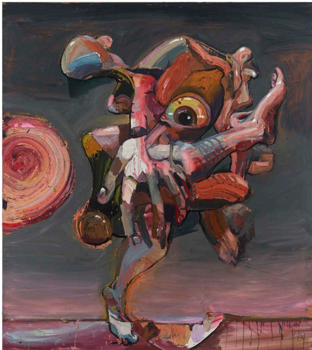
Ben Quilty The Bell Ringer , 2022 Oil on linen 79 1/2 x 70 7/8 in 202 x 180 cm

LOS ANGELES | BRUSSELS | NEW YORK | MARFA