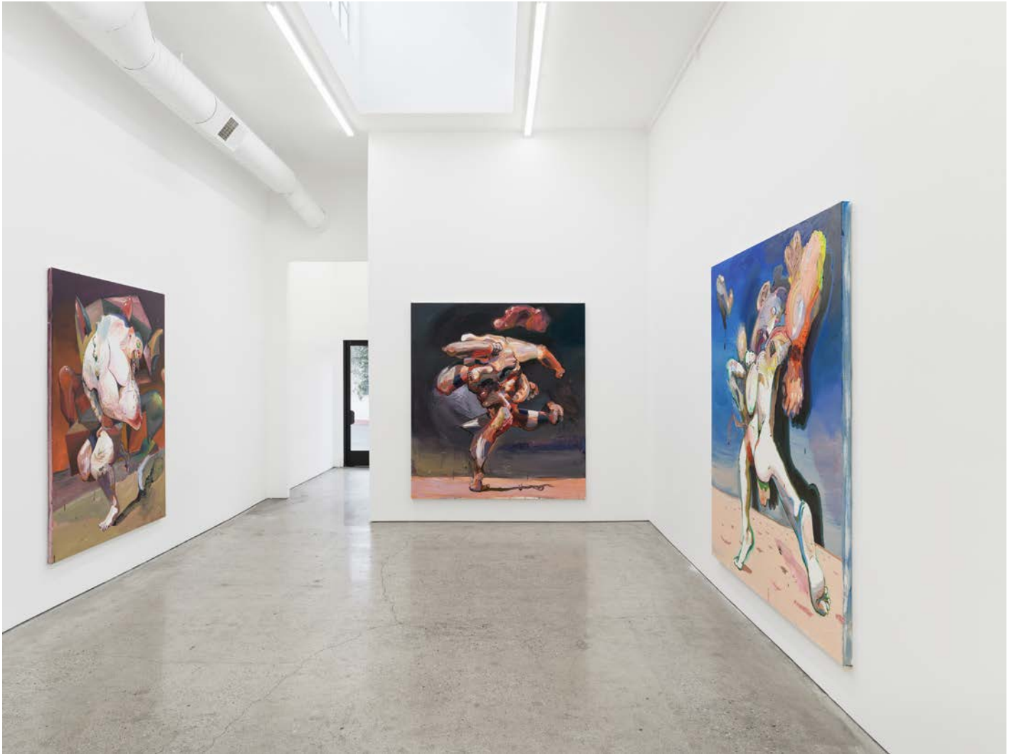
Installation view of Ben Quilty's The Debate (May 26 - June 25 2022) Nino Mier Gallery, Los Angeles, CA

LOS ANGELES | BRUSSELS | NEW YORK | MARFA