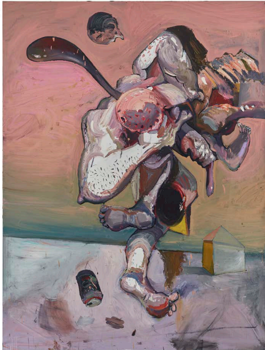
Ben Quilty The Diplomat , 2022 Oil on linen 74 1/8 x 56 1/8 in 188 x 142.5 cm

LOS ANGELES | BRUSSELS | NEW YORK | MARFA