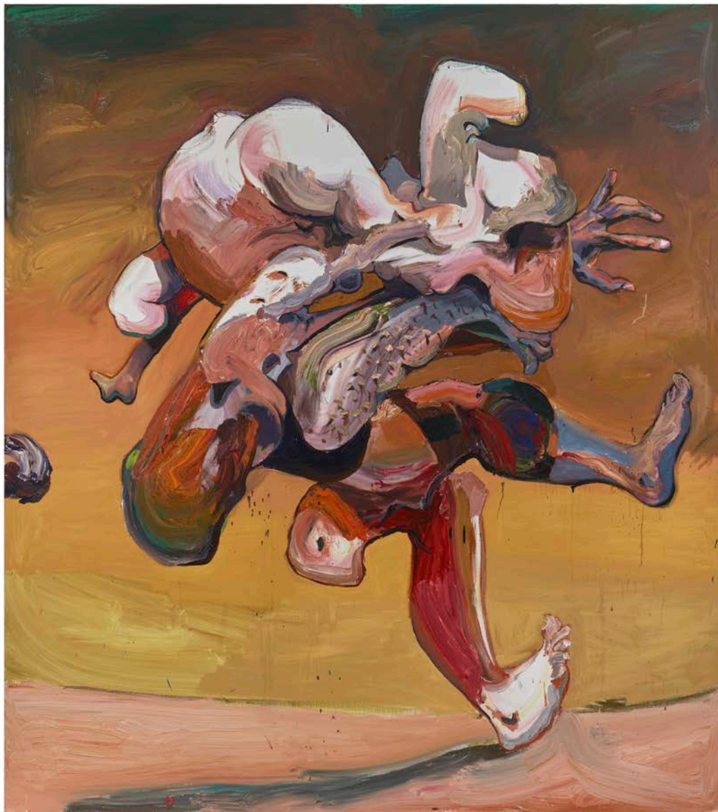
Ben Quilty The Leader , 2022 Oil on linen 79 1/2 x 70 7/8 in 202 x 180 cm

LOS ANGELES | BRUSSELS | NEW YORK | MARFA