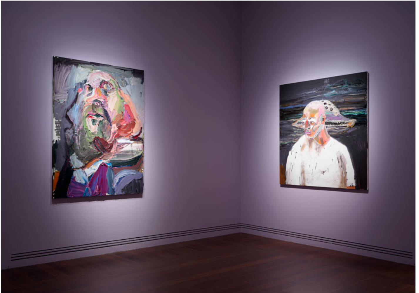
Installation view of Ben Quilty's Quilty (March 2 - June 2, 2019) Art Gallery of South Australia, Adelaide, AU

LOS ANGELES | BRUSSELS | NEW YORK | MARFA