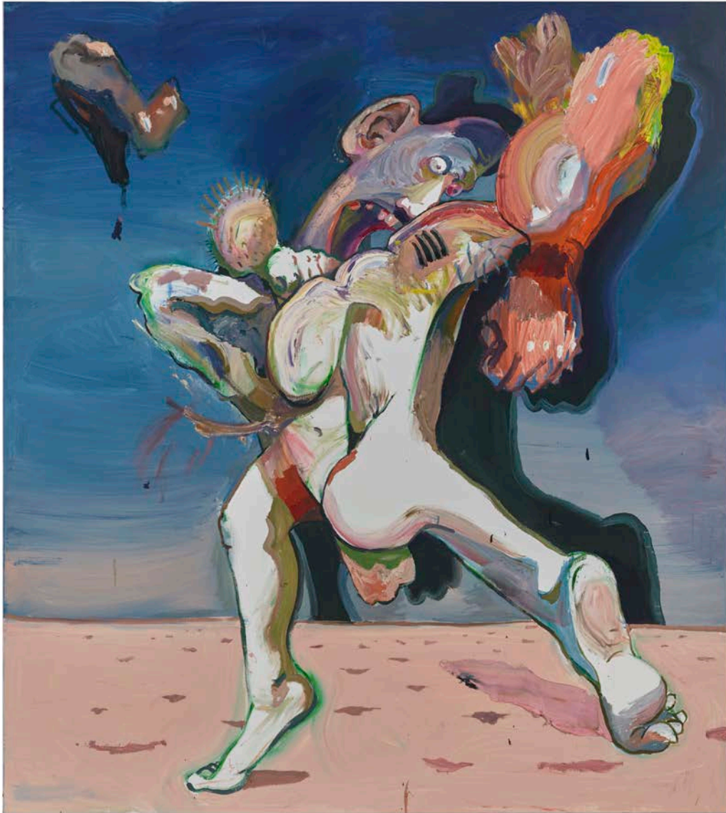
Ben Quilty The Whistle Blower , 2022 Oil on linen 79 1/2 x 70 7/8 in 202 x 180 cm

LOS ANGELES | BRUSSELS | NEW YORK | MARFA