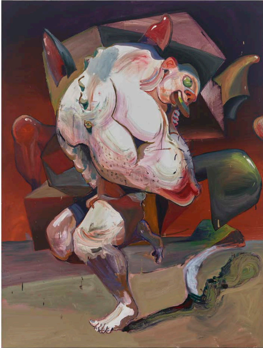
Ben Quilty The Lobbyist , 2022 Oil on linen 74 1/8 x 56 1/8 in 188 x 142.5 cm

LOS ANGELES | BRUSSELS | NEW YORK | MARFA