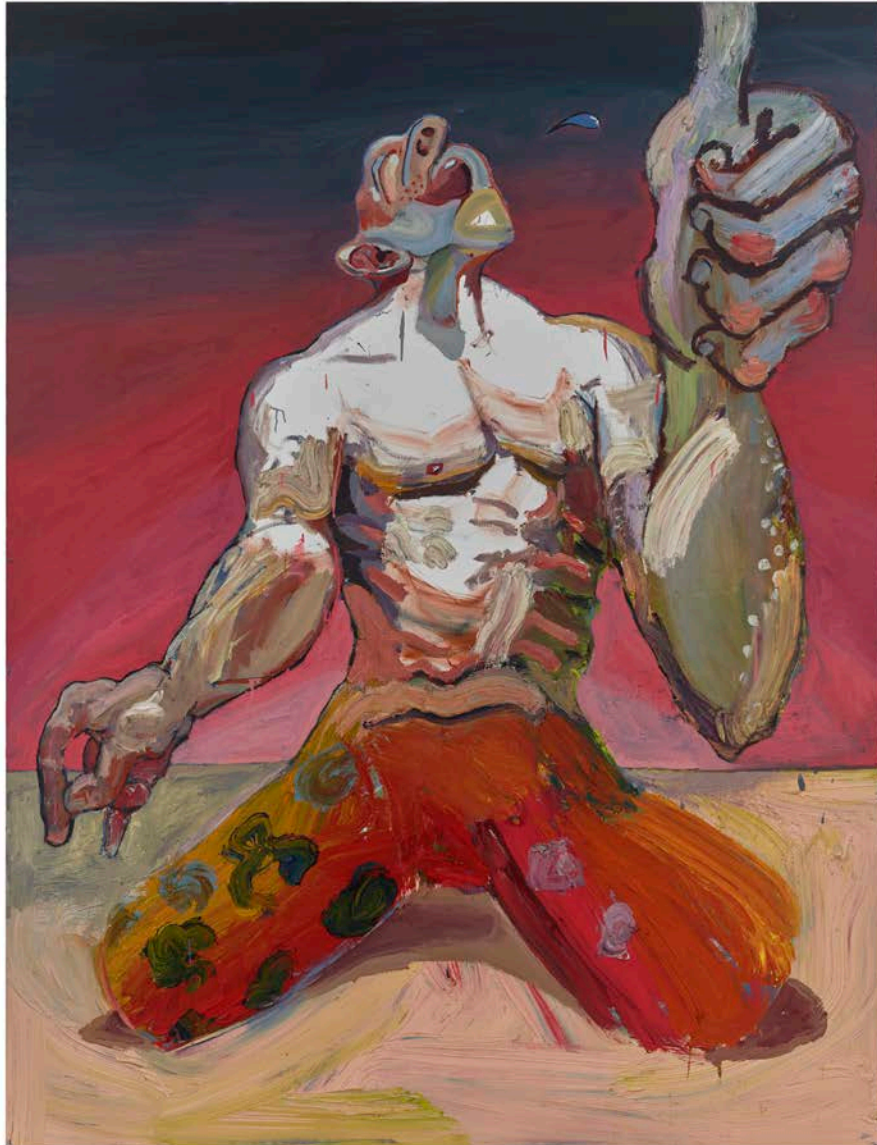
Ben Quilty The War Crime , 2022 Oil on linen 74 1/8 x 56 1/8 in 188 x 142.5 cm

LOS ANGELES | BRUSSELS | NEW YORK | MARFA