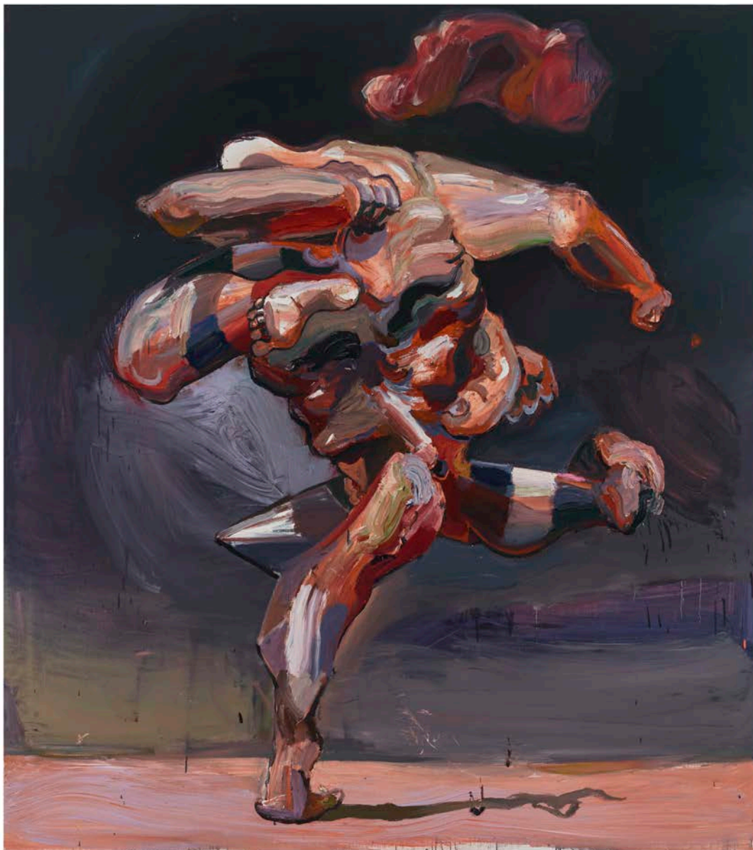
Ben Quilty The Senator , 2022 Oil on linen 79 1/2 x 70 7/8 in 202 x 180 cm

LOS ANGELES | BRUSSELS | NEW YORK | MARFA