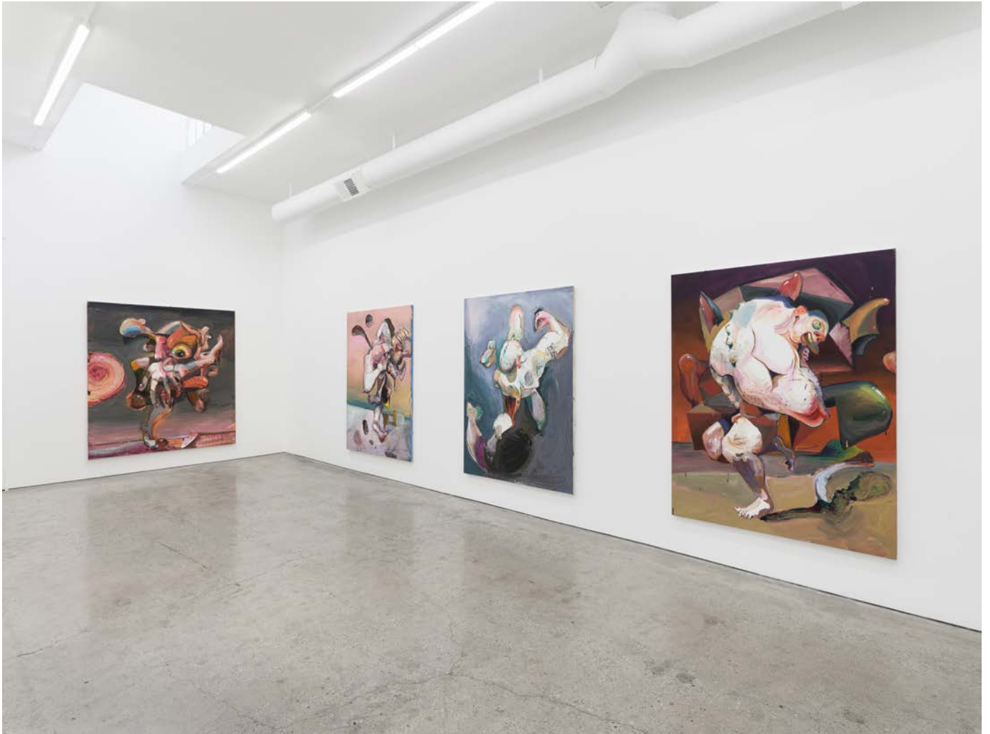
Installation view of Ben Quilty's The Debate (May 26 - June 25 2022) Nino Mier Gallery, Los Angeles, CA

LOS ANGELES | BRUSSELS | NEW YORK | MARFA