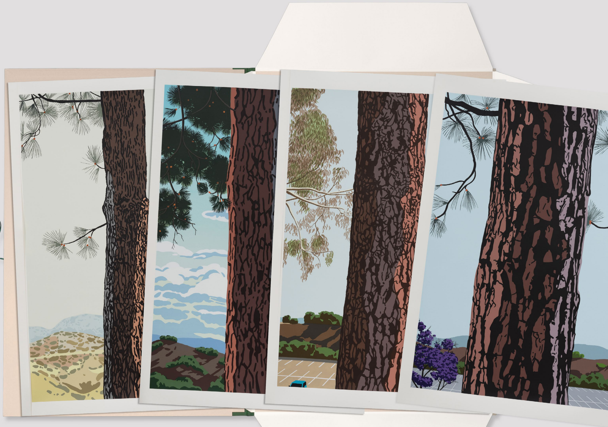
Los Angeles Pines , 2022 | Set of 4, 25 color screen prints on coventry rag paper | 45 x 31 in, 114.3 x 78.7 cm (each) Edition of 50 plus 5 APs + 5 PPs | (JLO22.054)