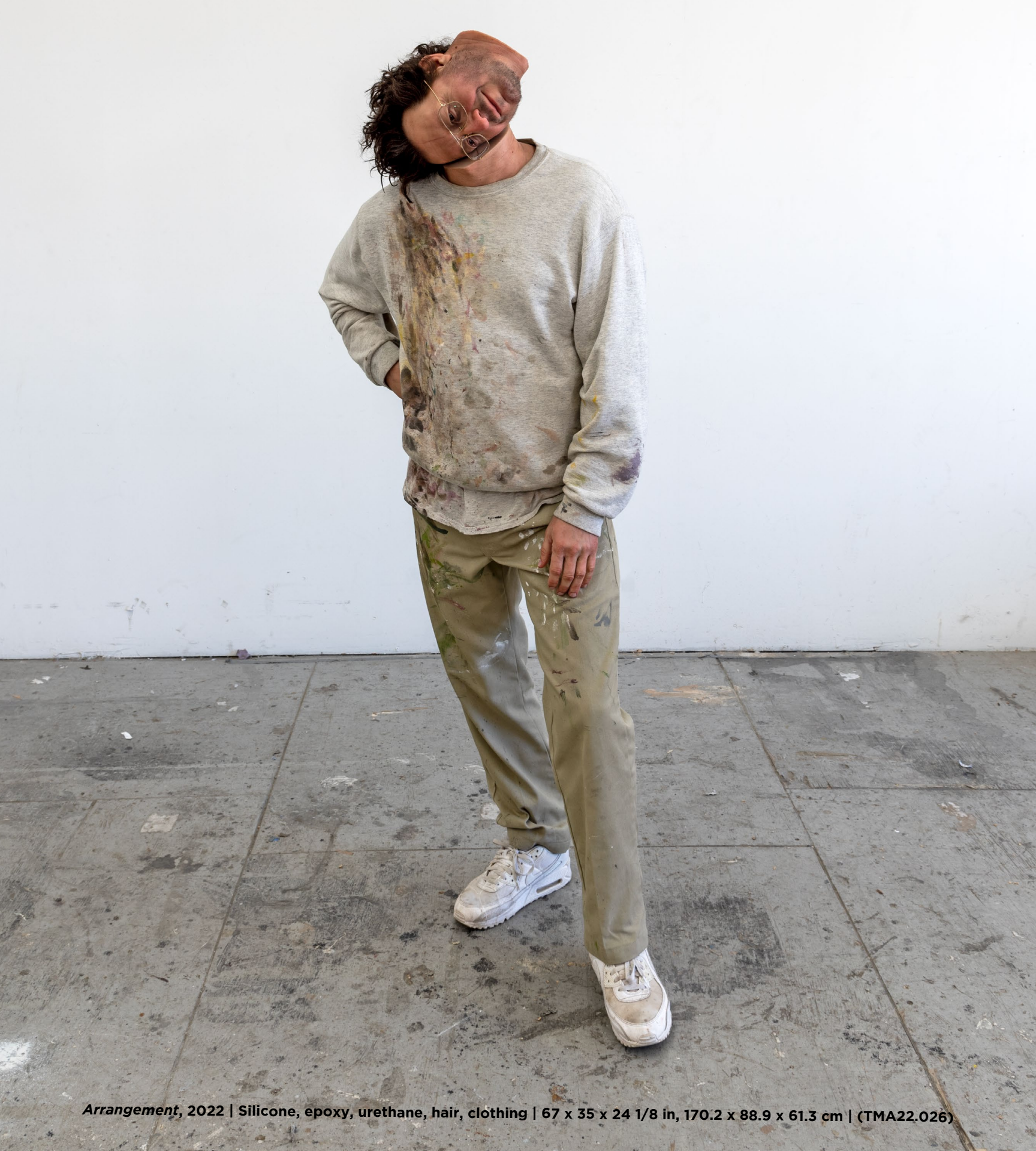
Arrangement , 2022 | Silicone, epoxy, urethane, hair, clothing | 67 x 35 x 24 1/8 in, 170.2 x 88.9 x 61.3 cm | (TMA22.026)