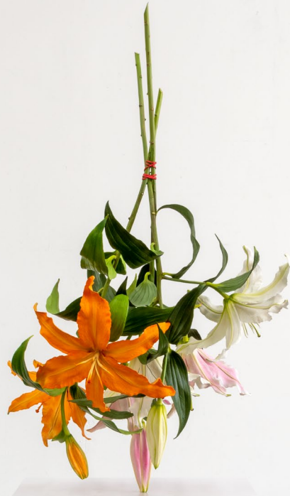
Arrangement , 2022 | Painted bronze, stainless steel | 31 x 20 x 19 in, 78.7 x 50.8 x 48.3 cm | (TMA22.019)