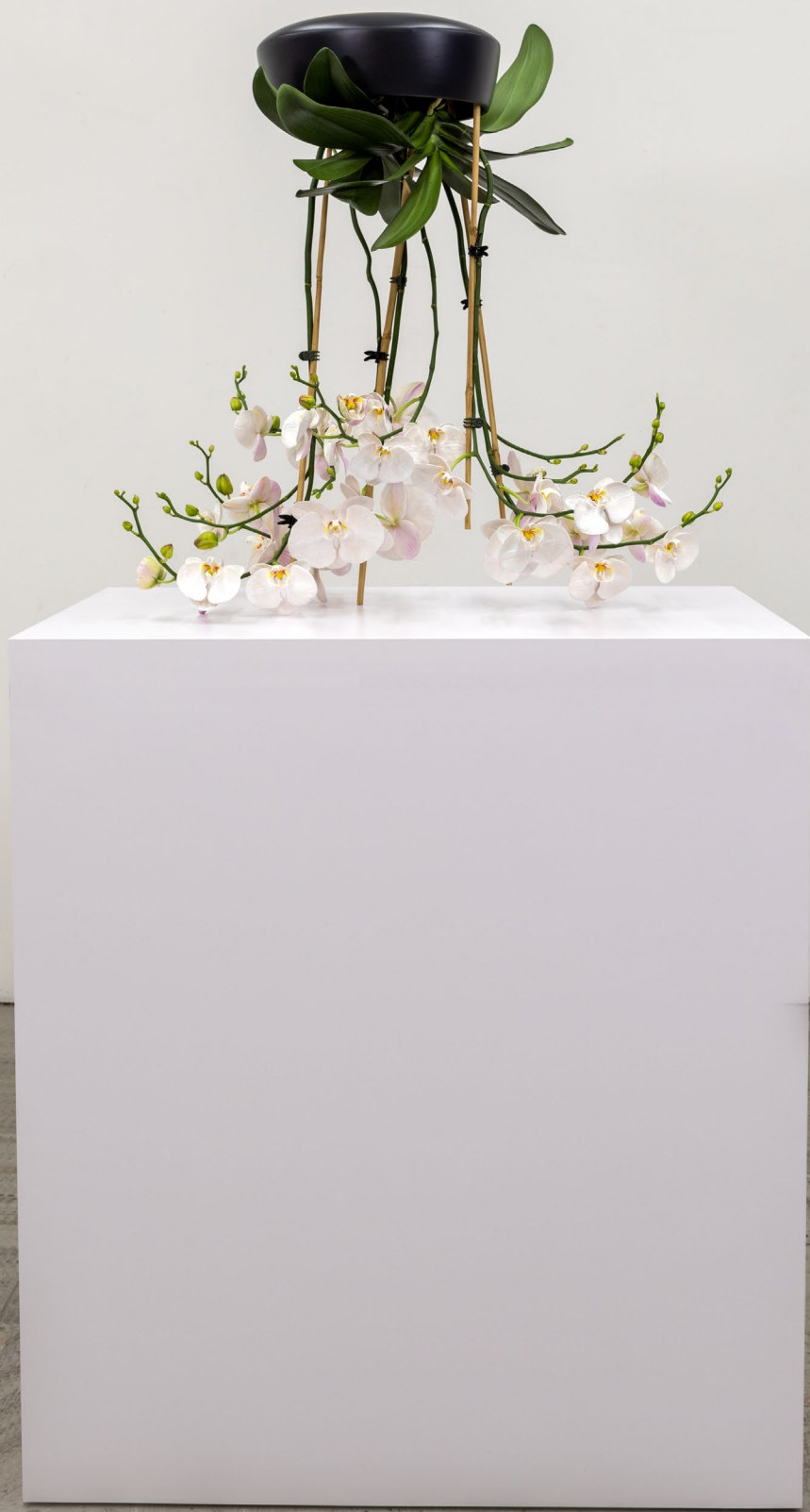
Arrangement , 2022 | Painted bronze, stainless steel, aluminum, epoxy | 34 x 28 x 34 in, 86.4 x 71.1 x 86.4 cm | (TMA22.024)