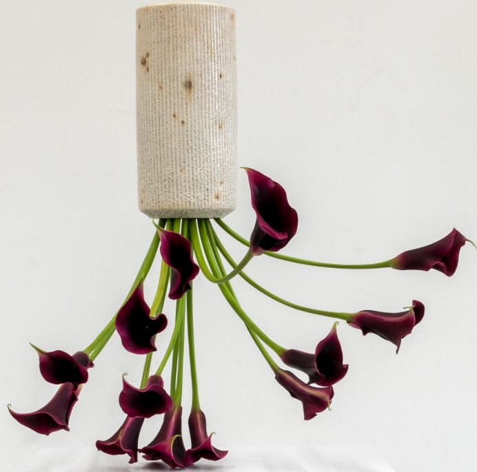
Arrangement , 2022 | Painted bronze, stainless steel, epoxy | 27 x 27 x 19 in, 68.6 x 68.6 x 48.3 cm | (TMA22.022)