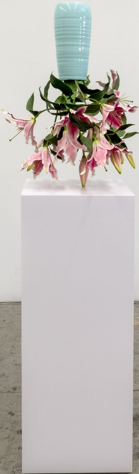
Arrangement , 2022 | Painted bronze, stainless steel, epoxy, fiberglass | 29 x 22 x 22 in, 73.7 x 55.9 x 55.9 cm | (TMA22.023)