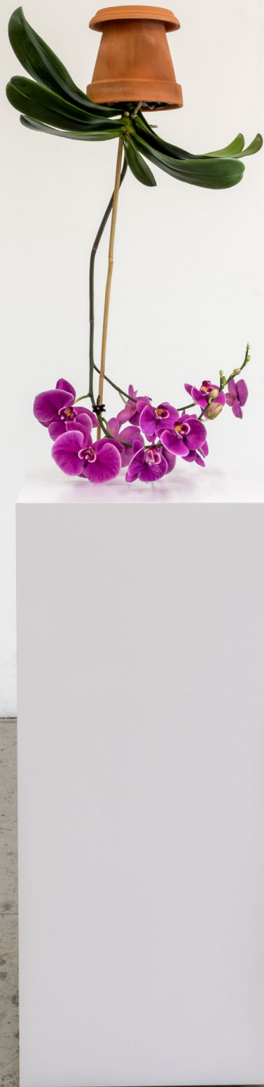
Arrangement , 2022 | Painted bronze, stainless steel, aluminum, epoxy | 33 x 18 x 20 in, 83.8 x 45.7 x 50.8 cm | (TMA22.020)