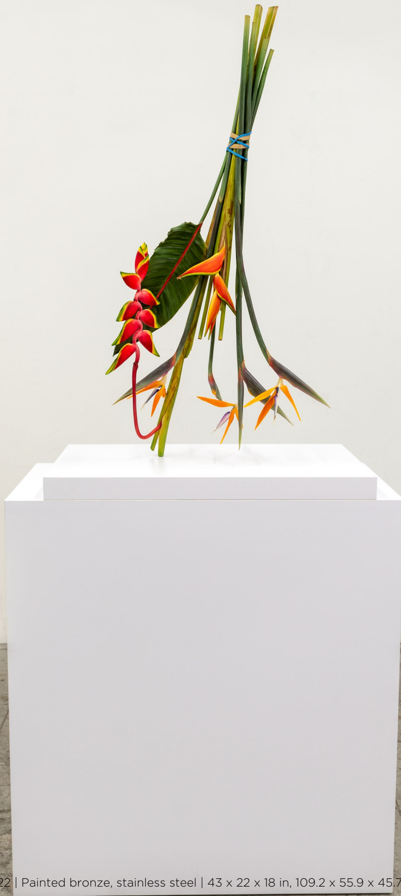
Arrangement , 2022 | Painted bronze, stainless steel | 43 x 22 x 18 in, 109.2 x 55.9 x 45.7 cm | (TMA22.025)