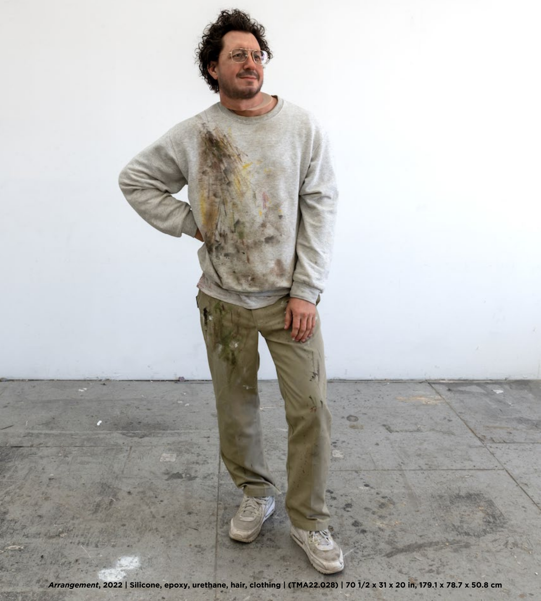
Arrangement , 2022 | Silicone, epoxy, urethane, hair, clothing | (TMA22.028) | 70 1/2 x 31 x 20 in, 179.1 x 78.7 x 50.8 cm