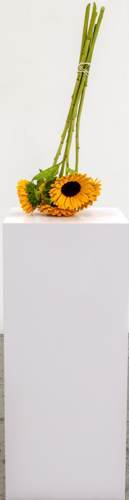
Arrangement , 2022 | Painted bronze, stainless steel | 28 x 12 x 13 in, 71.1 x 30.5 x 33 cm | (TMA22.017)