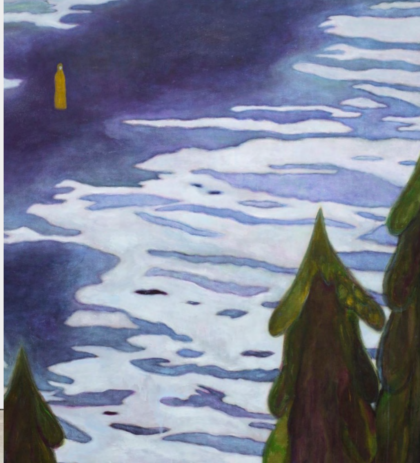
Frozen , 2022 | Oil on linen | 84 x 72 in, 213.4 x 182.9 cm | (KSO22.002)