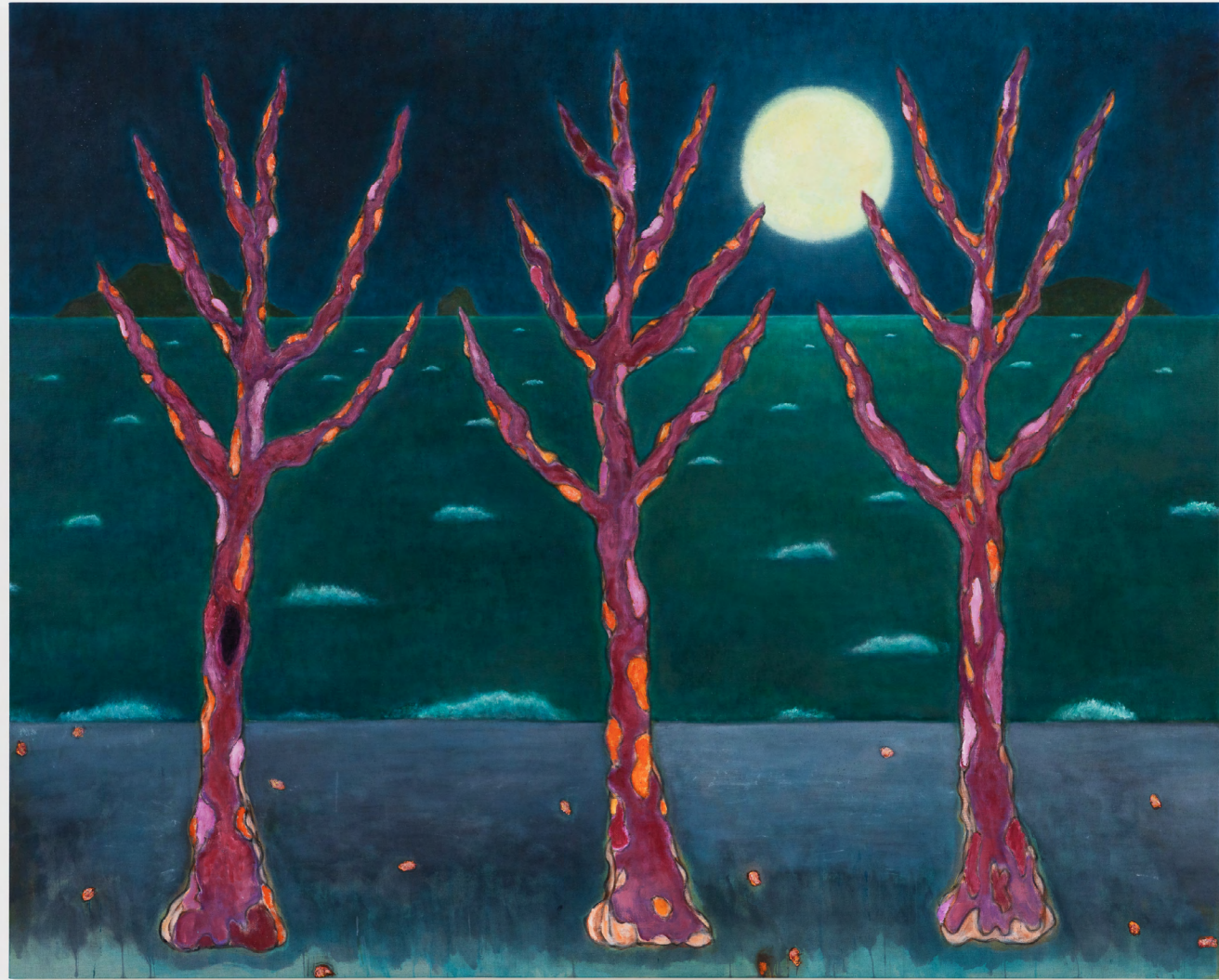
Red Trees , 2022 | Oil on linen | 72 7/8 x 90 1/2 in, 185 x 230 cm | (KSO22.012)