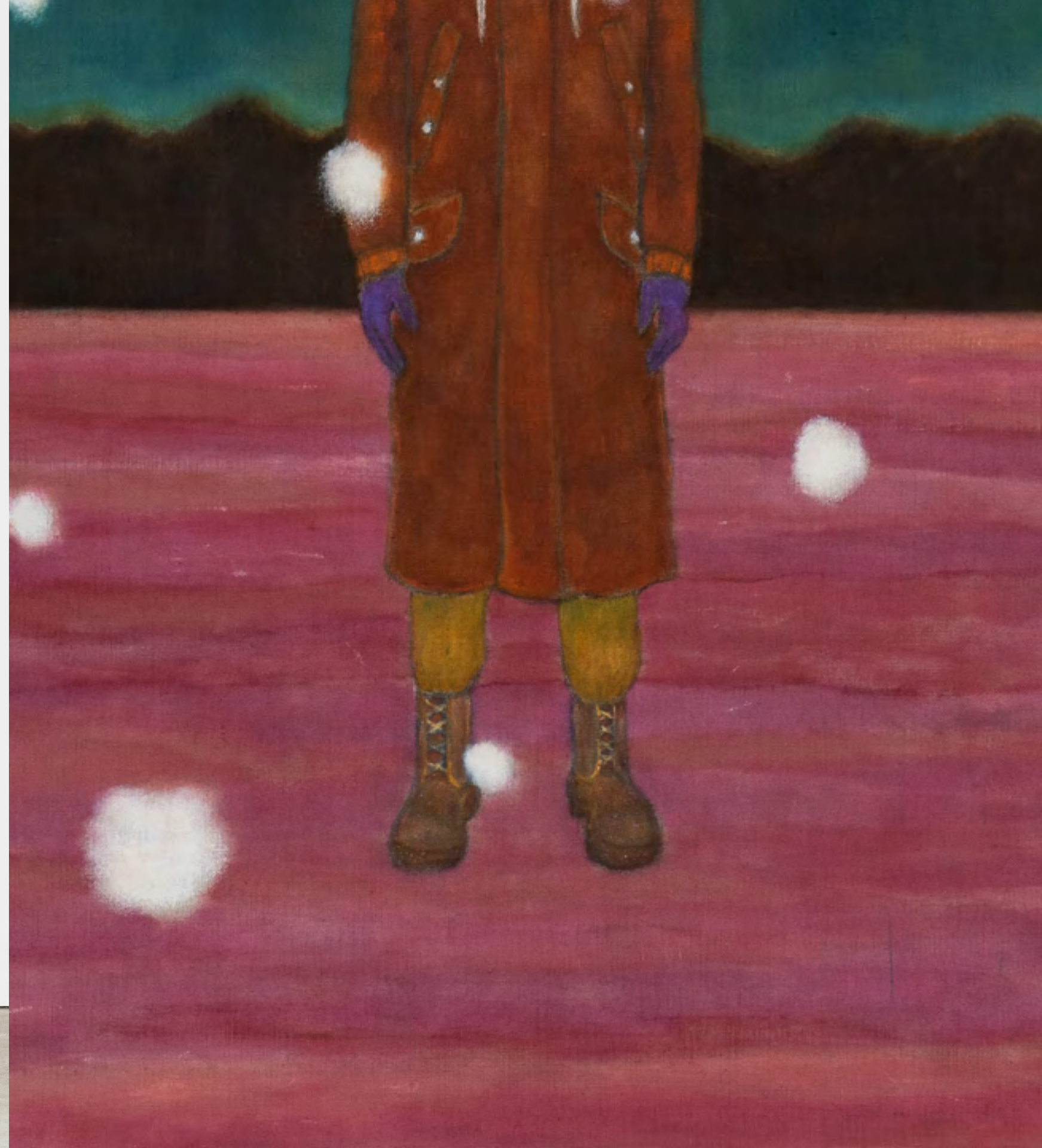
Snow, 2022-2023 | Oil on linen | 76 3/8 x 64 5/8 in, 194 x 164 cm | (KSO22.017)