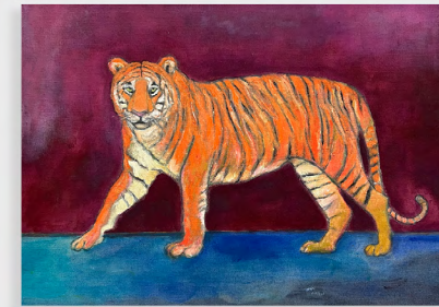
Small Tiger (study) , 2022 | Oil on linen | 19 3/4 x 27 1/2 in, 50 x 70 cm | (KSO23.001)