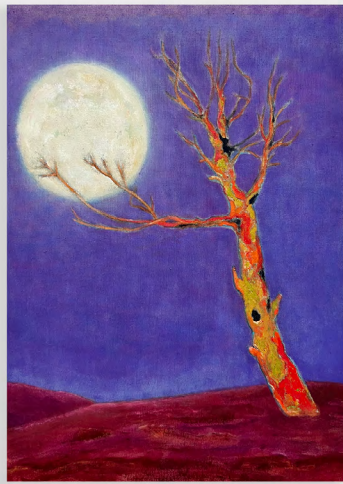
Small Moon (study) , 2022 | Oil on linen | 27 1/2 x 19 3/4 in, 70 x 50 cm | (KSO23.002)