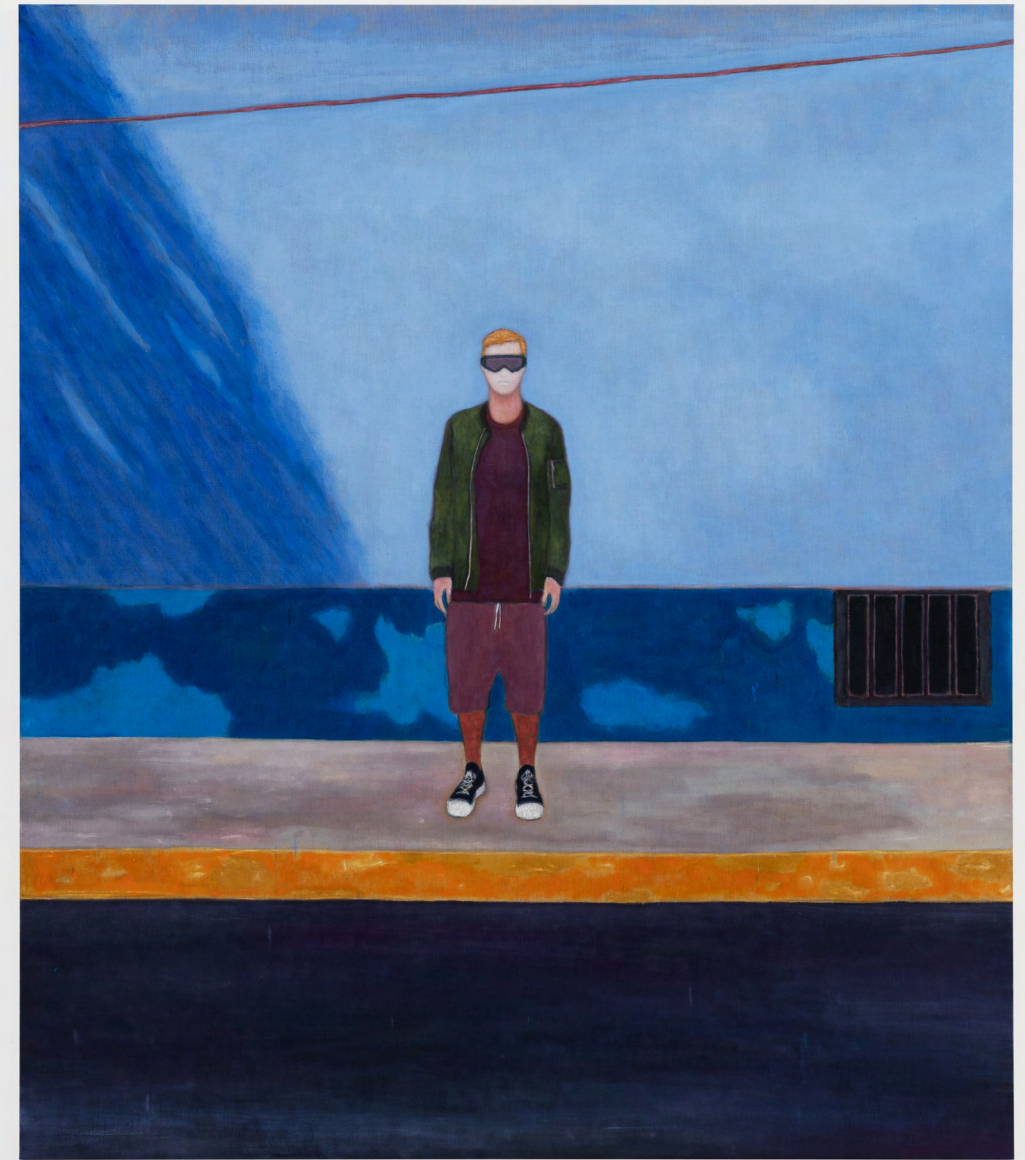
My Rules , 2022 | Oil on linen | 84 x 72 in, 213.4 x 182.9 cm | (KSO22.016)