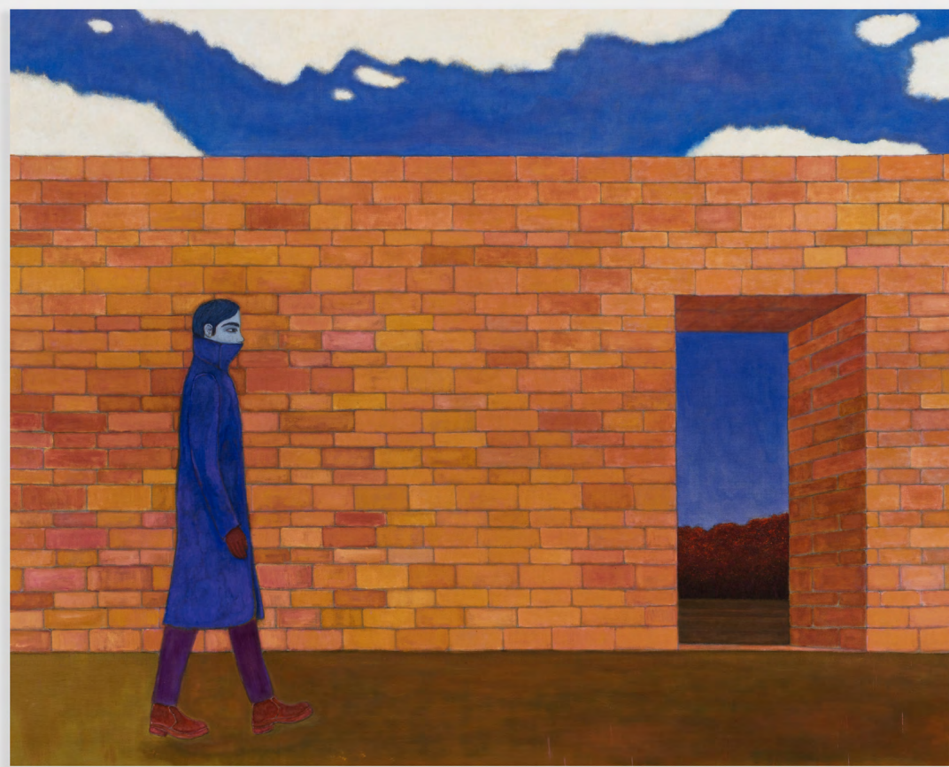
The Wall , 2022 | Oil on linen | 72 7/8 x 90 1/2 in, 185 x 230 cm | (KSO22.013)