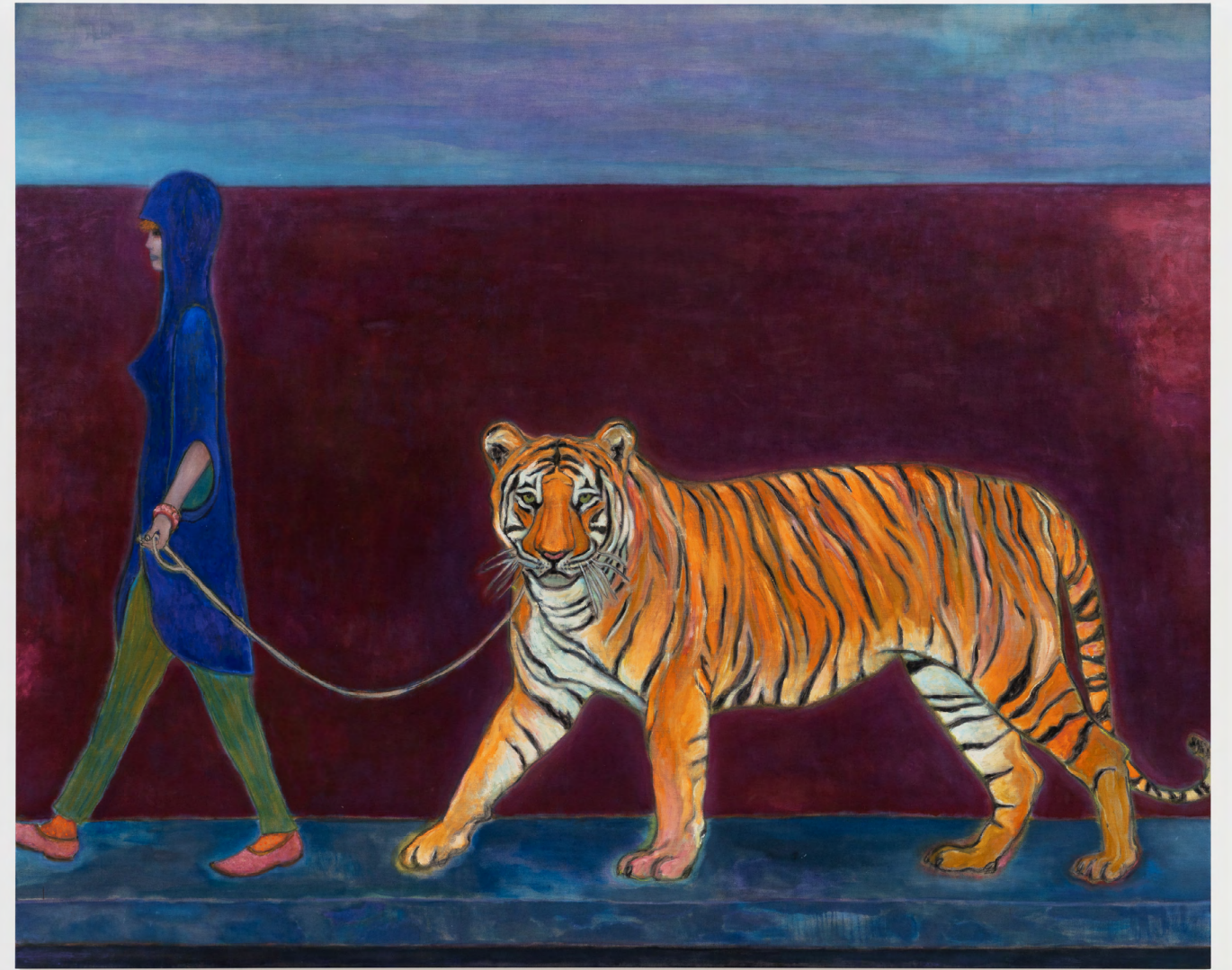
Animal , 2022 | Oil on linen | 72 7/8 x 90 1/2 in, 185 x 230 cm | (KSO22.014)