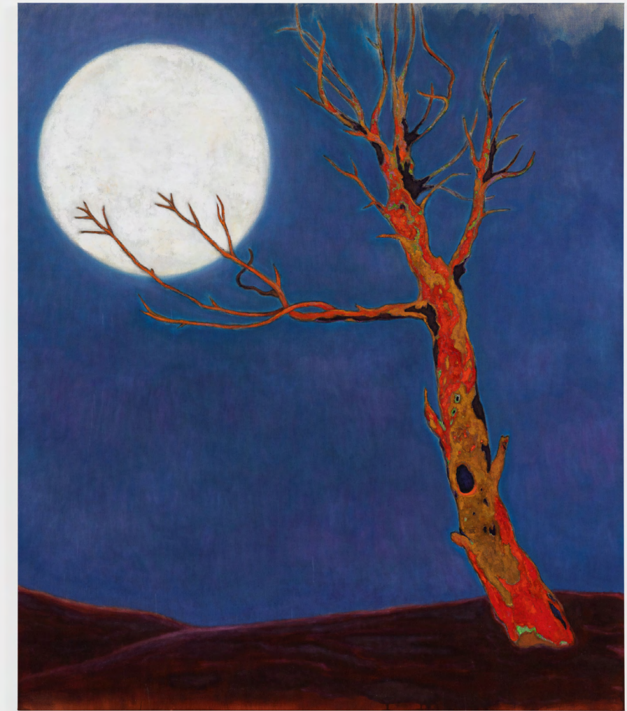
Full Moon , 2022 | Oil on linen | 84 x 72 in, 213.4 x 182.9 cm | (KSO22.015)