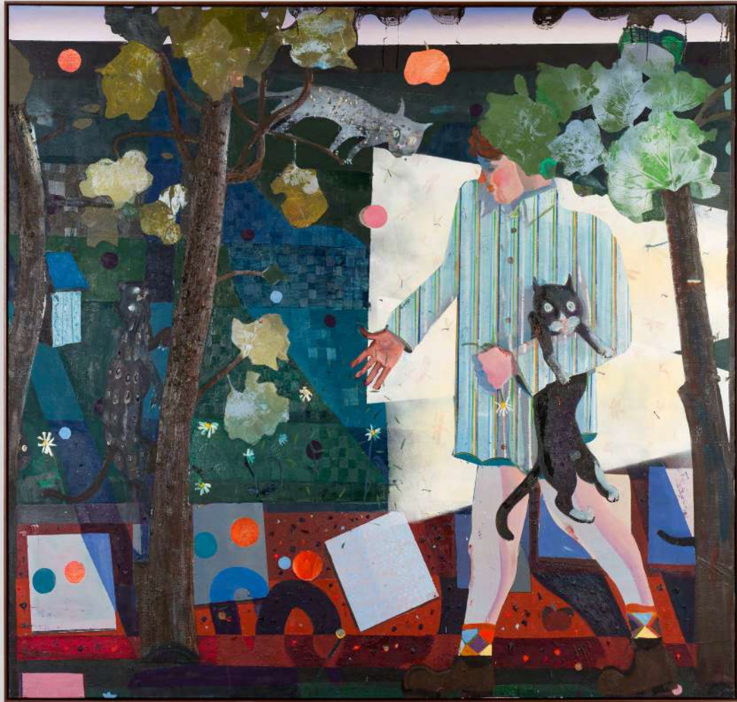
things behind the sun , 2022 | Oil and mirrors on canvas | 74 3/4 x 78 3/4 in, 190 x 200 cm | (PJE23.008)