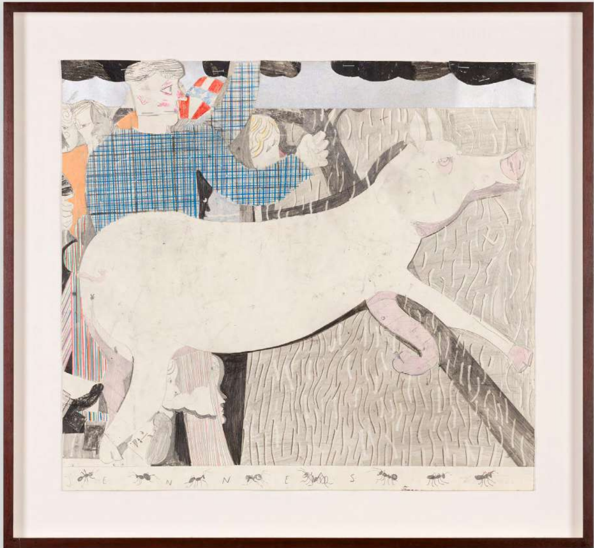
An apple can't be tired (H) , 2022 | Mixed media on paper | 18 1/8 x 19 3/4 in, 46 x 50 cm | (PJE23.013)