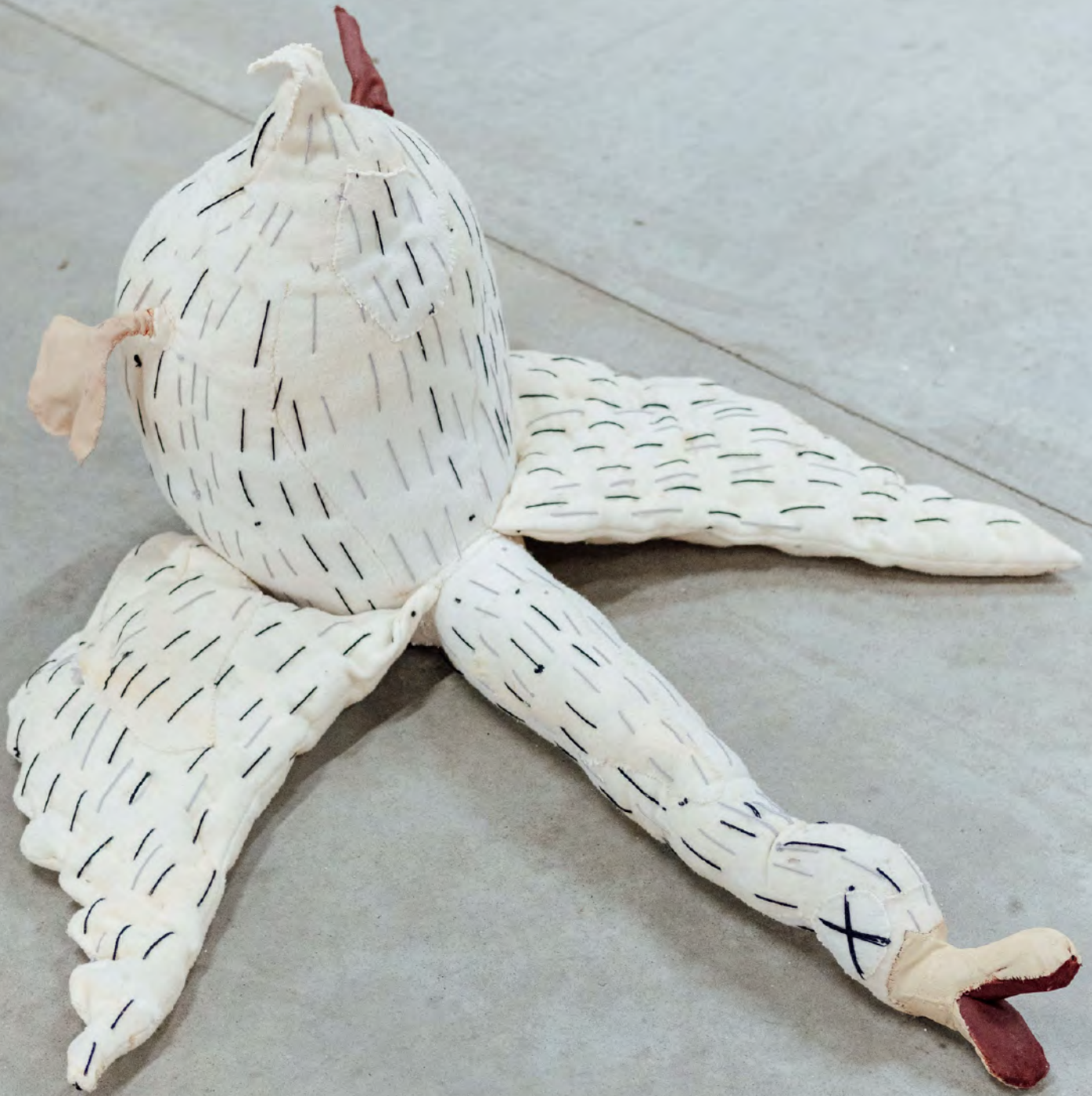
Installation view of An apple can't be tired , 2022