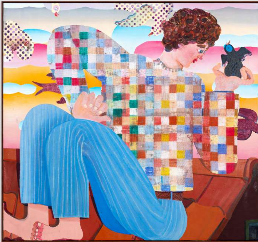
Een ouder wordende man kruipt het dak niet op, 2023 | Oil on canvas | 55 1/8 x 59 in, 140 x 150 cm | (PJE23.030)