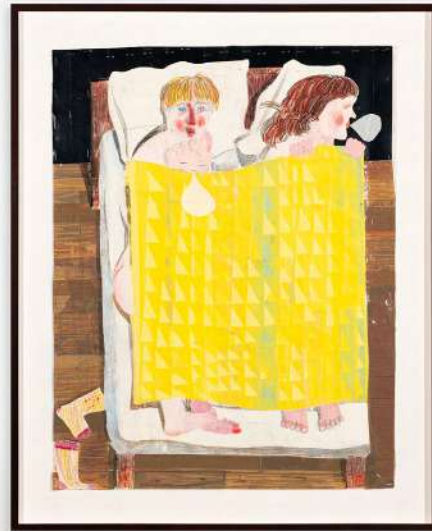
An apple can't be tired (L) , 2023 | Mixed media on paper | 26 3/8 x 20 1/2 in, 67 x 52 cm | (PJE23.033)