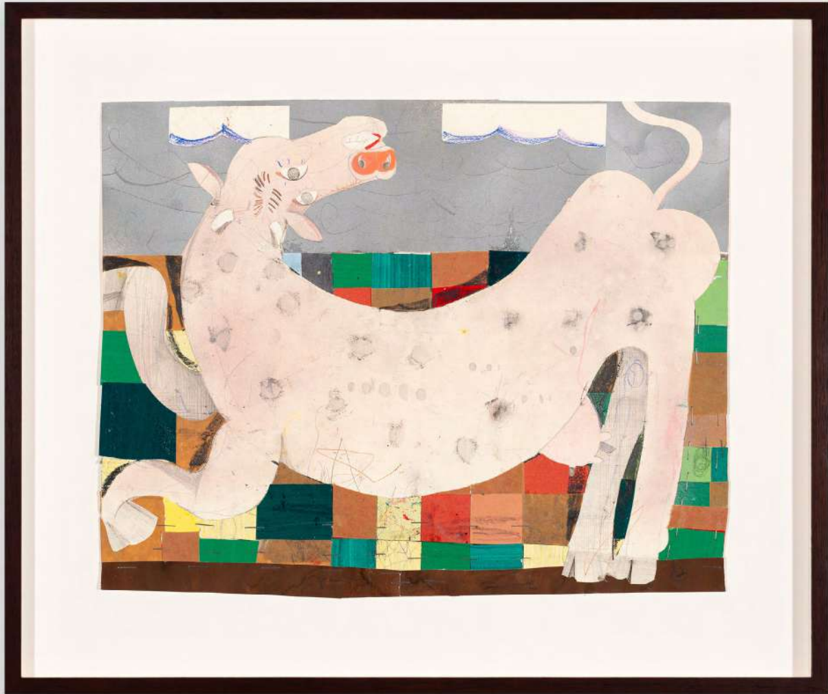
An apple can't be tired (K) , 2023 | Mixed media on paper | 12 5/8 x 16 1/8 in, 32 x 41 cm | (PJE23.032)