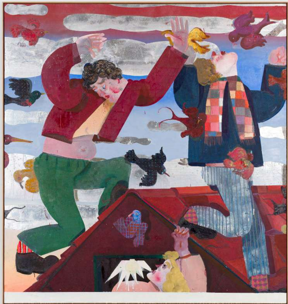
What are you doing now? , 2022 | Oil and collage on canvas | 70 7/8 x 66 7/8 in, 180 x 170 cm | (PJE23.003)