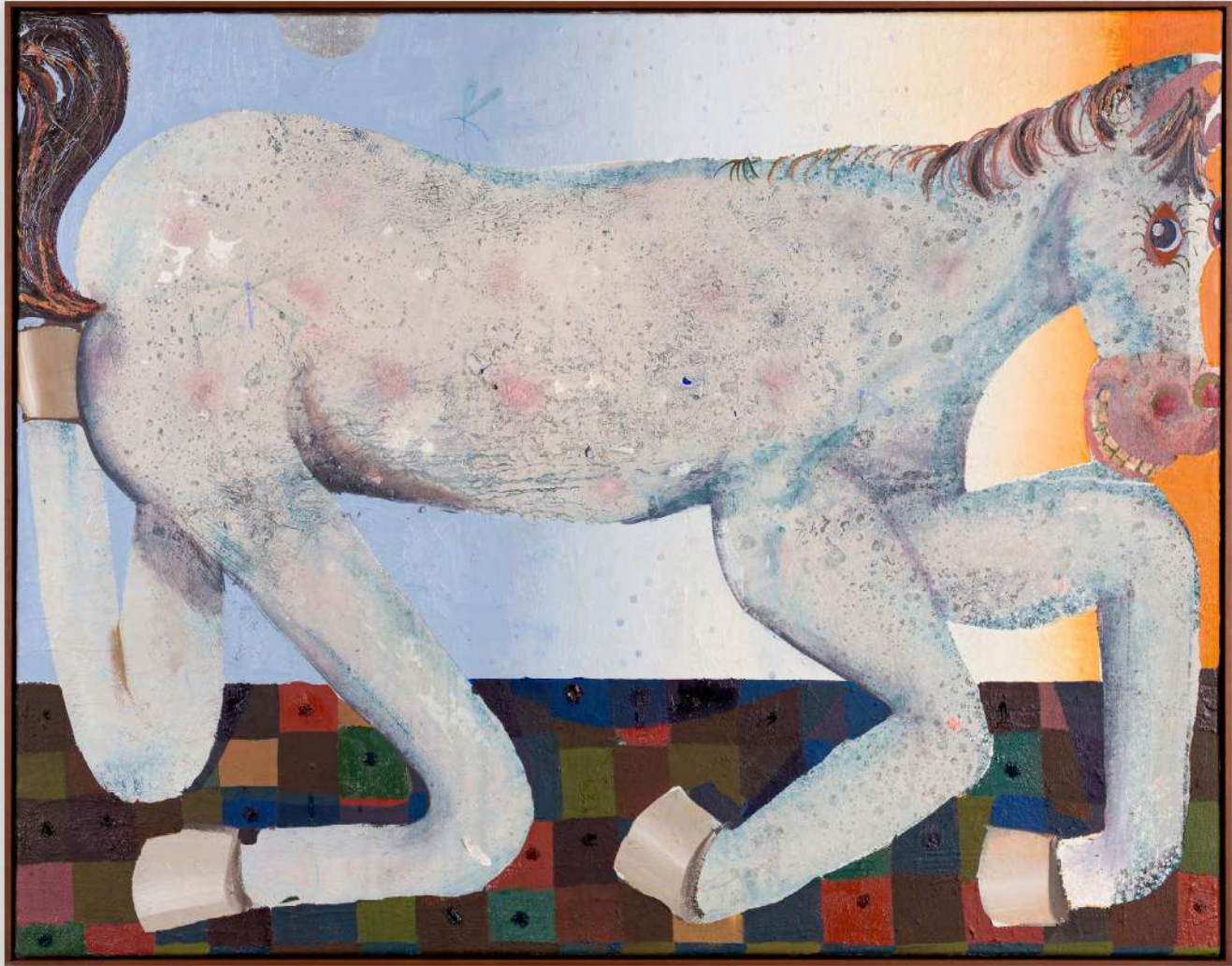
Bybeck Nightingale , 2022 | Oil and collage on canvas | 35 3/8 x 45 1/4 in, 90 x 115 cm | (PJE23.035)