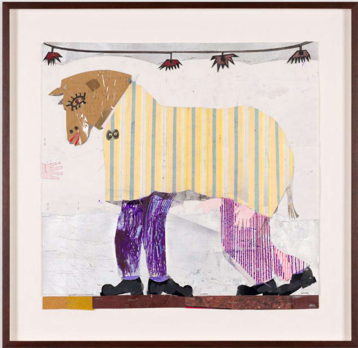
An apple can't be tired (F) , 2022 | Mixed media on paper | 16 7/8 x 17 3/4 in, 43 x 45 cm | (PJE23.016)