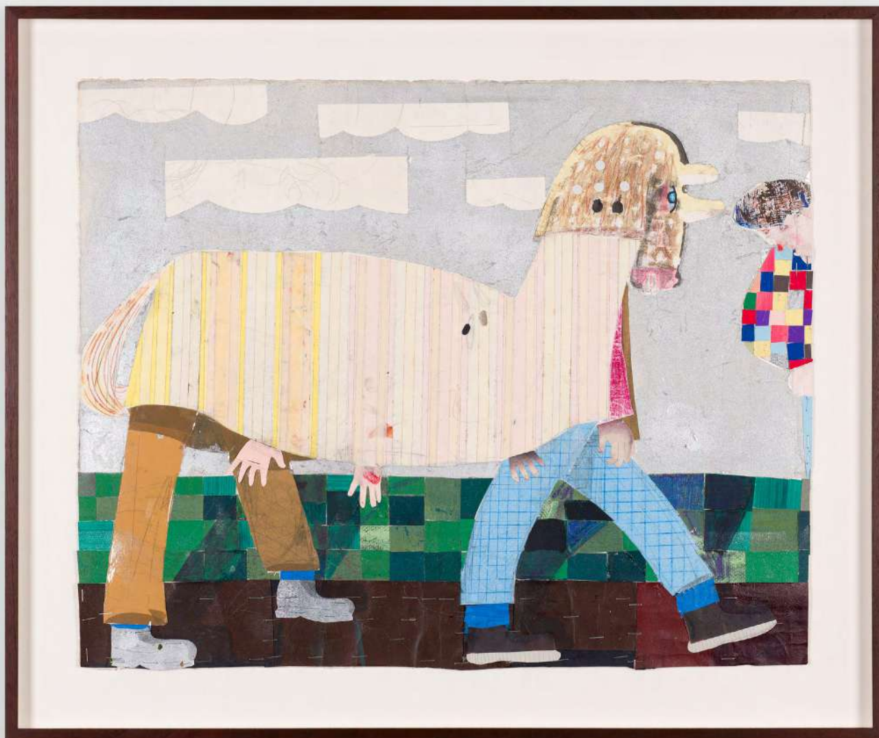
An apple can't be tired (A) , 2022 | Mixed media on paper | 19 3/4 x 23 5/8 in, 50 x 60 cm | (PJE23.015)