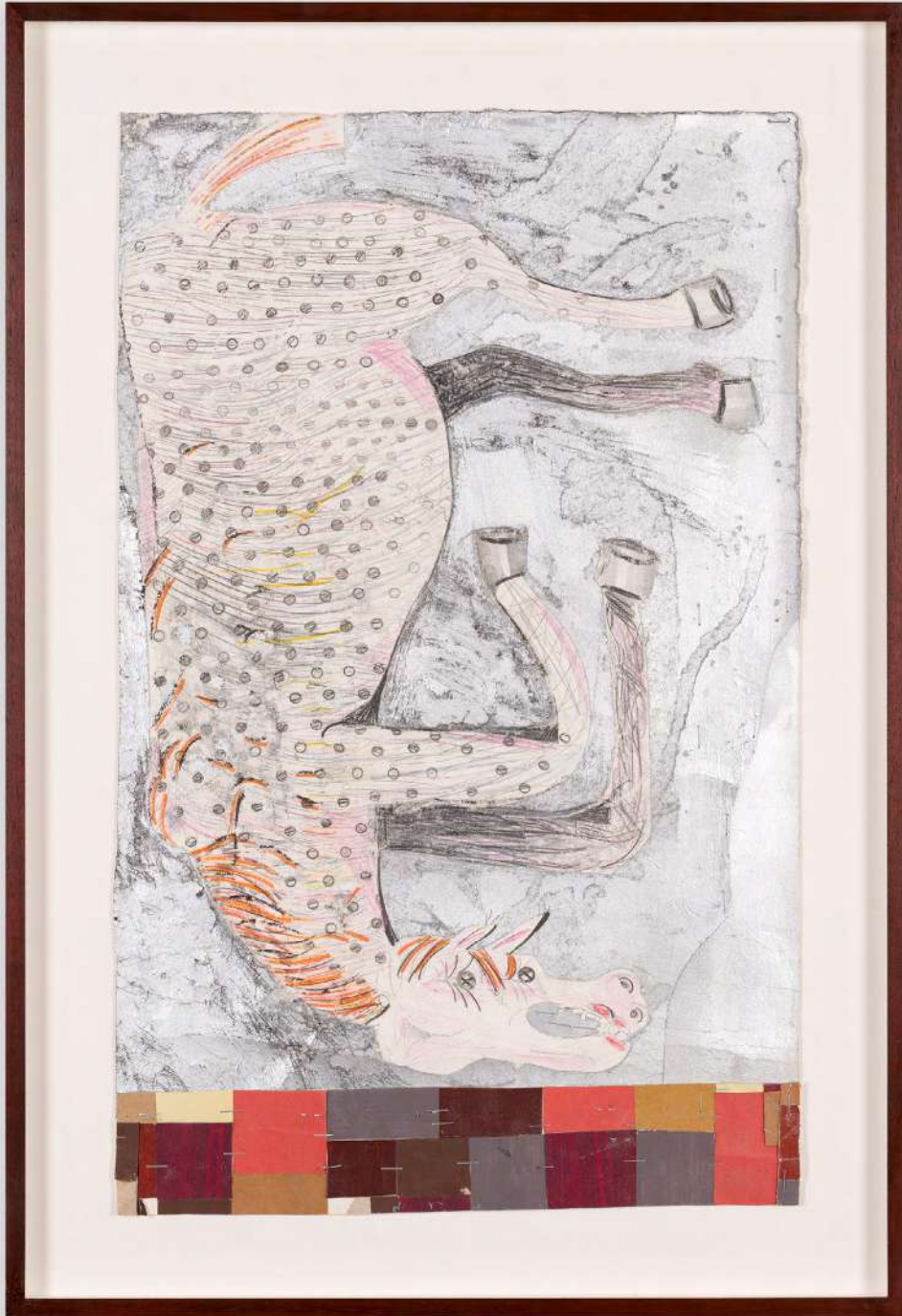
An apple can't be tired (E) , 2022 | Mixed media on paper | 25 1/4 x 15 3/4 in, 64 x 40 cm | (PJE23.011)