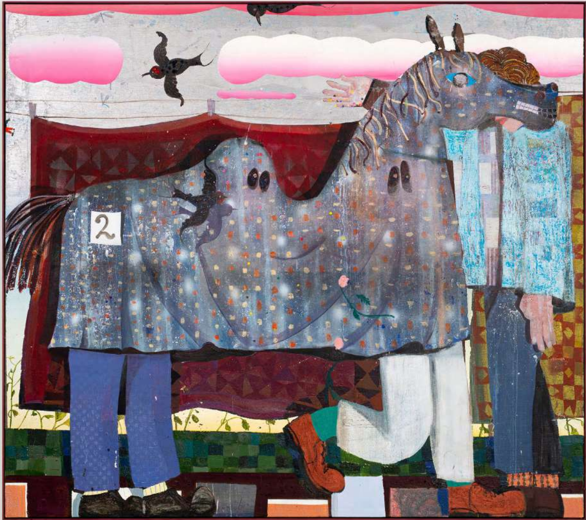
I'd be happy to, 2023 | Oil on canvas | 66 7/8 x 74 3/4 in, 170 x 190 cm | (PJE23.017)