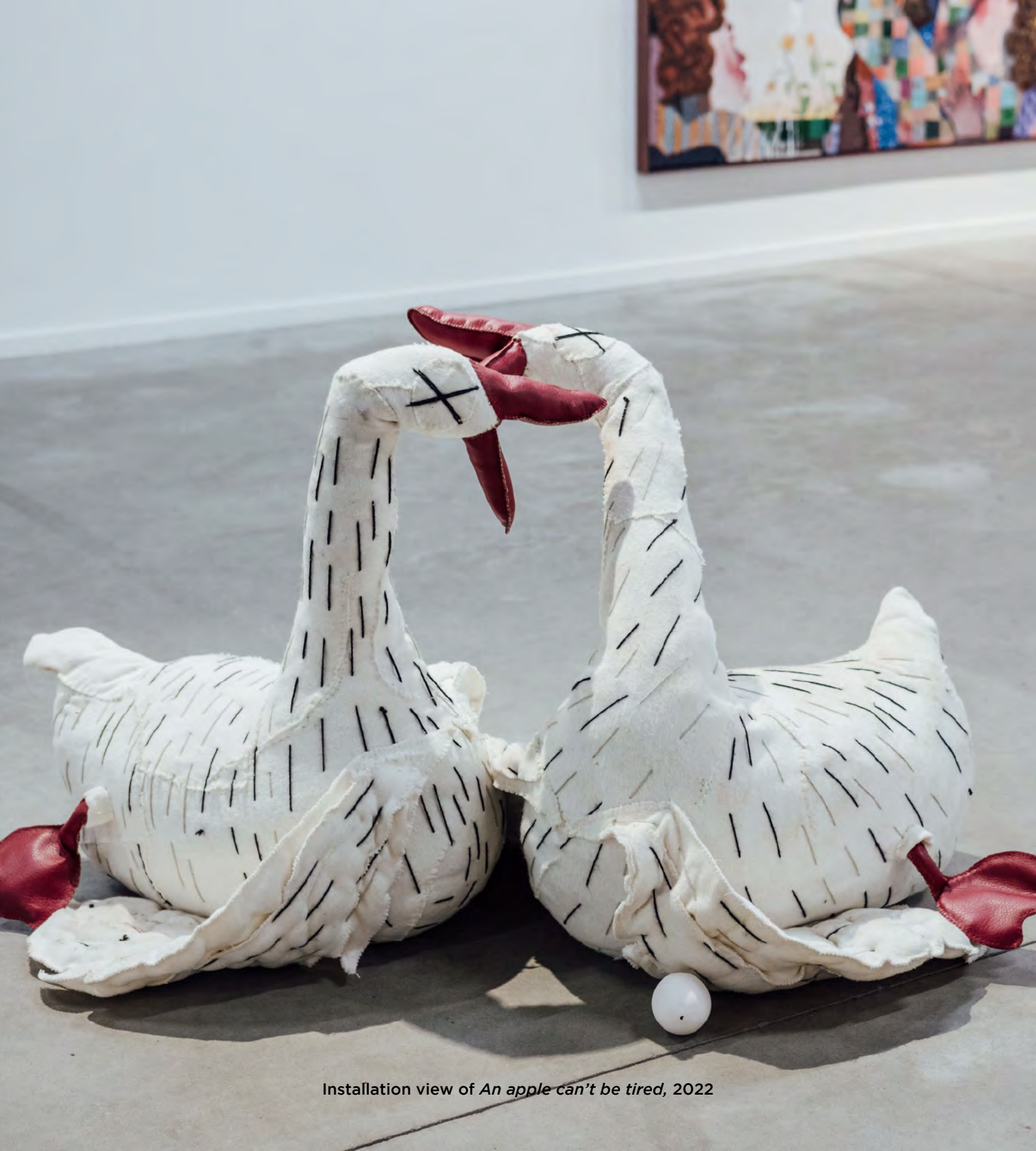
Installation view of An apple can't be tired , 2022