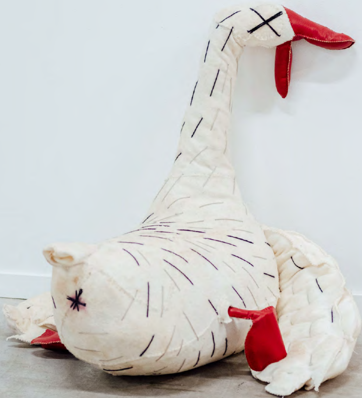
Installation view of An apple can't be tired , 2022