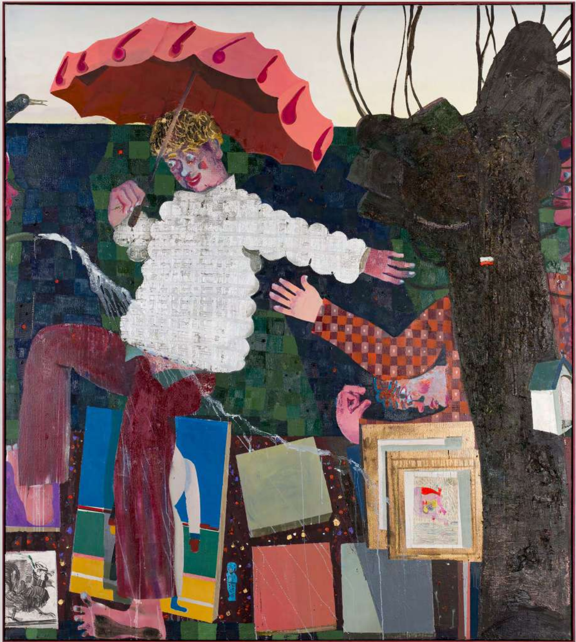
world & image , 2022 | Oil and mirrors on canvas | 74 3/4 x 66 7/8 in, 190 x 170 cm | (PJE23.007)