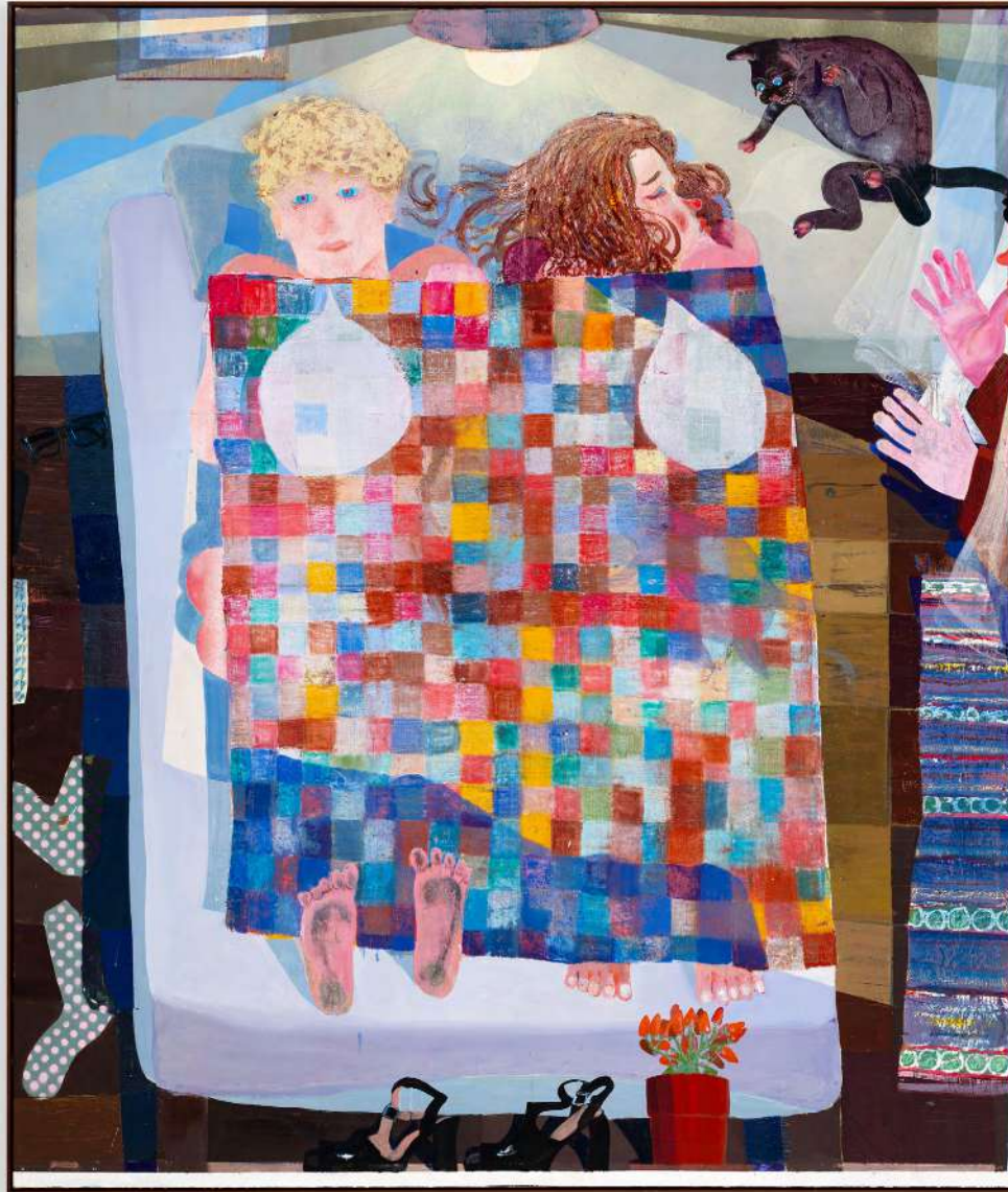
Nooit meer slapen , 2023 | Oil on canvas | 78 3/4 x 66 7/8 in, 200 x 170 cm | (PJE23.021)