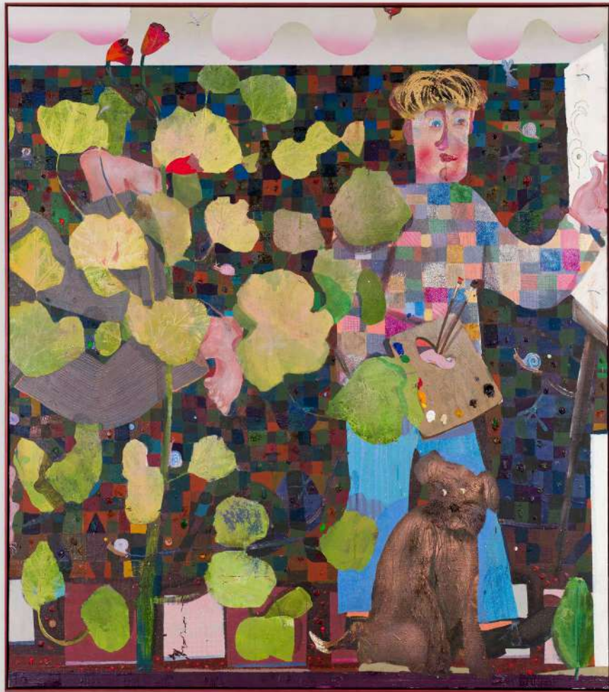
Everybody's got one, 2023 | Oil on canvas | 66 7/8 x 59 in, 170 x 150 cm | (PJE23.024)