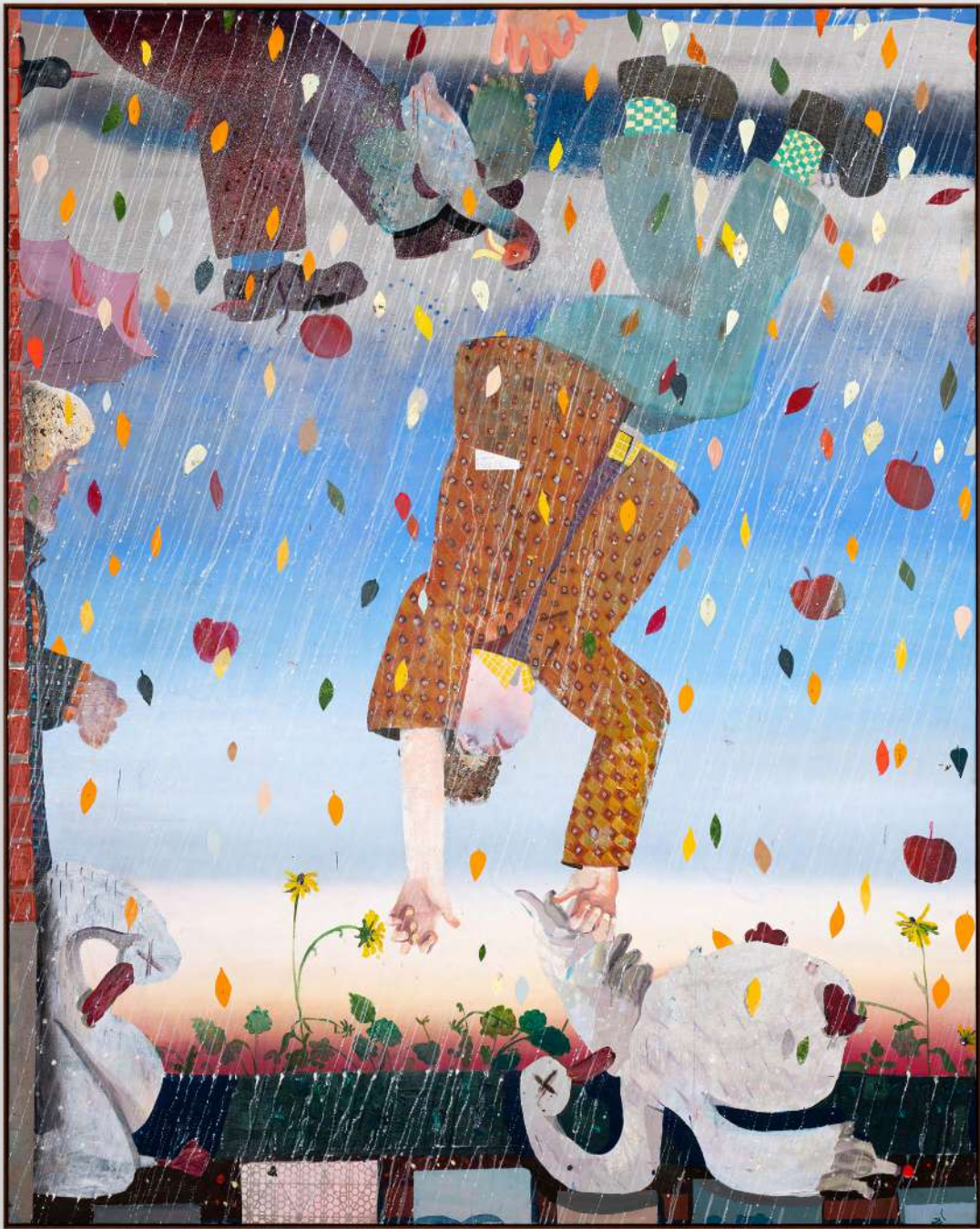
An apple can't be tired , 2022 | Oil on canvas | 98 3/8 x 78 3/4 in, 250 x 200 cm | (PJE23.009)