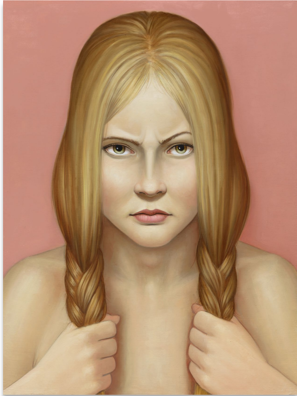
Angry blonde | 2023 | Mixed media on MDF | 31 1/2 x 23 5/8 in, 80 x 60 cm | (FGE23.010)