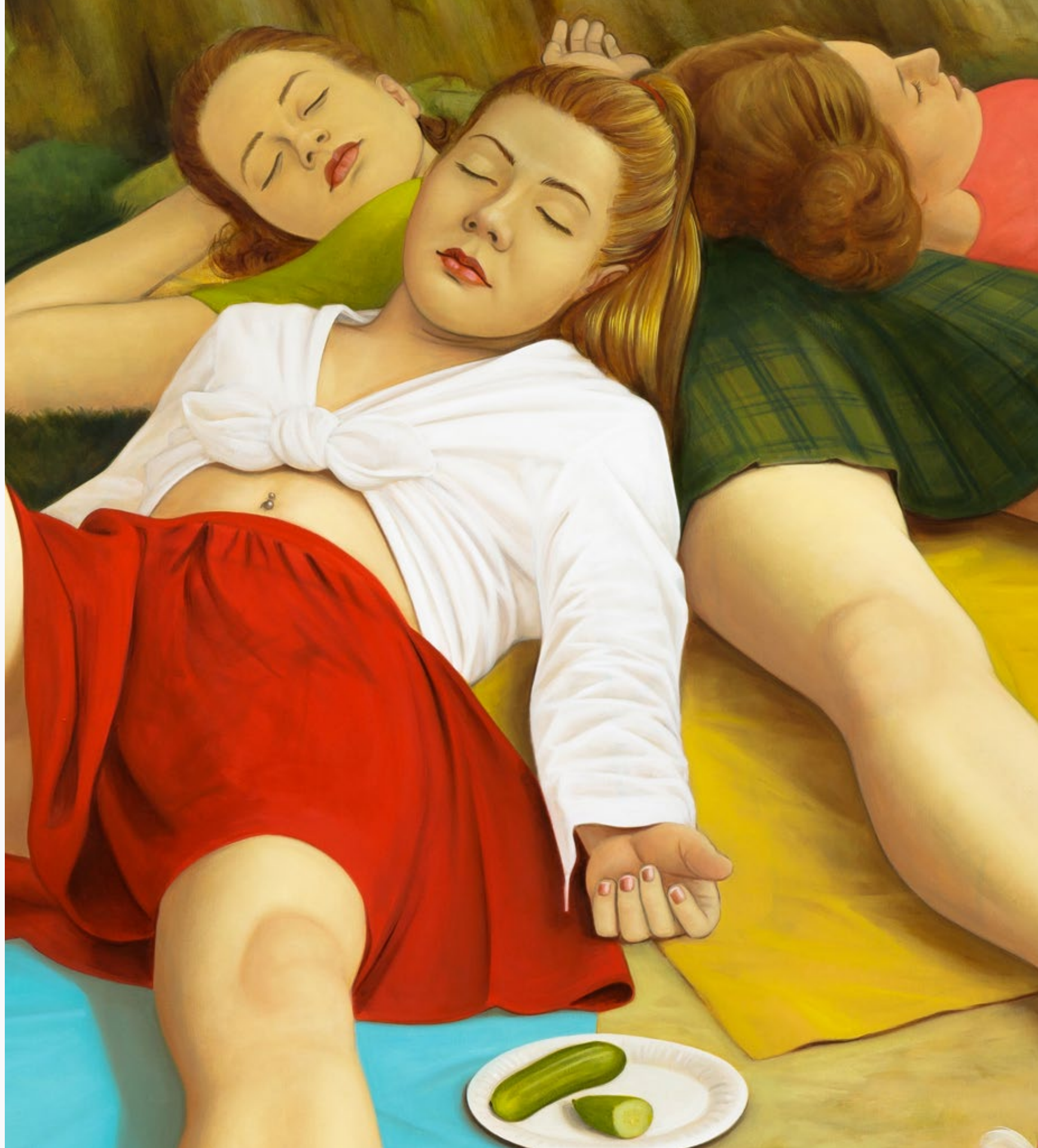
Le pique-nique | 2023 | Acrylic and oil on canvas | 78 3/4 x 98 3/8 in, 200 x 250 cm | (FGE23.006)