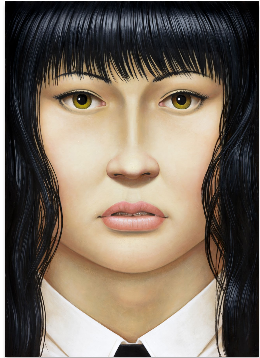
Portrait of a Young Woman | 2023 | Mixed media on MDF | 27 1/2 x 19 3/4 in, 70 x 50 cm | (FGE23.015)