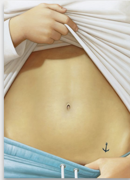
Anchor | 2023 | Mixed media on MDF | 27 1/2 x 19 3/4 in, 70 x 50 cm | (FGE23.014)