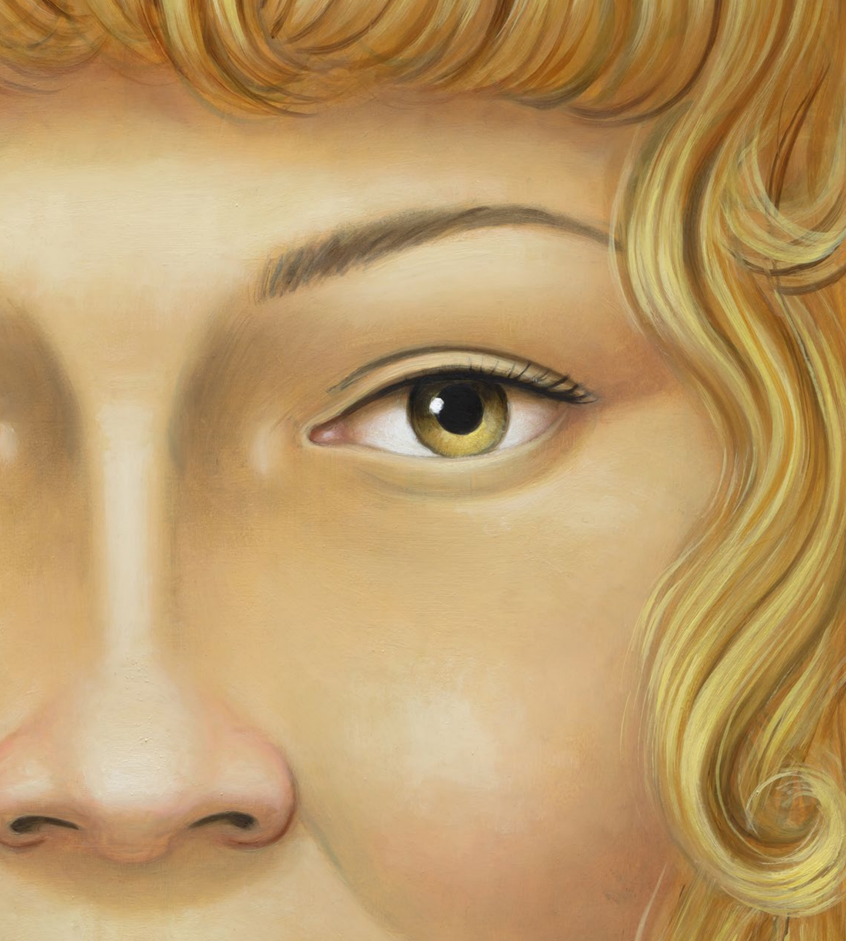
LEFT: That Smile | 2023 | Mixed media on MDF | 19 3/4 x 15 3/4 in, 50 x 40 cm | (FGE23.020) RIGHT: Unveiling | 2023 | Mixed media on MDF | 19 3/4 x 15 3/4 in, 50 x 40 cm | (FGE23.018)