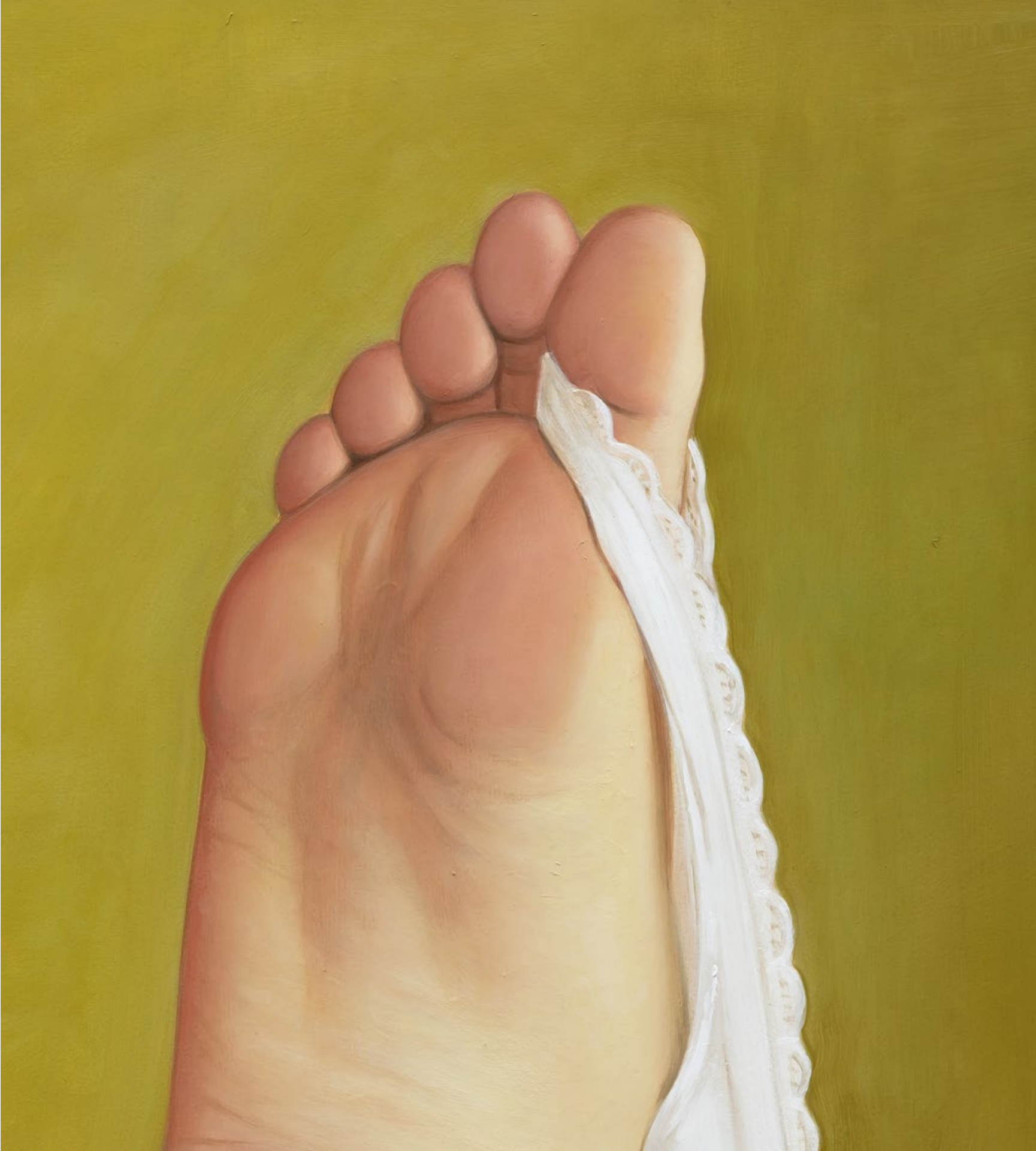
Windstill | 2023 | Mixed media on MDF | 27 1/2 x 19 3/4 in, 70 x 50 cm | (FGE23.016)