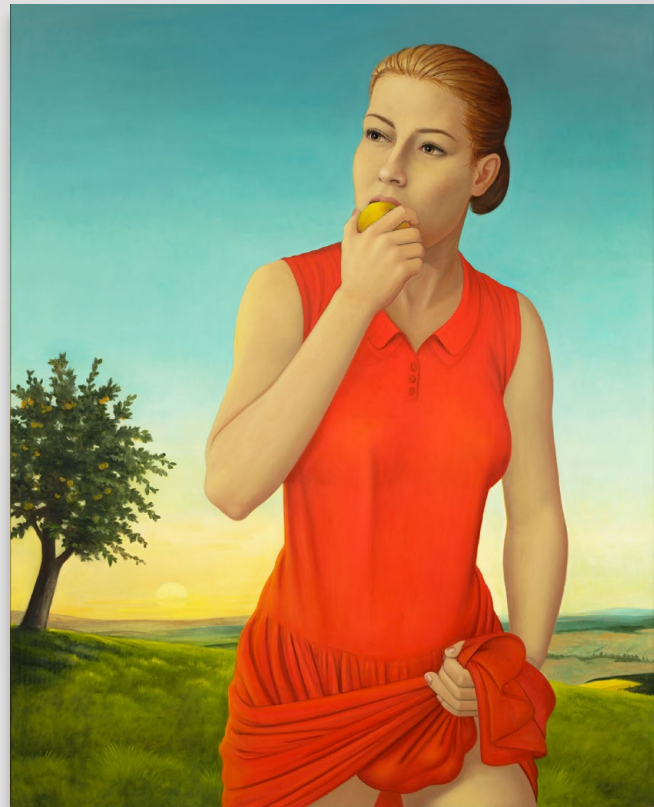
An apple a day | 2023 | Acrylic and oil on canvas | 78 3/4 x 63 in, 200 x 160 cm | (FGE23.009)