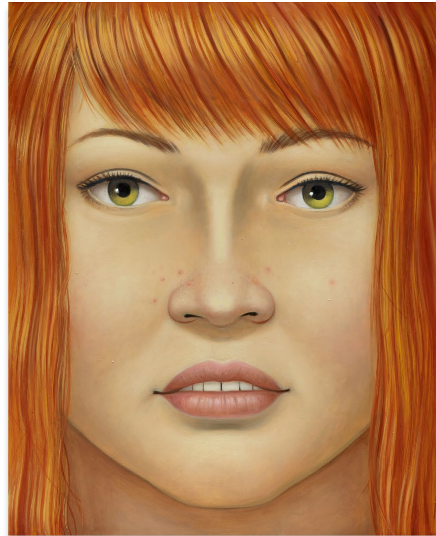
Spots | 2023 | Mixed media on MDF | 19 3/4 x 15 3/4 in, 50 x 40 cm | (FGE23.019)