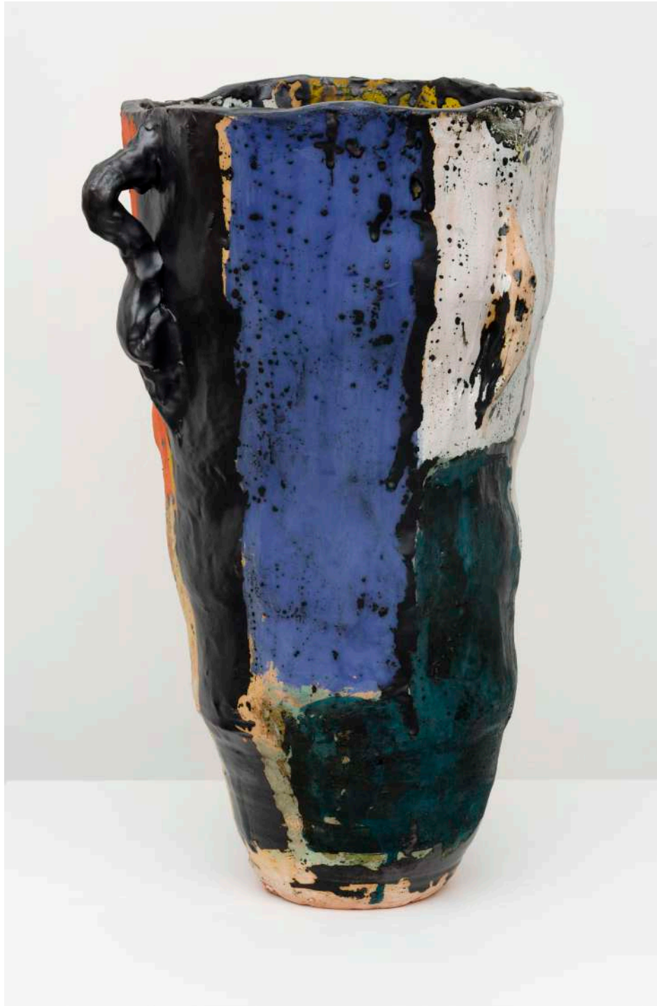
Tall Vessel, 2022 Ceramic 24 x 17 x 14 in 61 x 43.2 x 35.6 cm (ROH22.008)