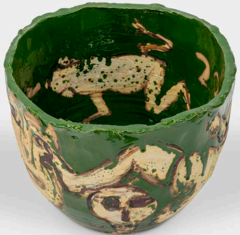
Untitled, 2022 Glazed ceramic 18 x 12 in 45.7 x 30.5 cm (ROH23.023)