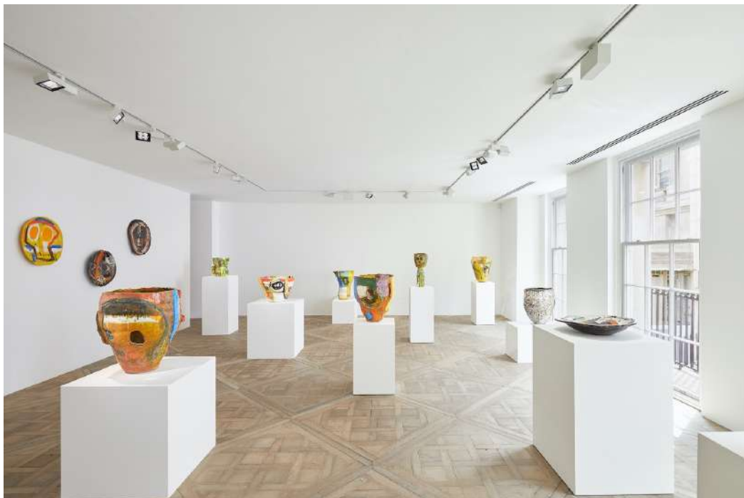
"Roger Herman: A Collection of Unique Ceramics and Paintings" (2019) at Carpenters Workshop Gallery, London

I started to paint the interiors, classrooms, and buildings from photographs, using a slide projector. I painted in