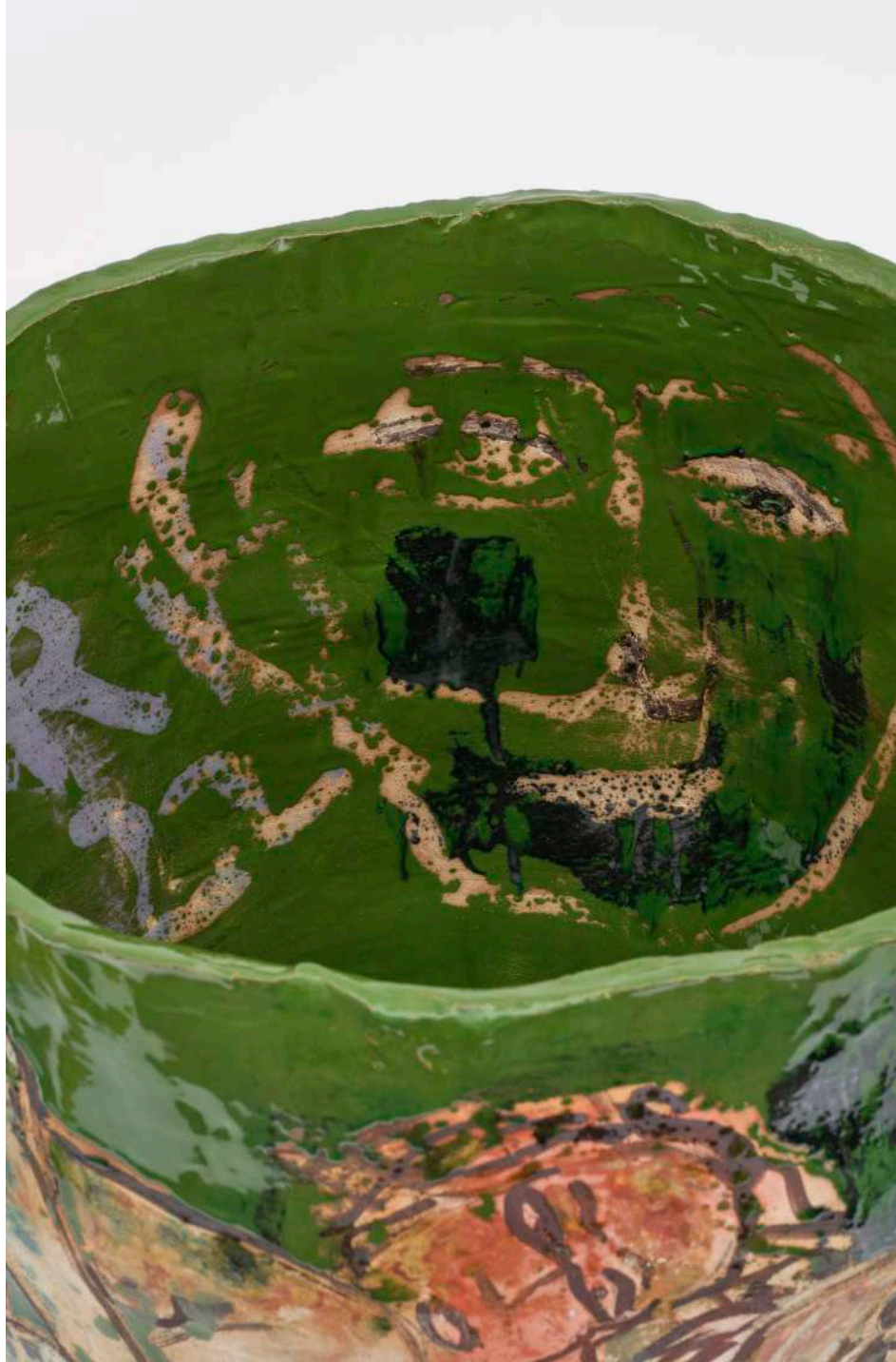
Untitled, 2022 Glazed ceramic 23 1/2 x 20 x 18 1/2 in 59.7 x 50.8 x 47 cm (ROH23.074)