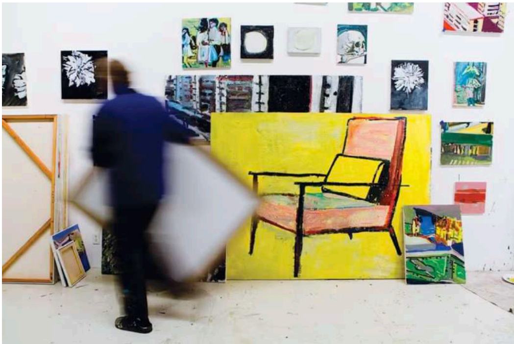
Carpenters Workshop Gallery

Carpenters Workshop Gallery just launched an online viewing room featuring vivid ceramic works by LA-based artist Roger Herman. Channeling the loose and abstract styles found in the neoexpressionist movement, Herman maintains an intuitive approach to developing paintings and sculptures that feature a wide range of hand-painted subjects including skulls, chairs, shapes, interiors, and more.