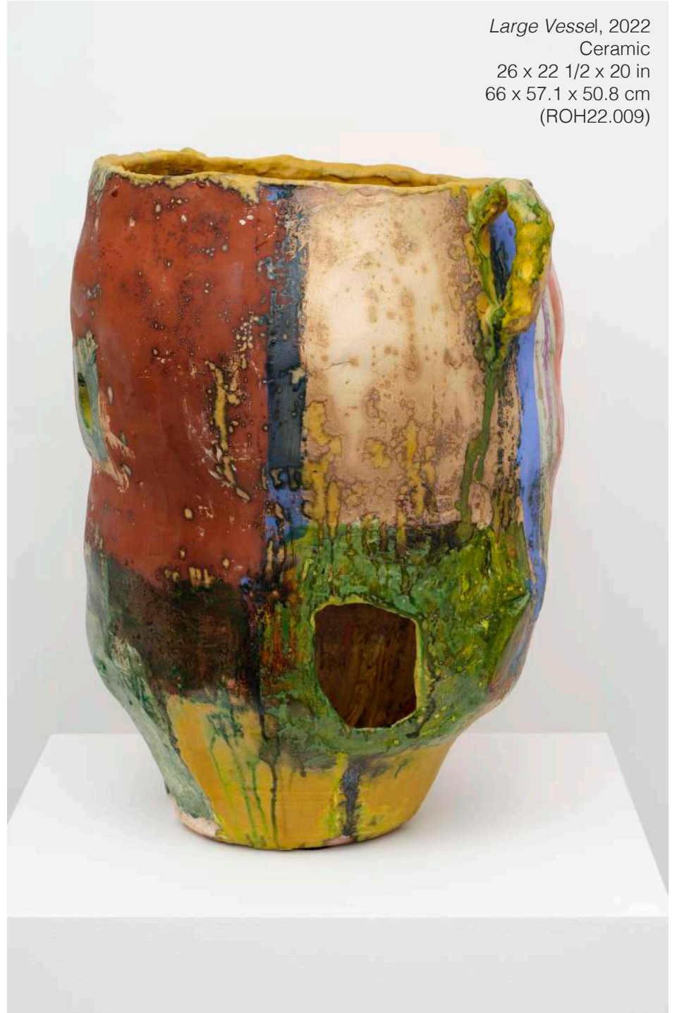
Large Vessel, 2022 Ceramic 26 x 22 1/2 x 20 in 66 x 57.1 x 50.8 cm (ROH22.009)