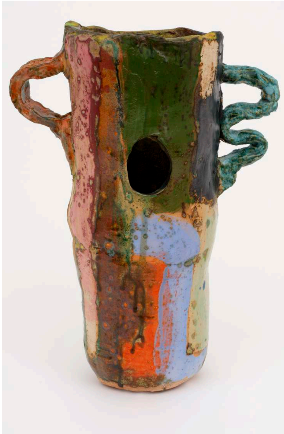
Untitled, 2022 Glazed ceramic 19 1/4 x 14 x 8 1/2 in 48.9 x 35.6 x 21.6 cm (ROH23.054)