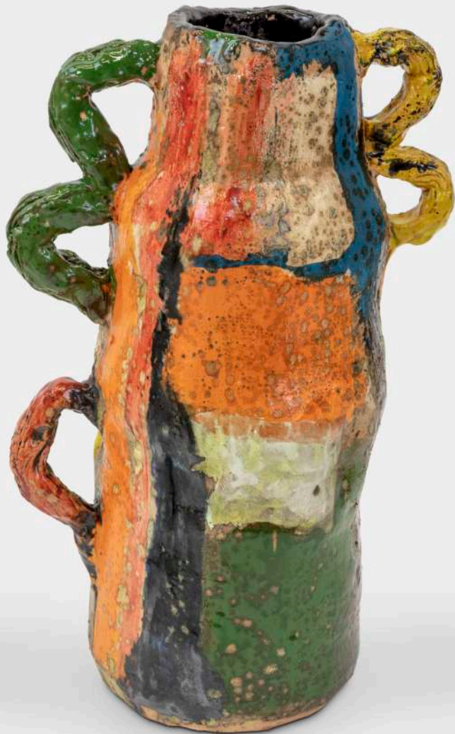
Untitled, 2022 Glazed ceramic 19 x 11 1/2 x 8 1/4 in 48.3 x 29.2 x 21 cm (ROH23.026)