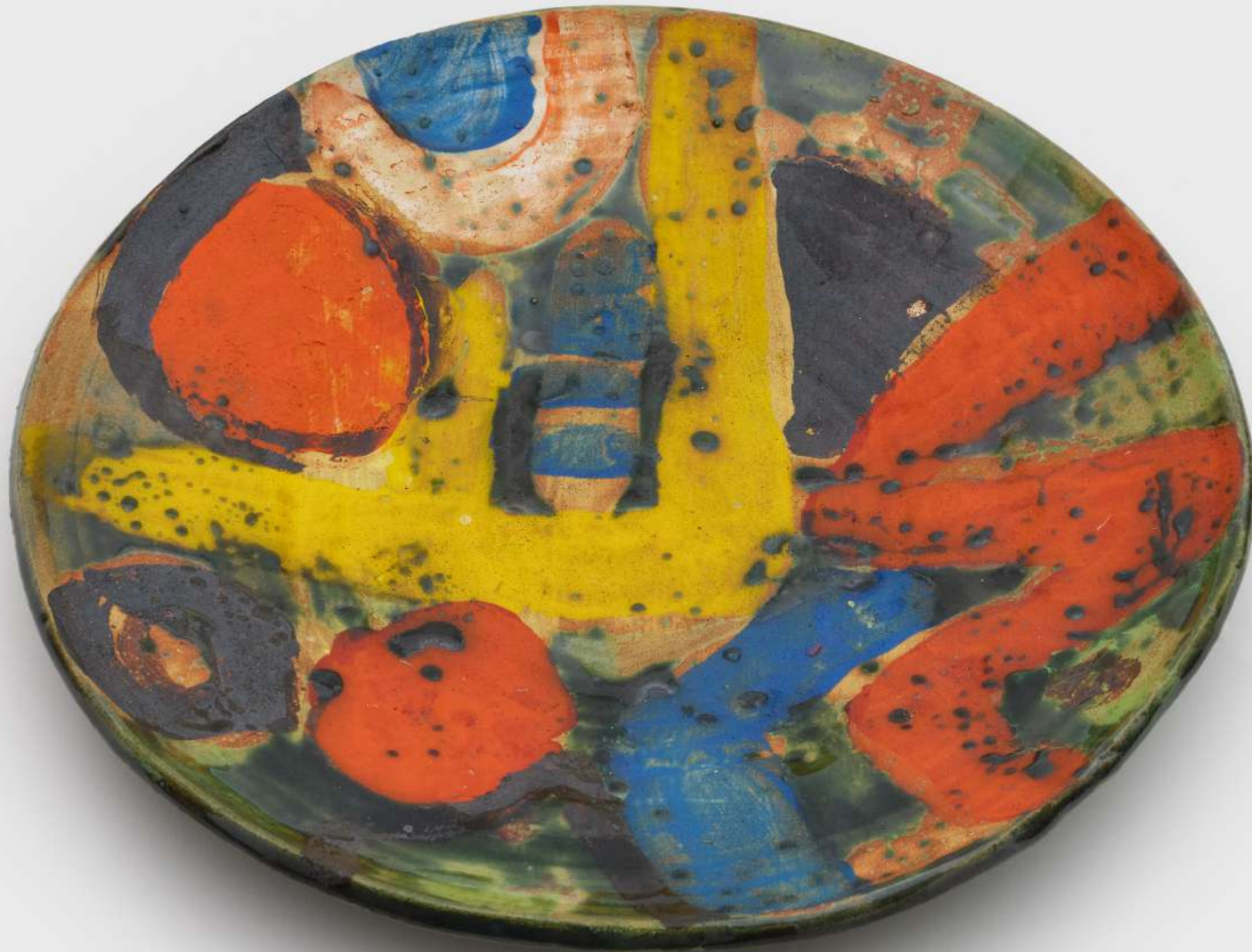
Untitled, 2022 Glazed ceramic 15 3/4 x 15 3/4 x 2 1/4 in 40 x 40 x 5.7 cm (ROH23.168)