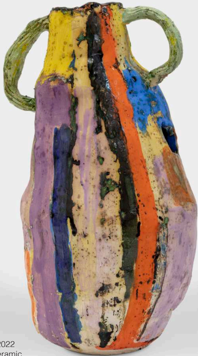
Untitled, 2022 Glazed ceramic 23 1/2 x 12 1/2 x 9 1/2 in 59.7 x 31.8 x 24.1 cm (ROH23.033)